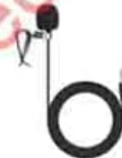
⑧ External microphone