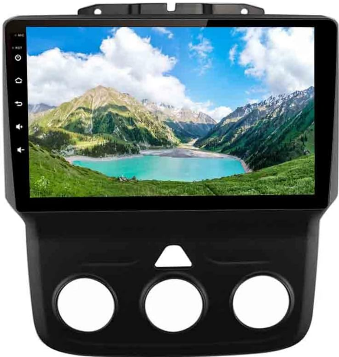
Figure 1.1: XISEDO Android Car Stereo Head Unit