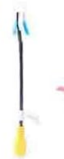
③ CAM Cable