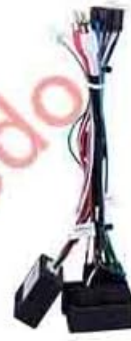
① Power Harness