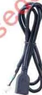
④ USB Cable 1