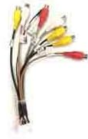
② RCA Cable