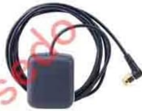
⑥ GPS Antenna