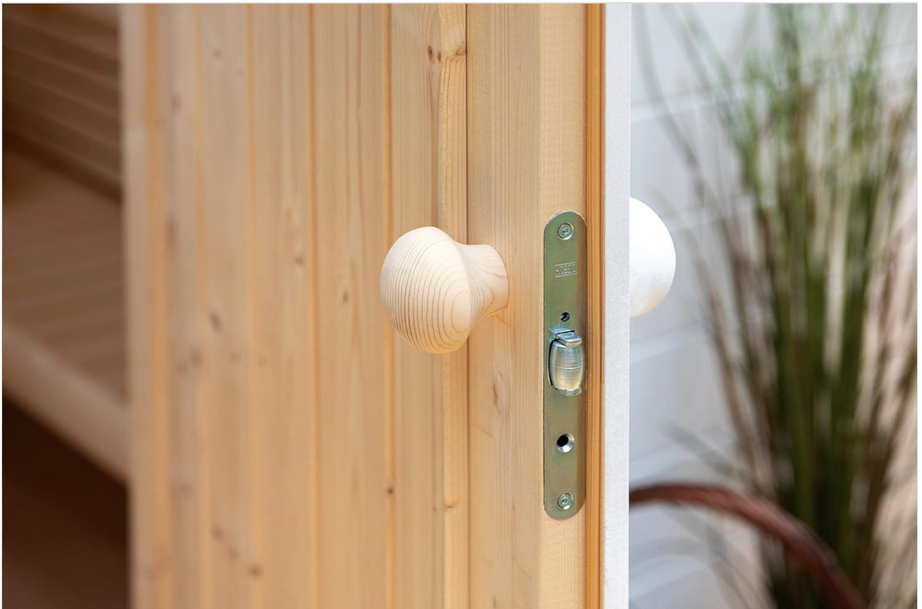
Figure 5: Detail of the sauna door handle, made from natural wood.