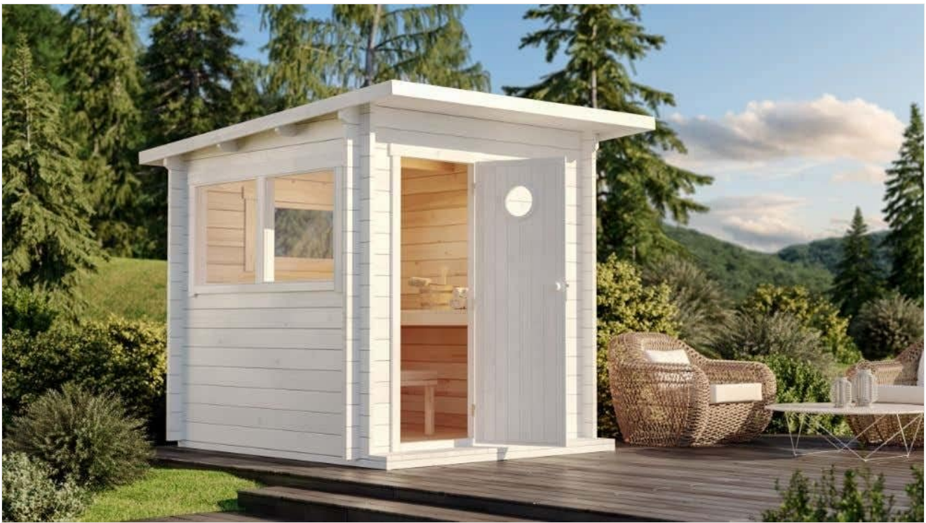
Figure 1: Exterior view of the Polhus Jorma outdoor sauna, showcasing its modern design and integration into a garden environment.