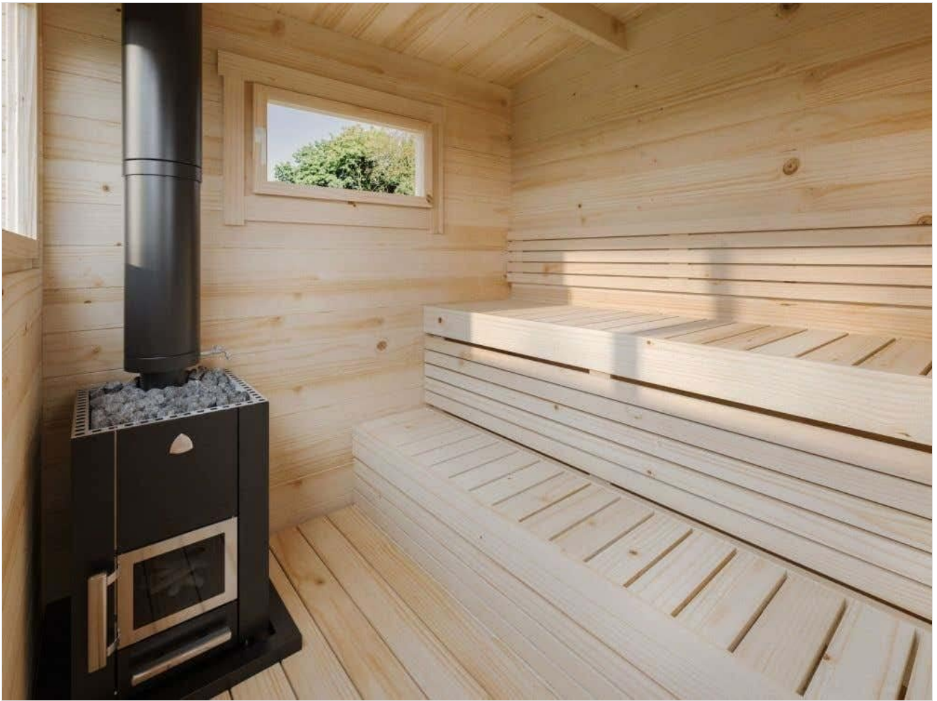
Figure 4: Interior view of the sauna, featuring the aspen wood benches and space for a sauna heater.