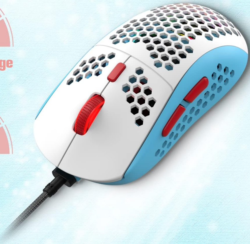
Image: Illustration of the KUIYN 383 PRO mouse's wide compatibility with various operating systems including Windows, Mac, and Linux.