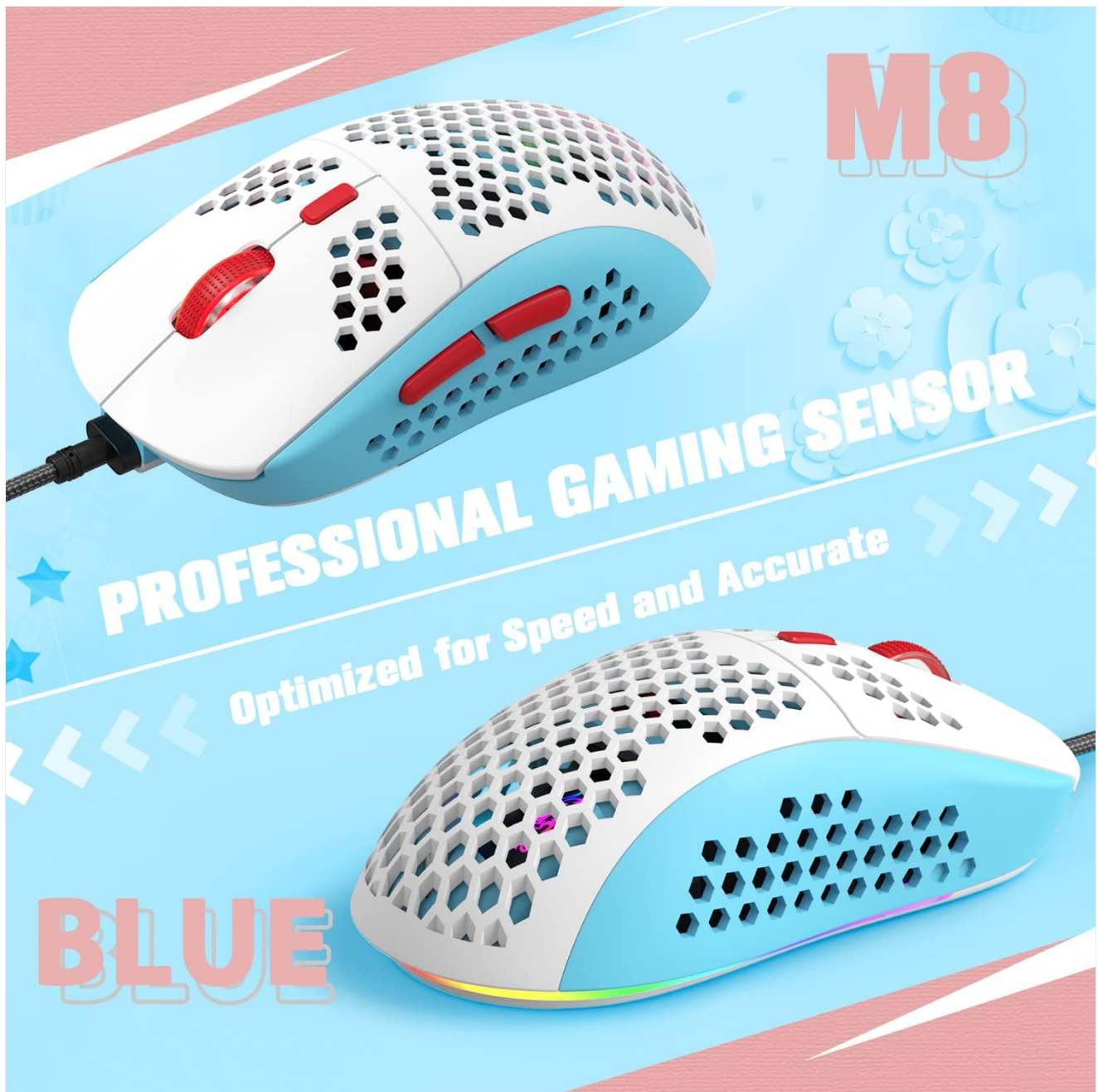
Image: The KUIYN 383 PRO gaming mouse, highlighting its professional gaming sensor and lightweight design.