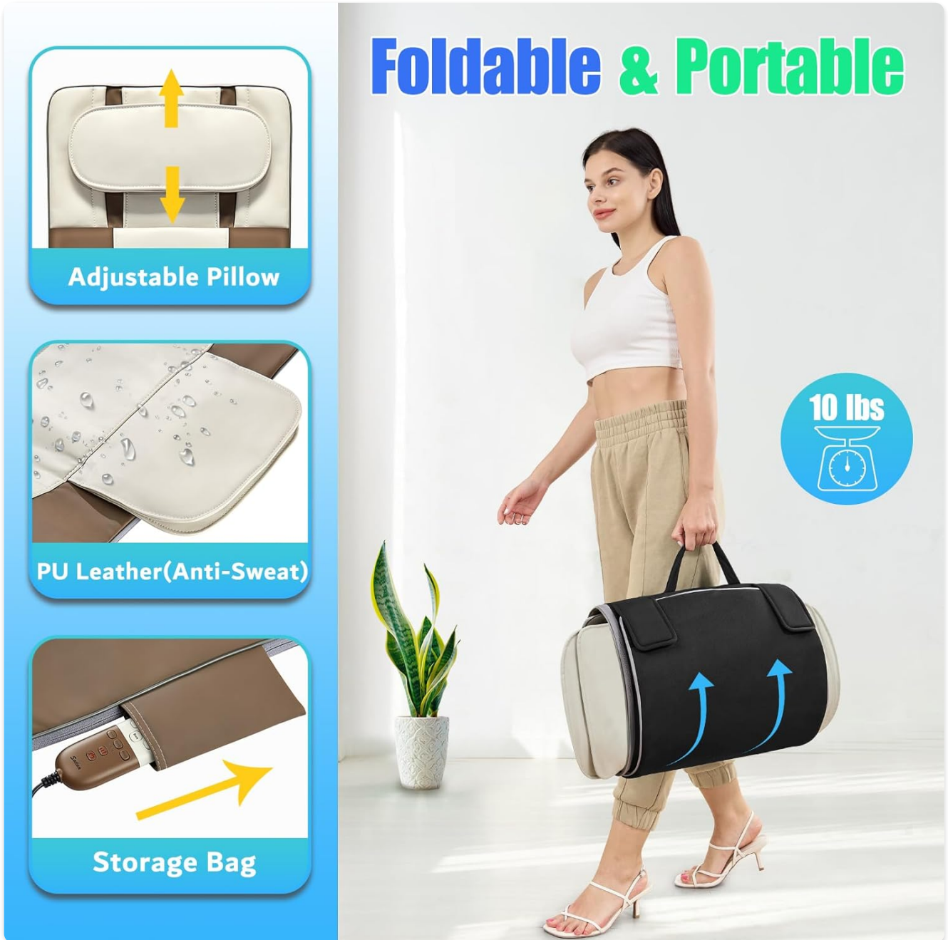
Figure 2: The massage mat features an adjustable pillow and a foldable design for portability.