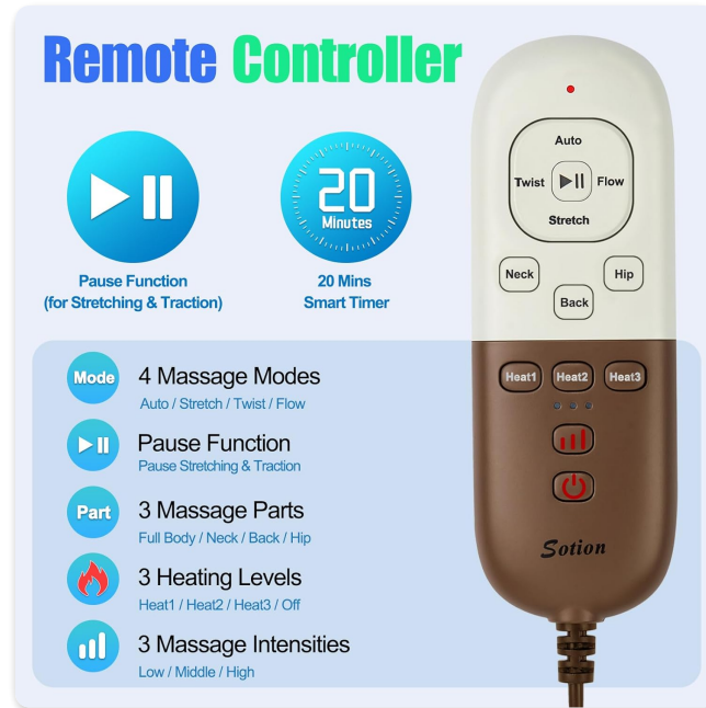
Figure 3: Handheld Remote Control for the Full Body Massage Mat.