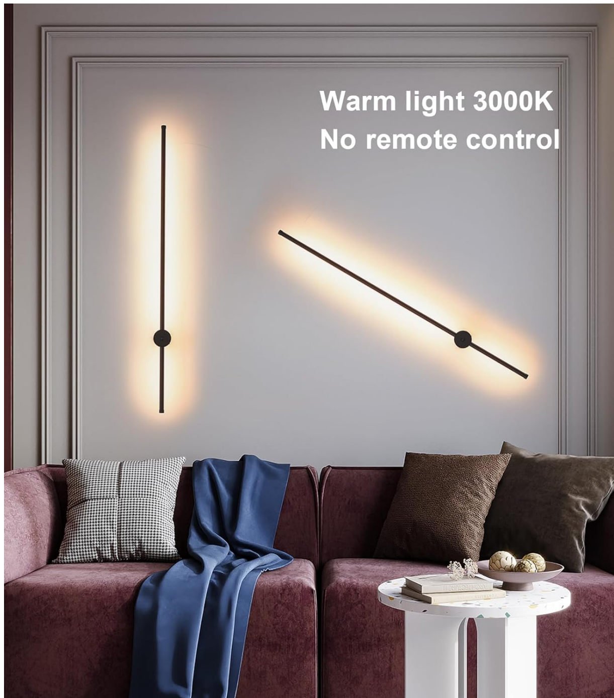
Image: Sconce emitting warm light.