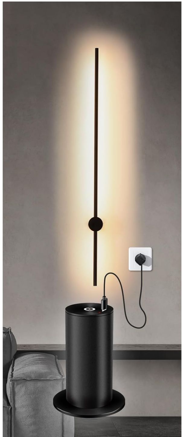
Image: Aanyhoh Battery Operated Wall Sconces in a modern setting.