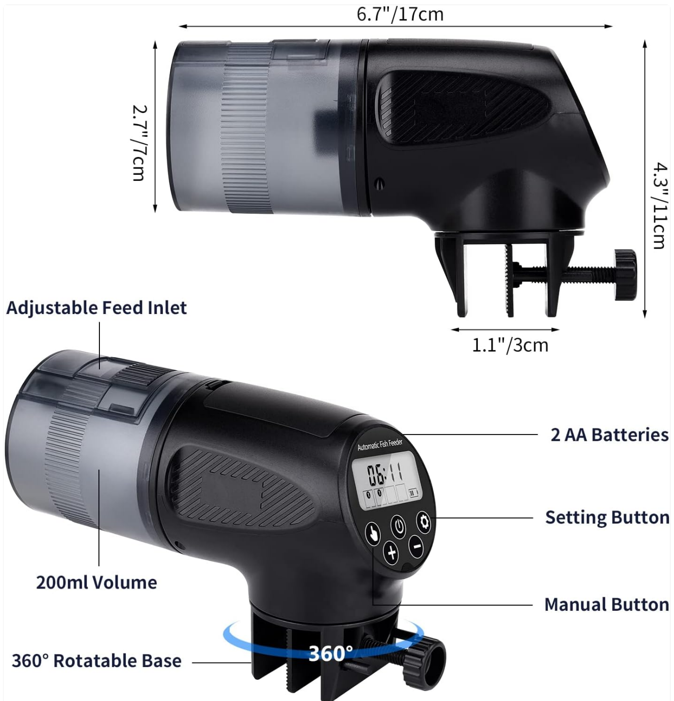
Detailed dimensions of the Aoyar Automatic Fish Feeder, indicating its length, height, and width.