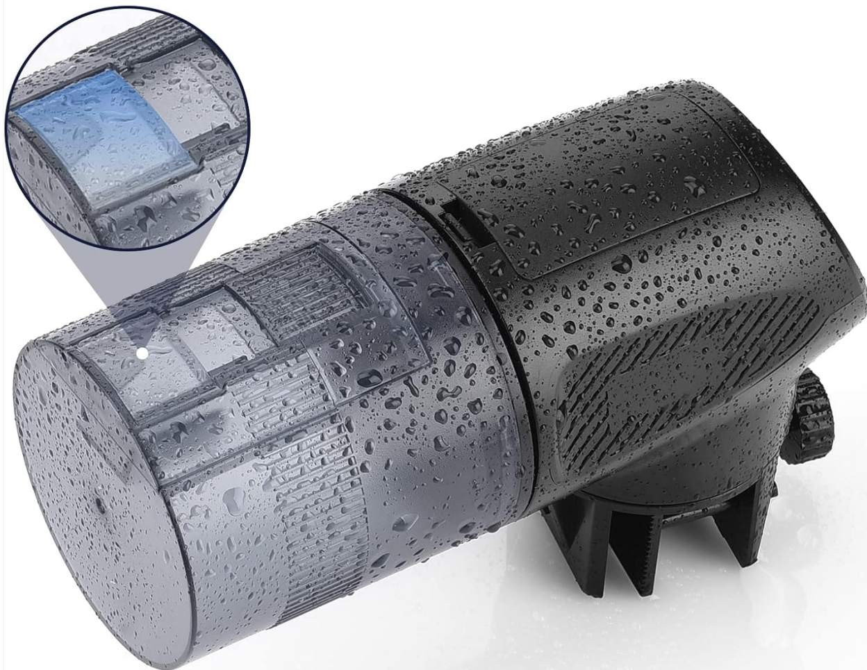
Illustration of the moisture-proof design, showing how the feeder prevents feed from clumping due to humidity.

The design is able to prevent feed from lumping because of humidity.