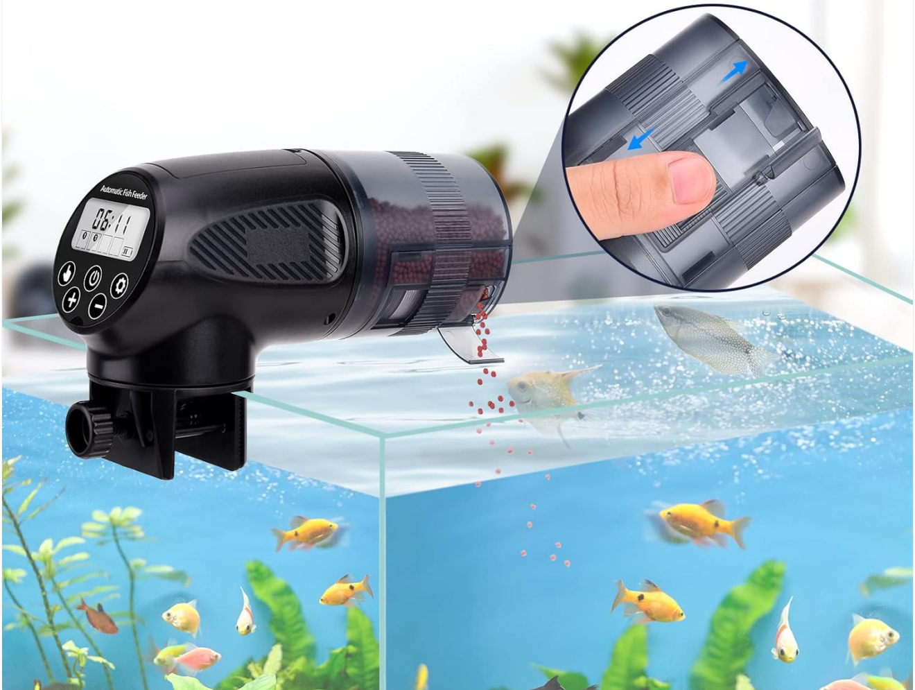
View of the upgraded food outlet, demonstrating the baffle's role in controlling food quantity.

The baffle plays efficient role in reducing feed pellets and control the food quantity.