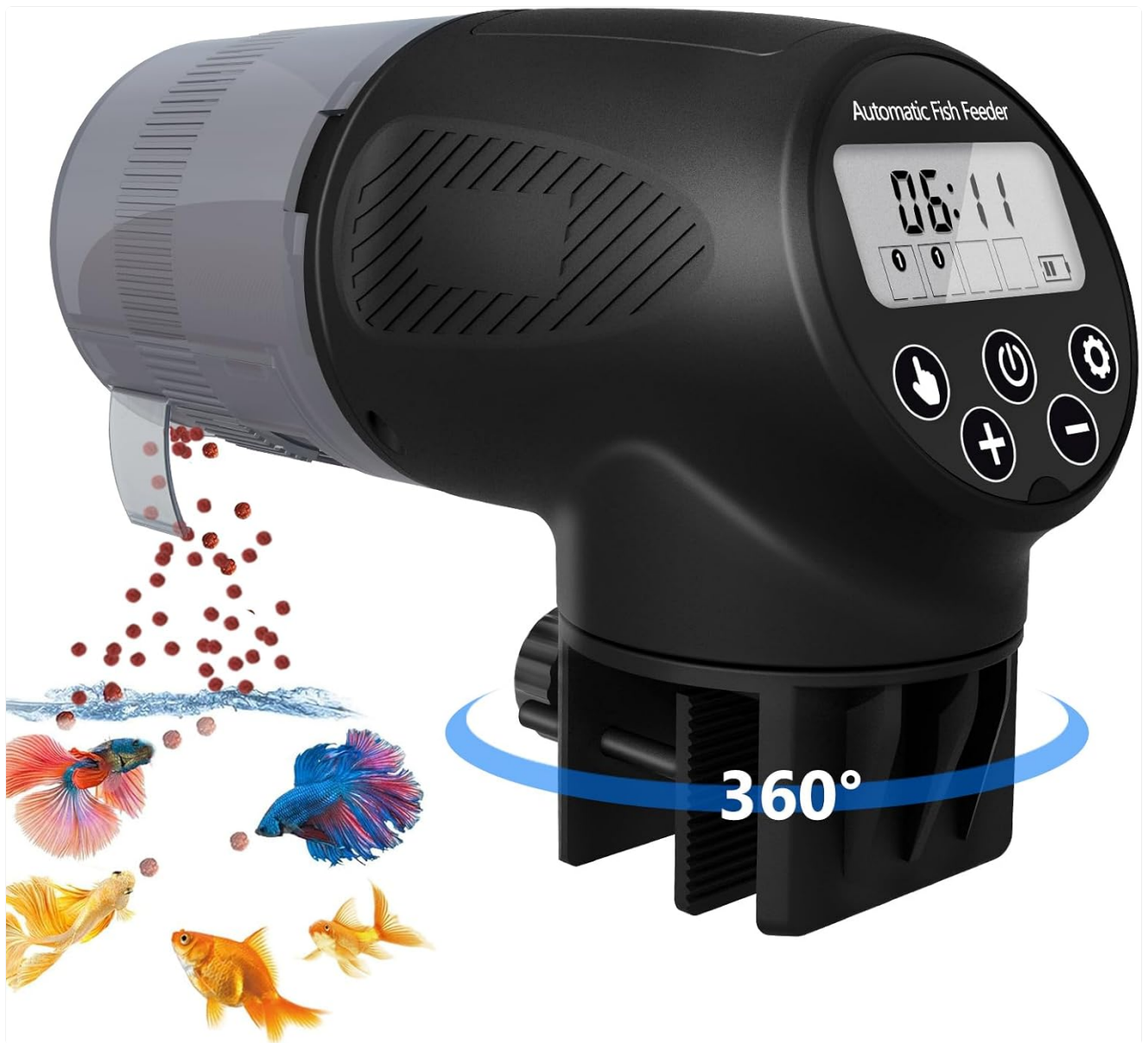
The Aoyar Automatic Fish Feeder, showing its main components and the 360-degree rotatable base.