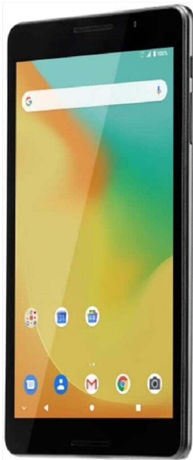
Figure 2.2: Angled front view of the ZTE Grand X View 4 tablet, showing the screen and side buttons.