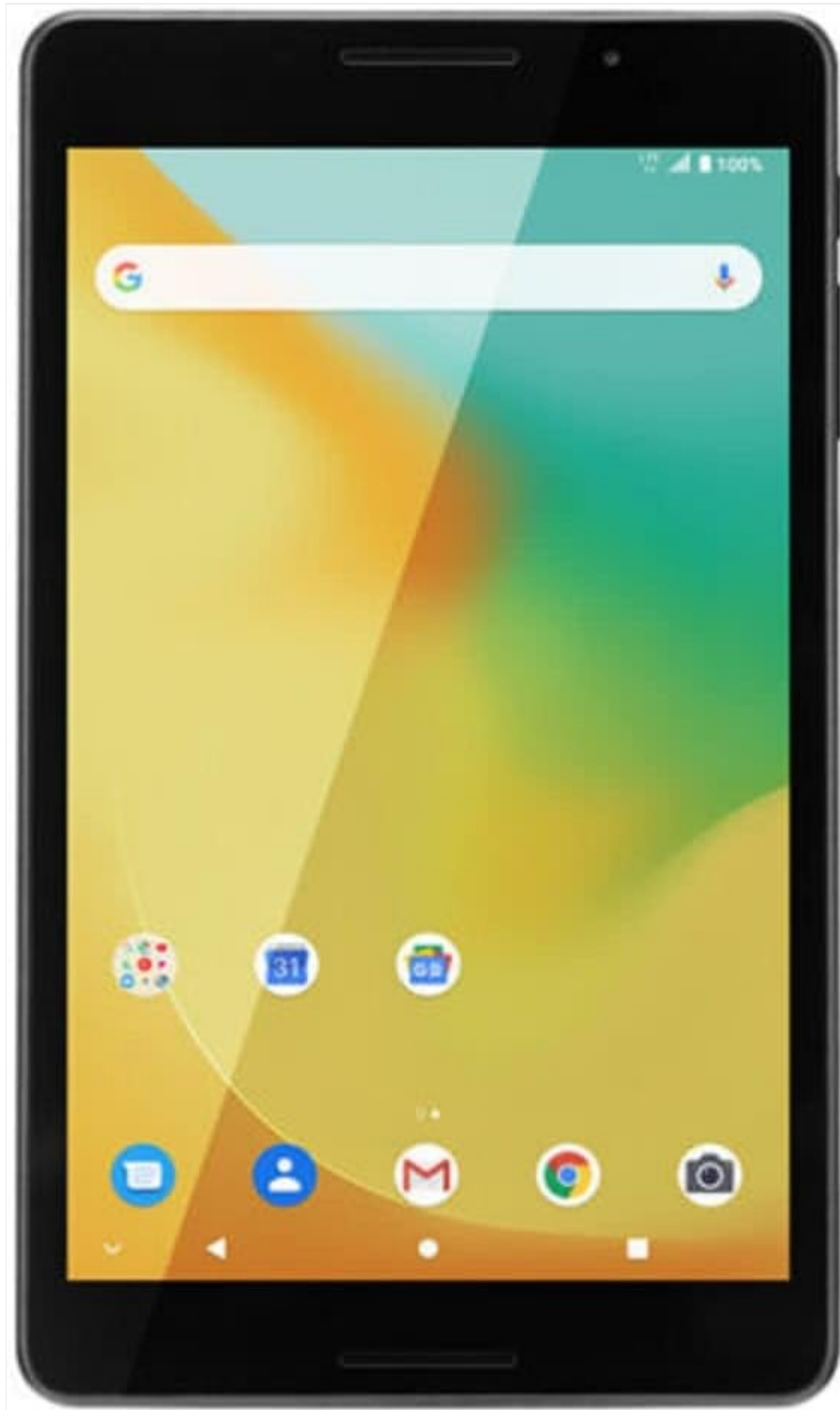
Figure 5.1: Front view of the ZTE Grand X View 4 tablet, showing the vibrant home screen with various app icons.

The tablet features a 5MP rear camera. Open the Camera app from the home screen or app drawer. Tap the shutter button to take a photo. You can switch between photo and video modes within the app.