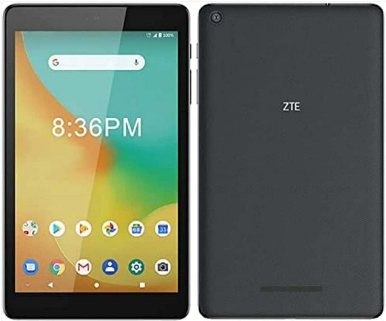
Figure 2.1: Front and back view of the ZTE Grand X View 4 tablet. The front shows the display with app icons and time, while the back displays the ZTE logo and camera lens.