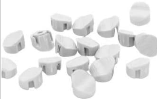
Figure 1: Included components: Frame, Screws, and Plugs.