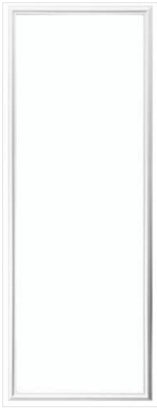
Figure 2: The door frame kit does not include glass. Glass must be purchased separately.