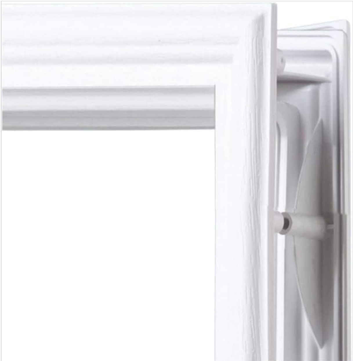
Figure 5: Detail of the frame connection mechanism.