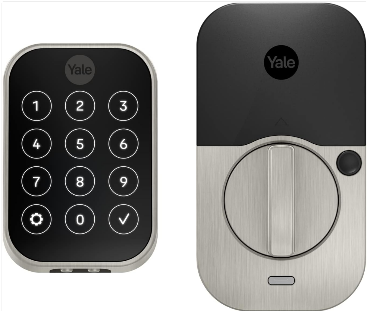
Yale Assure Lock 2 Deadbolt exterior keypad and interior thumbturn assembly in Satin Nickel.