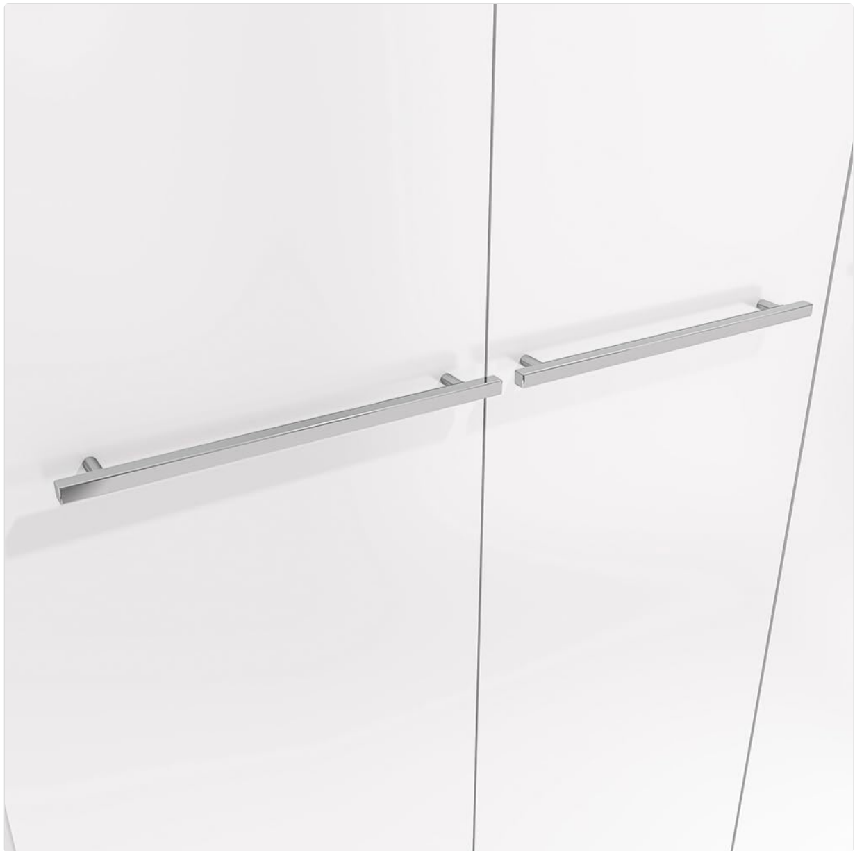
Figure 5.3: Detail of the modern, discreet handles on the closet doors.