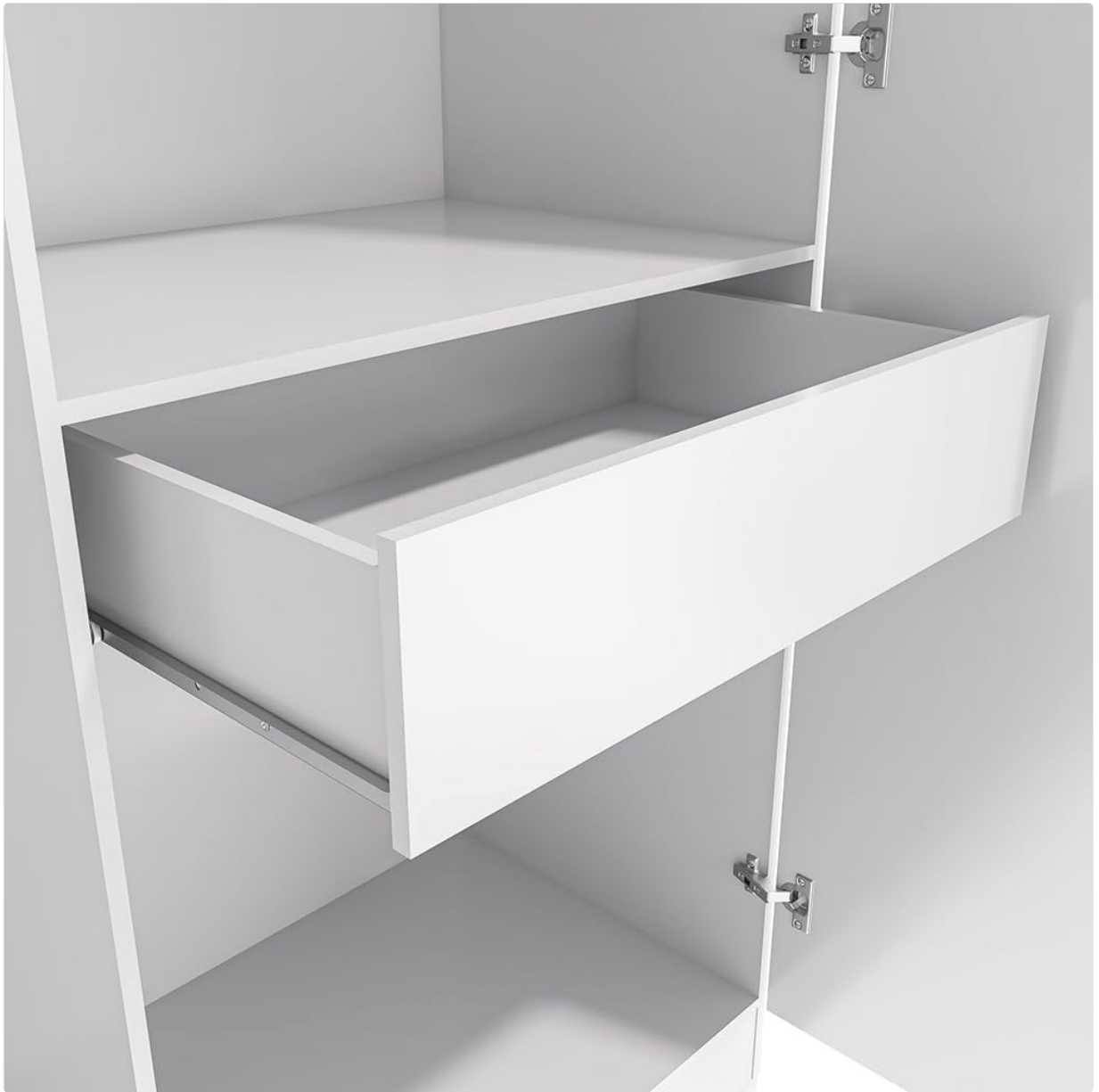
Figure 5.2: Detail of the drawer with metallic slides, demonstrating smooth functionality.