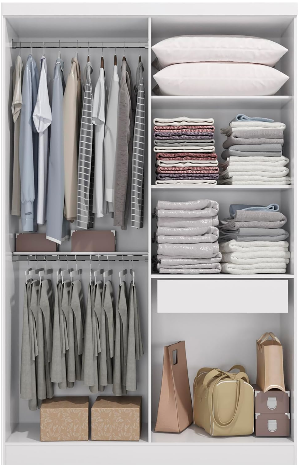
Figure 5.1: Example of organized storage within the closet, utilizing hanging space and shelves.