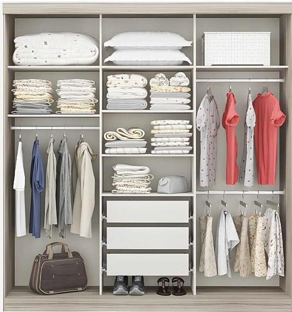
Image 2: Internal structure of the wardrobe with shelves and hanging rails.