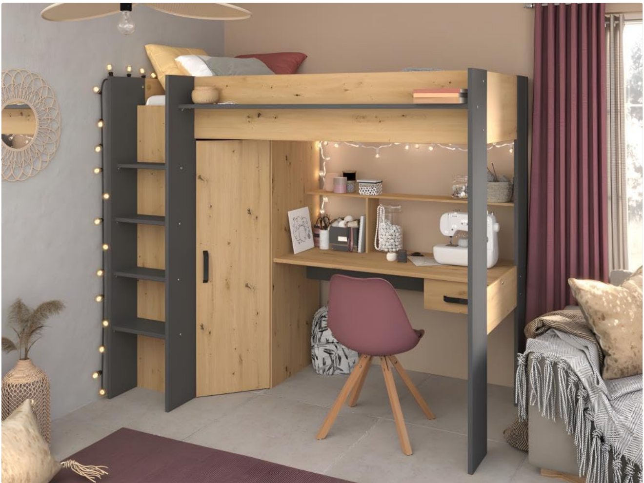
Figure 4.1: The Auckland Loft Bed in a typical room setup, demonstrating its functionality.