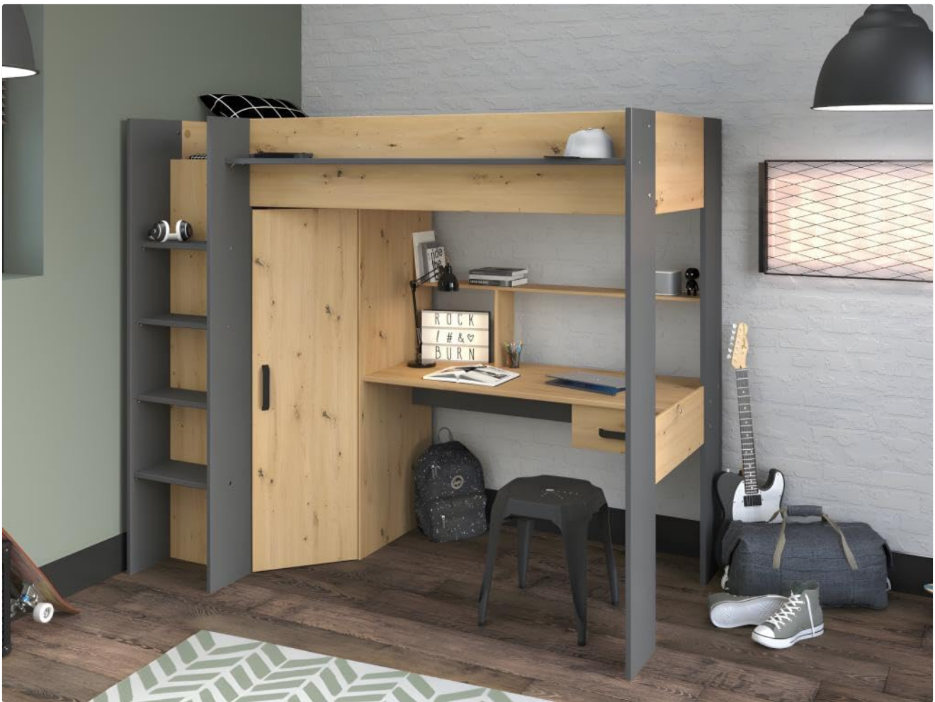
Figure 2.1: The Auckland Loft Bed, showcasing the bed, desk, and wardrobe.