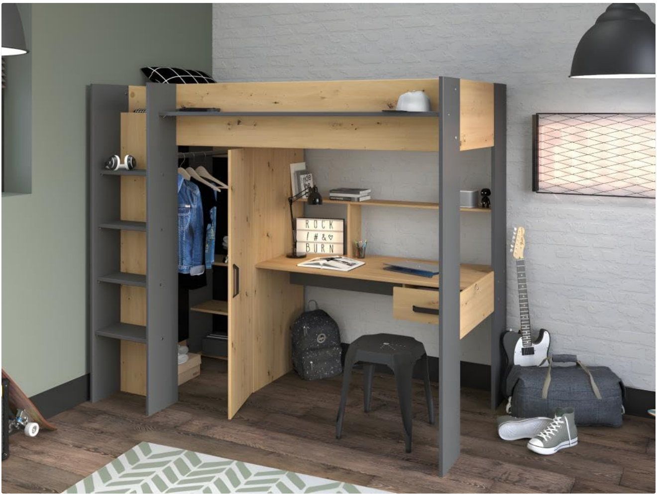
Figure 3.2: The integrated wardrobe with its door open, revealing internal shelving and hanging space.