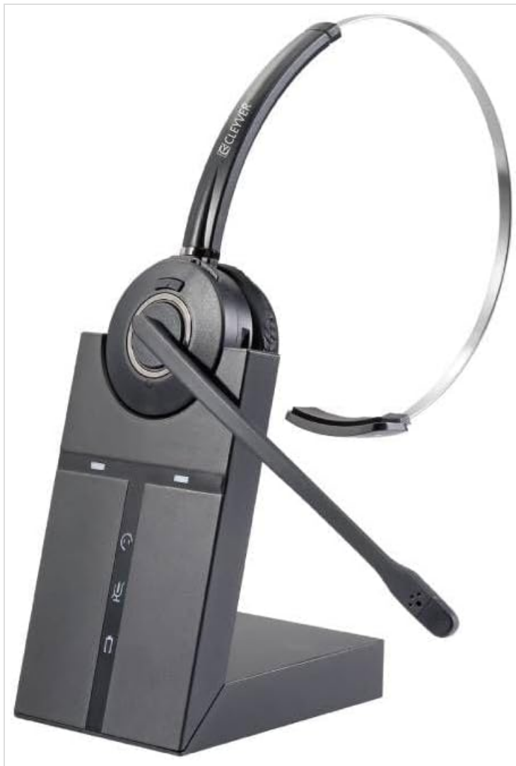
Image 3.1: The Cleyver ODHW30 Mono Wireless DECT Headset resting on its charging base station. The headset features a single ear cup and an adjustable microphone boom. The base station has indicator lights and control buttons.