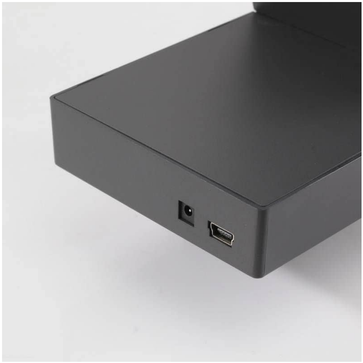
Image 3.2: A close-up view of the rear ports on the Cleyver ODH30 DECT base station, showing the power input and a USB port for connectivity.