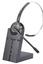
Image 4.2: An icon representing connectivity, illustrating the wireless connection between the headset and its base station.