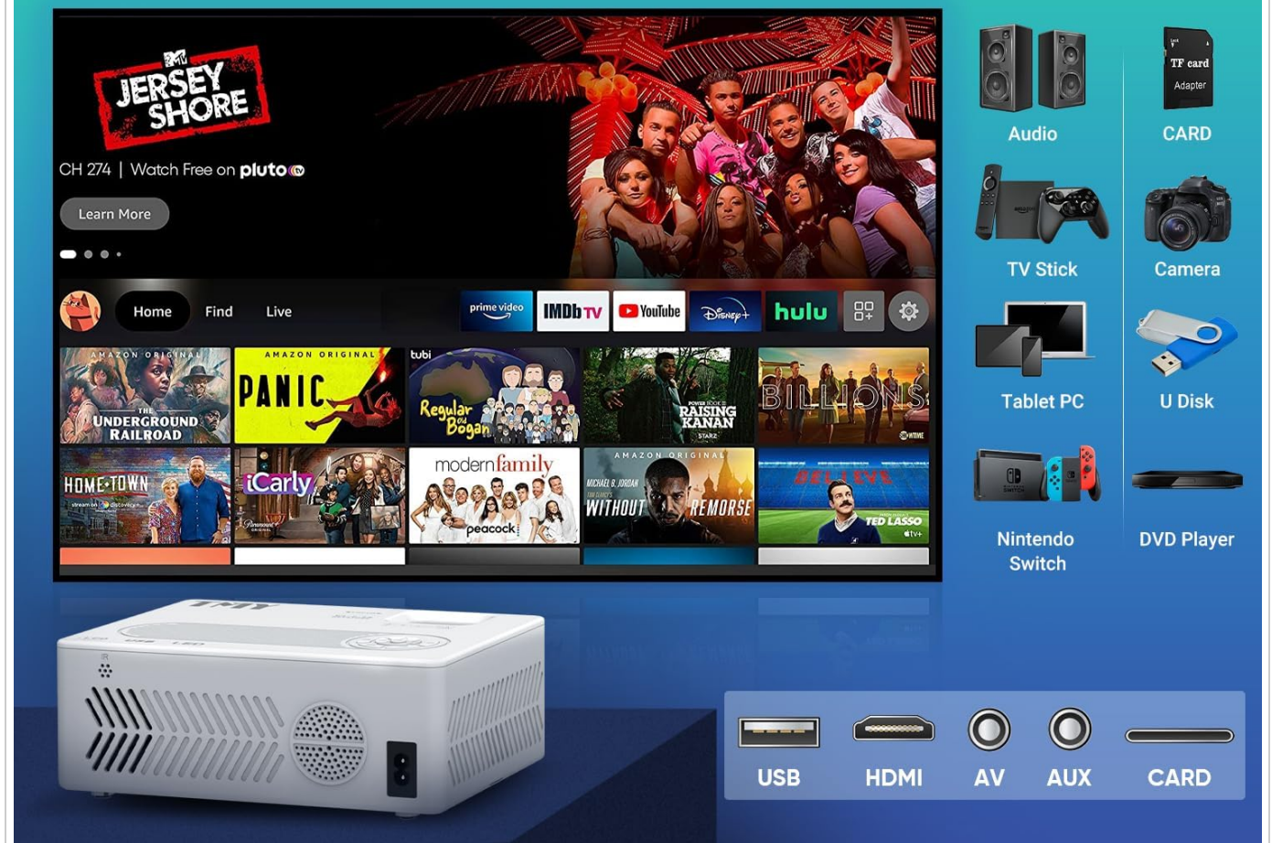
Image: An illustration of the projector connected to various devices such as audio systems, TV sticks, cameras, tablet PCs, Nintendo Switch, and DVD players, demonstrating its broad compatibility. The image also highlights the USB, HDMI, AV, and AUX ports.