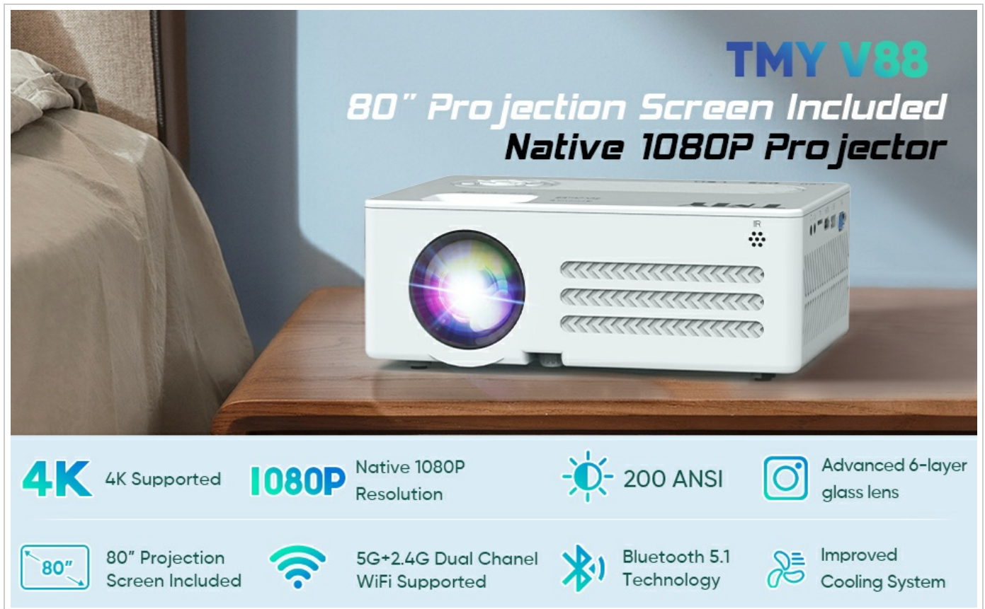
Image: Infographic highlighting key features such as 4K support, Native 1080P, 200 ANSI Lumen, 80" screen, 5G+2.4G WiFi, Bluetooth 5.1, and 250" large display. This image visually summarizes the core capabilities of the TMY V88 projector.