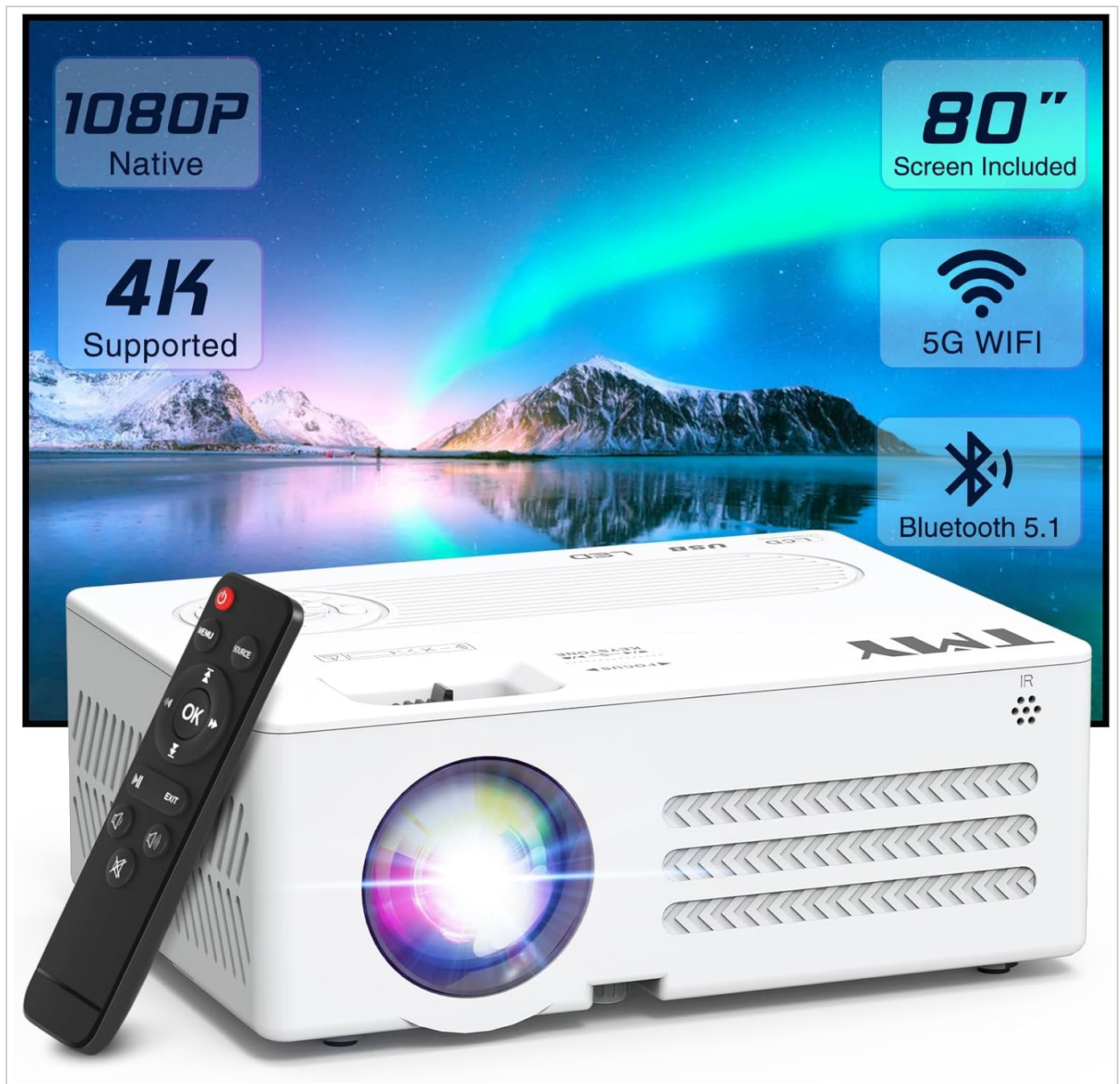
Image: TMY V88 Projector with remote, cables, and screen. This image displays the main projector unit, remote control, power cable, HDMI cable, AV cable, and the folded projection screen, illustrating the complete package contents.