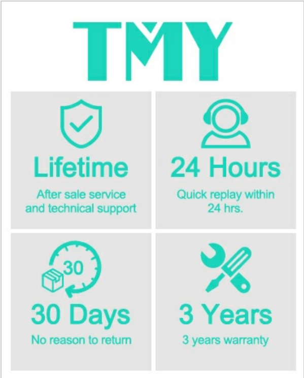
Image: Graphic detailing TMY's customer support offerings, including lifetime after-sale service, 24-hour quick replies, 30-day no-reason returns, and a 3-year warranty. This image reassures users about product support.