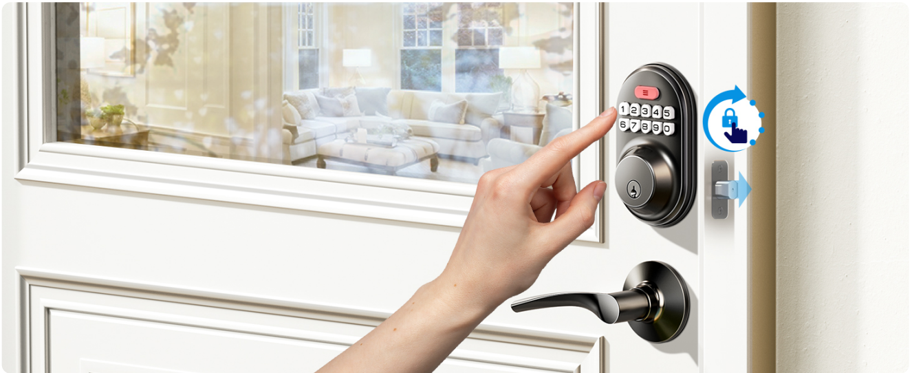
Image: A person demonstrating the one-touch locking feature by pressing a button on the keypad.