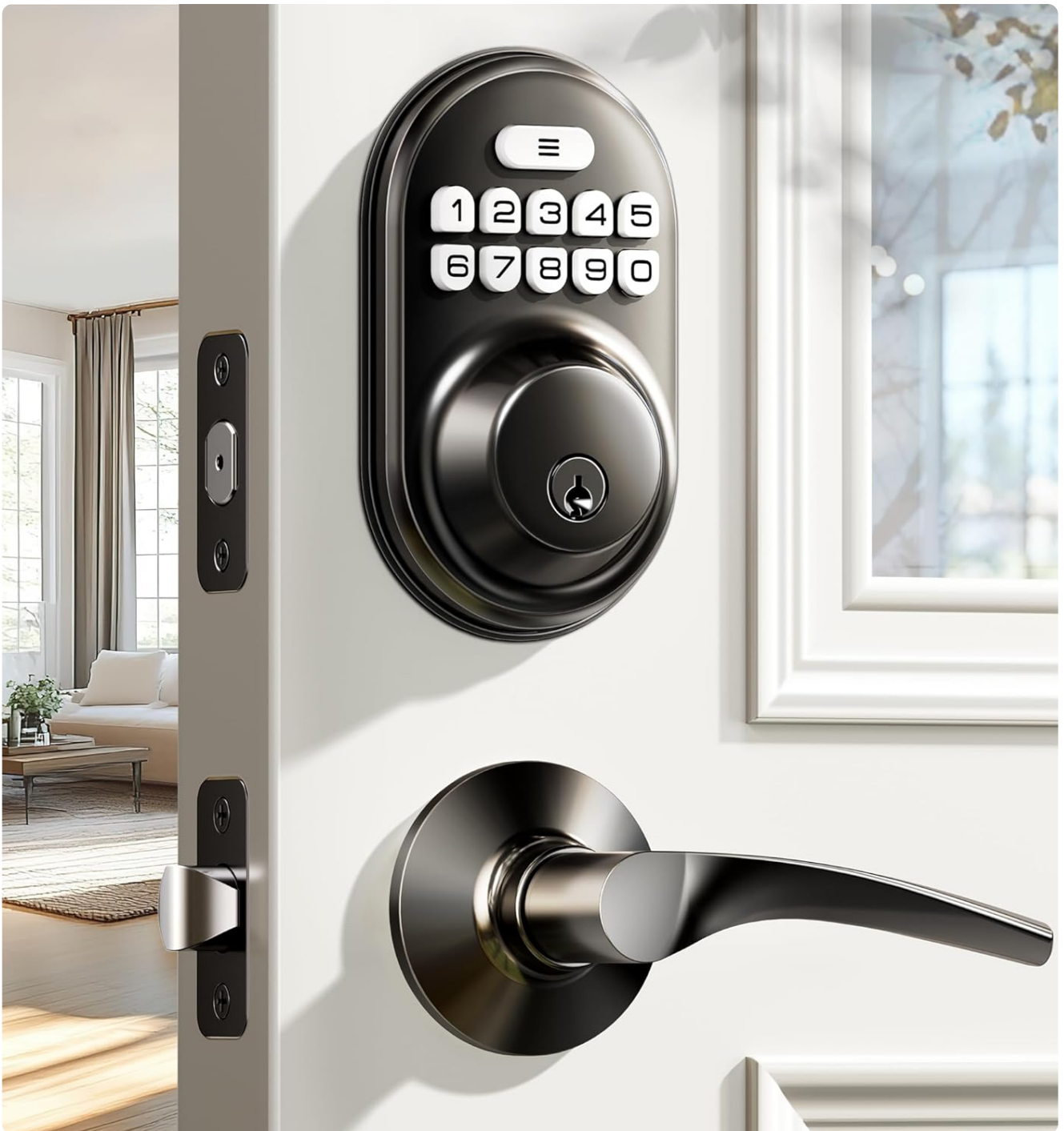
Image: All components of the Veise Keyless Entry Door Lock, including the keypad deadbolt, lever handles, and installation hardware.