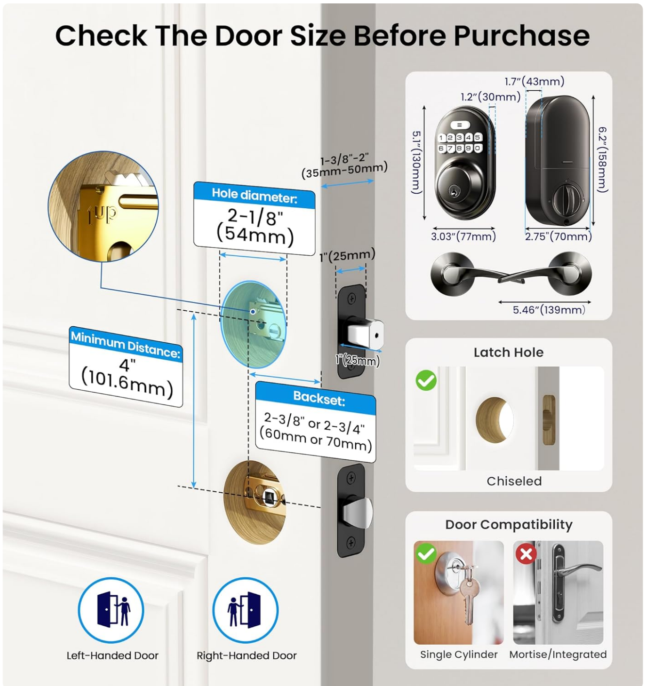
Image: Diagram illustrating required door dimensions, including hole diameter (2-1/8" or 54mm), backset (2-3/8" or 2-3/4"), and minimum distance (4").