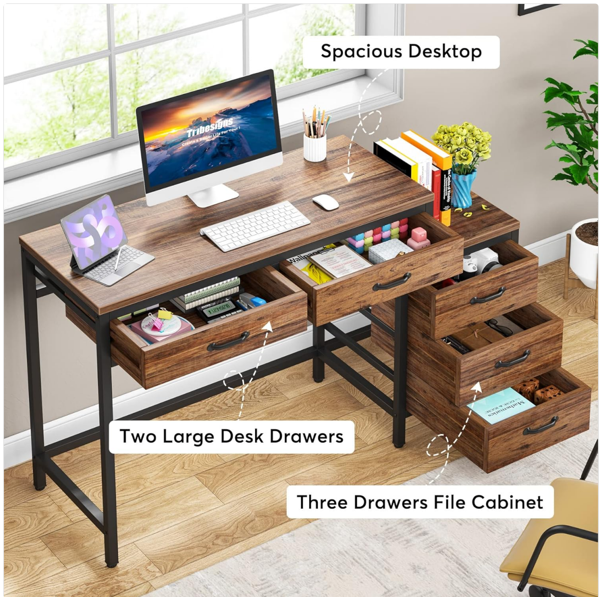
Image: The desk with its drawers open, showcasing the internal storage space for office supplies and personal items.