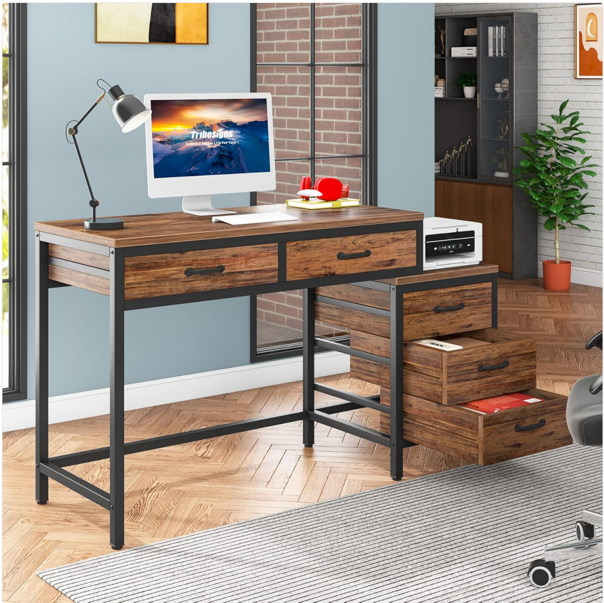
Image: The main desk frame assembled, featuring the desktop and two upper drawers.