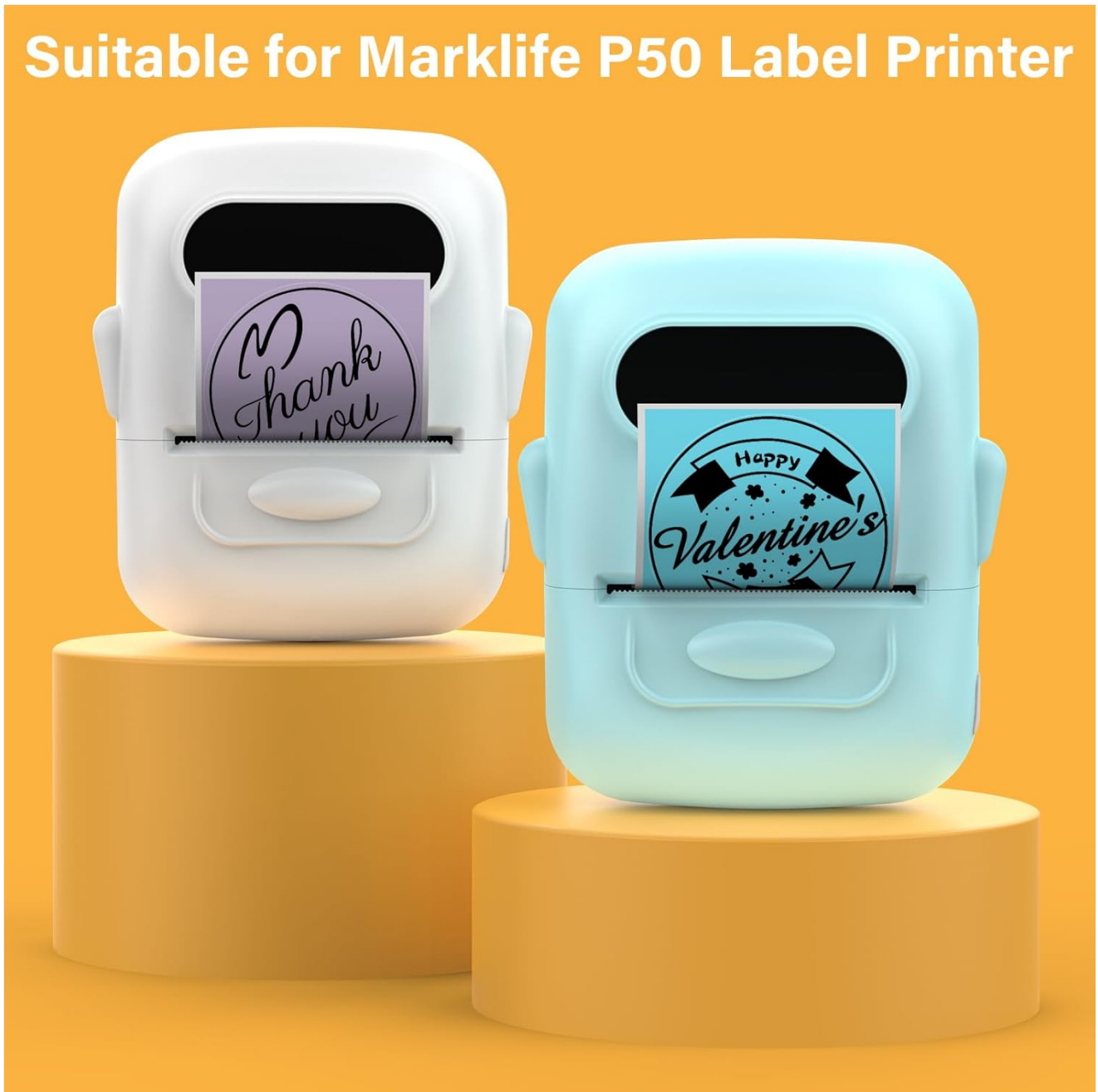
Image: Two Marklife P50 label printers, one white and one light blue, with labels loaded and partially printed. The white printer shows a 'thank you' label, and the blue printer shows a 'Happy Valentine's' label, demonstrating the labels in use within the compatible printer.