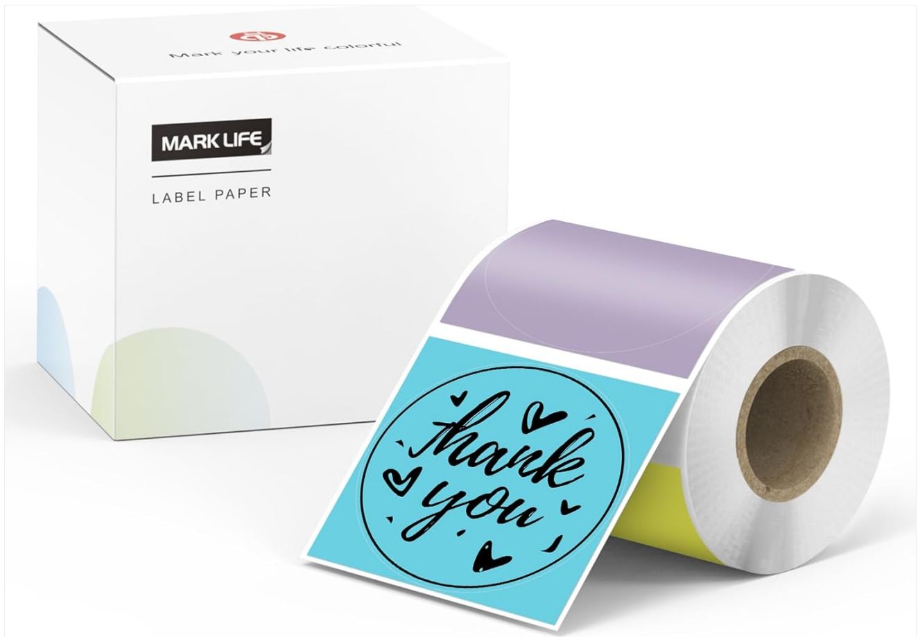
Image: A roll of MARKLIFE 2"x2" Direct Thermal Labels next to its packaging box. The labels are shown in various colors, including purple, blue, and yellow, with a 'thank you' design visible on one of the blue labels.