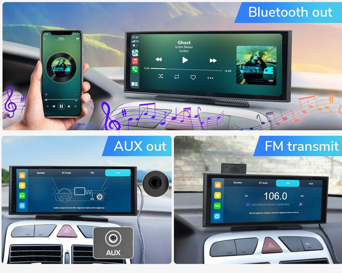
Image: Illustrations showing the three primary audio output methods for the Eonon P4: Bluetooth connection to a phone, AUX cable connection to a car's port, and FM transmission to the car's radio.

Audio can be transferred from the unit to your car speakers, maintaining the original sound quality.