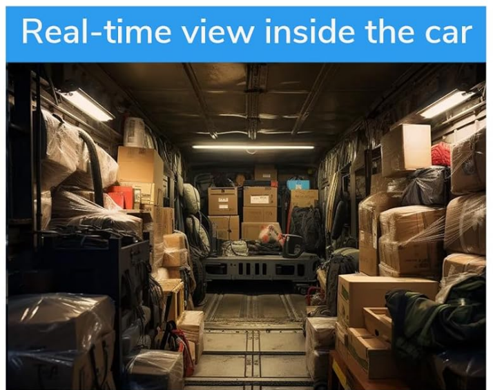
Image: The Eonon P4's 1080P backup camera, highlighting its IP68 waterproof design, display of backup guidelines, and a real-time view from inside a vehicle.