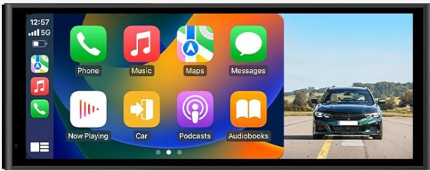
Android Auto/CarPlay+ Front/Backup Camera