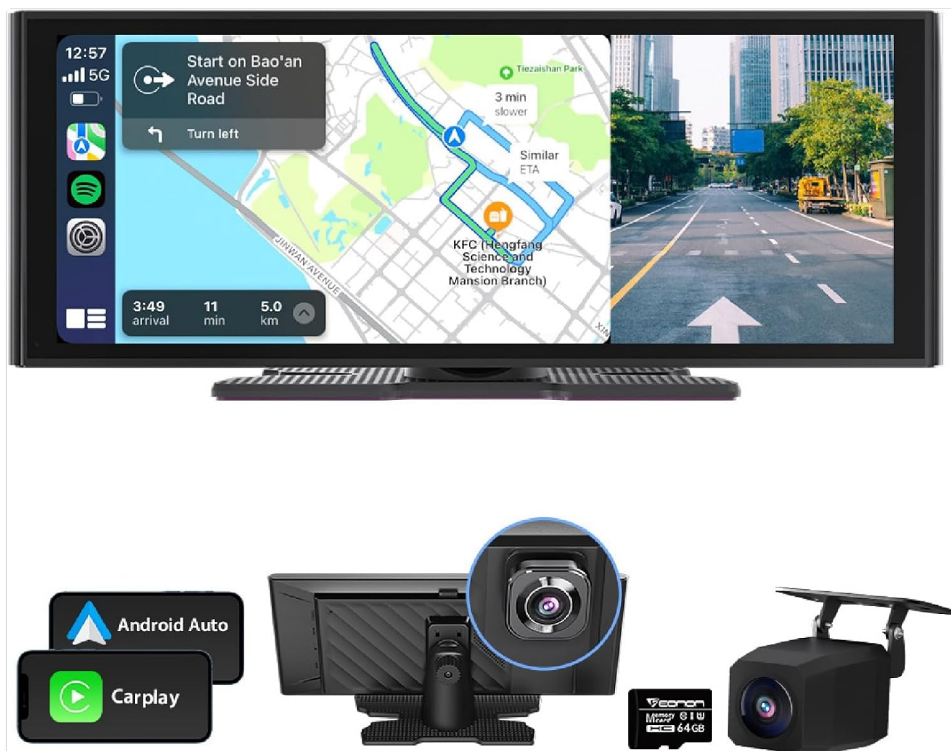
Image: The Eonon P4 dashcam car stereo displaying navigation with CarPlay, alongside icons for Android Auto and a backup camera.

The Eonon P4 is a versatile 10.26-inch portable car stereo system featuring a 4K front dashcam and a 1080p backup camera. It supports wireless CarPlay and Android Auto, screen mirroring, Bluetooth, and multiple audio output options. This manual provides detailed instructions for installation, operation, maintenance, and troubleshooting to ensure optimal performance and a safe driving experience.