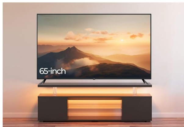
Image: Visual representation of the TV stand's dimensions and how various TV sizes (50-inch, 55-inch, 65-inch) fit on it.