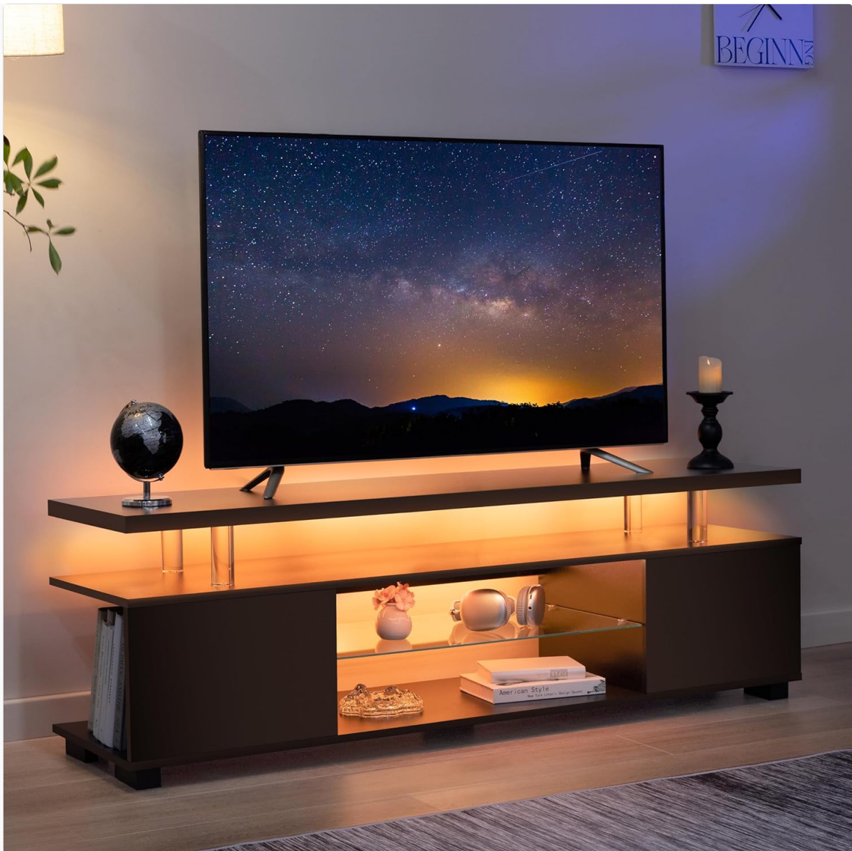
Image: The Cubehom 51-inch Black LED TV Stand in a living room setting, showcasing its design and ambient orange LED lighting.