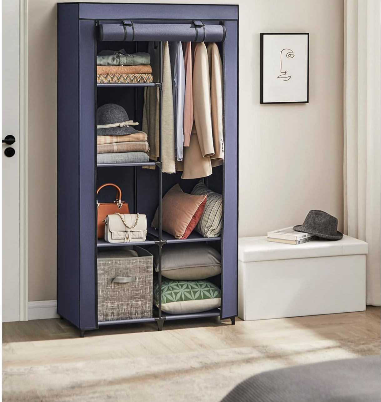
Figure 5.1: The portable closet with its cover rolled up, displaying organized contents.