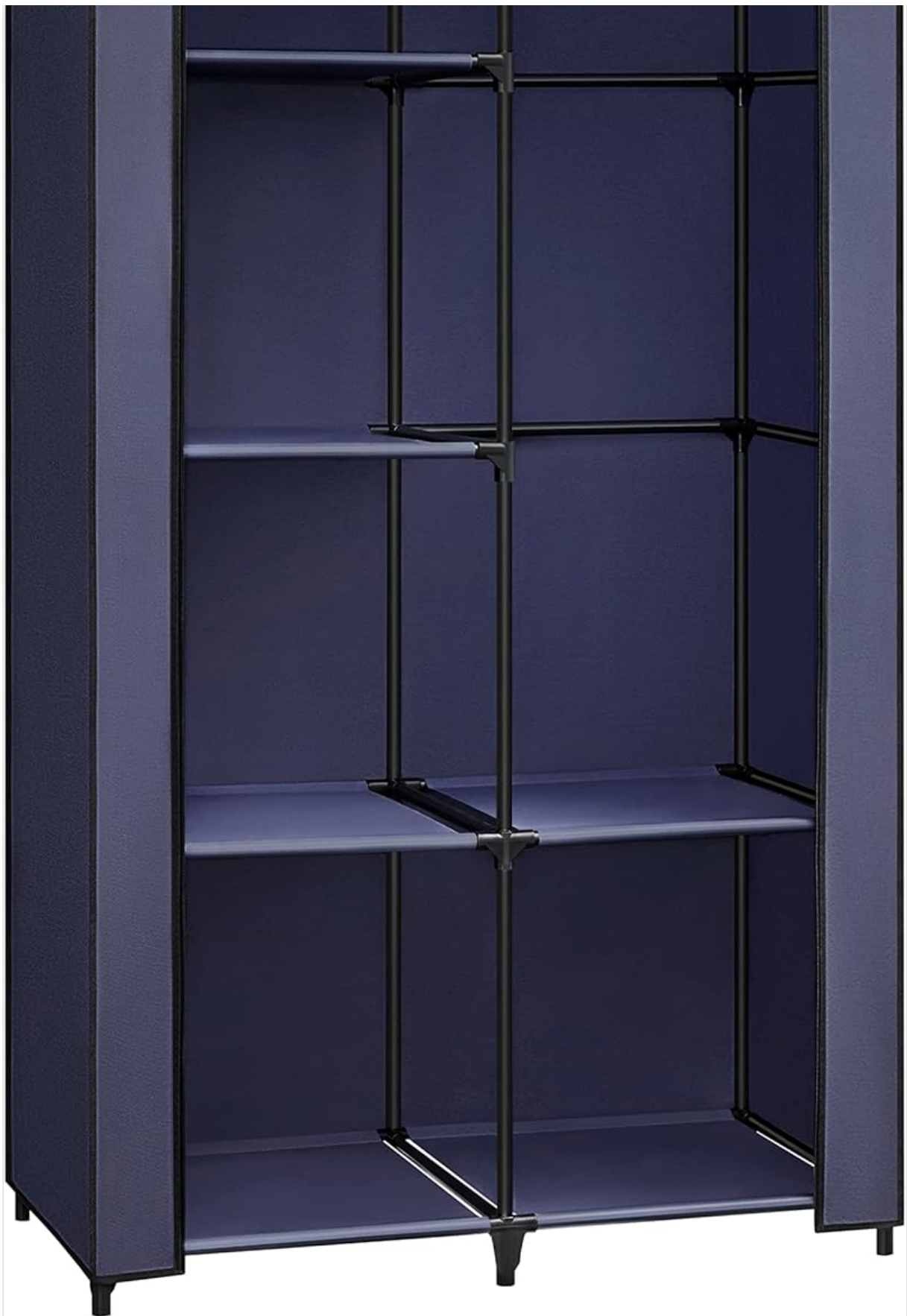
Figure 5.3: The cover features hook-and-loop fasteners to secure the rolled-up panel and a zip closure for full protection.