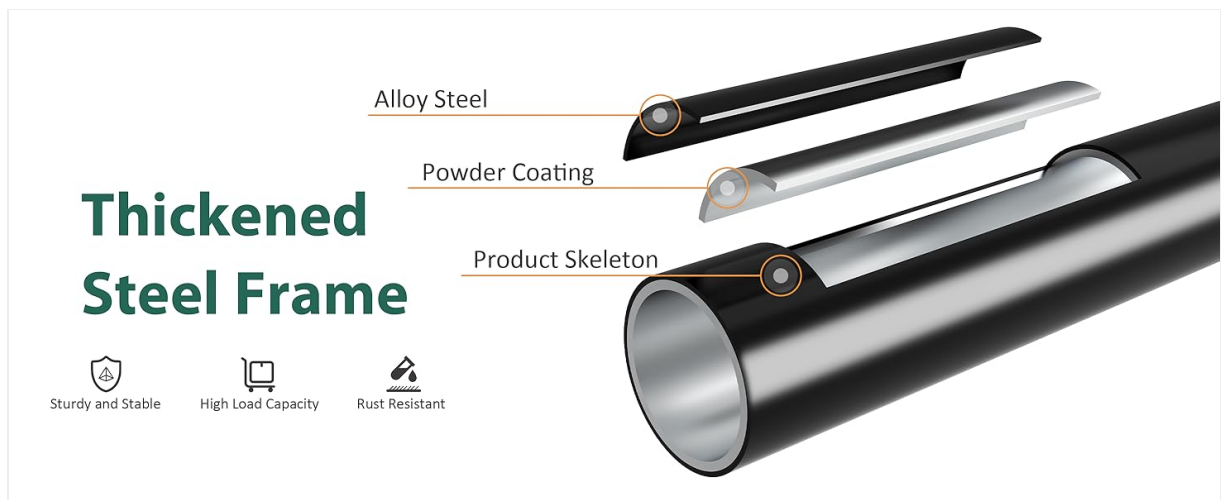
Image: Diagram illustrating the thickened steel frame construction for enhanced durability.