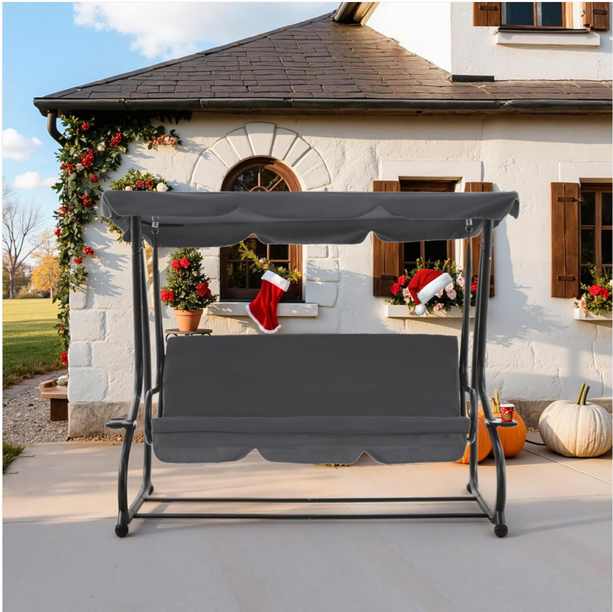
Image: Front view of the assembled MCombo 3 Seat Patio Swing Chair in dark grey.