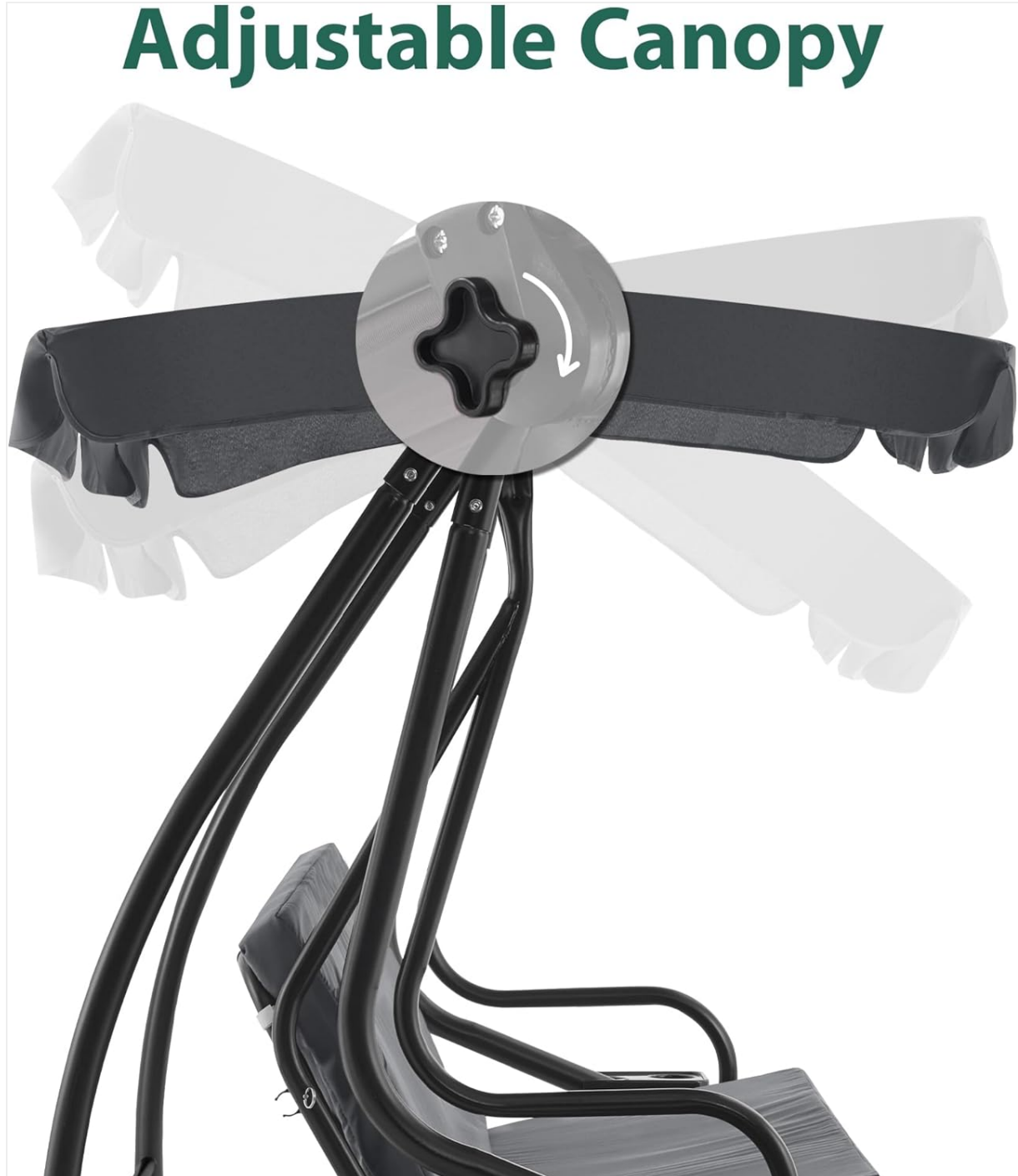
Image: Close-up view of the adjustable canopy mechanism, showing how to rotate and secure the canopy.

The canopy can be adjusted to provide optimal shade. Locate the adjustment knobs on either side of the canopy frame. Loosen the knobs, position the canopy to your desired angle (up to 45 degrees), and then tighten the knobs to secure it.