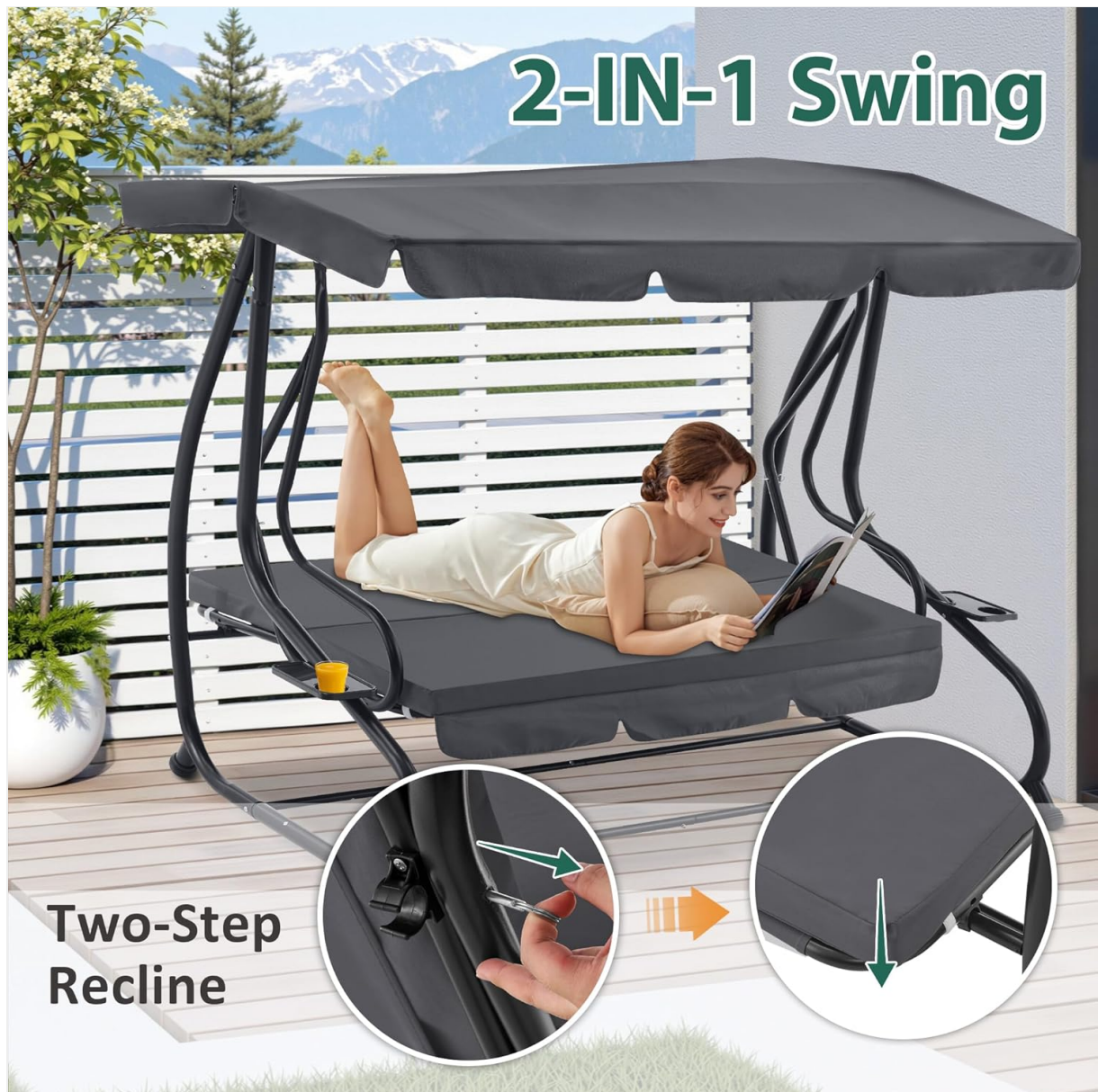
Image: The MCombo swing chair converting from a seated position to a flatbed, with a person relaxing on it.