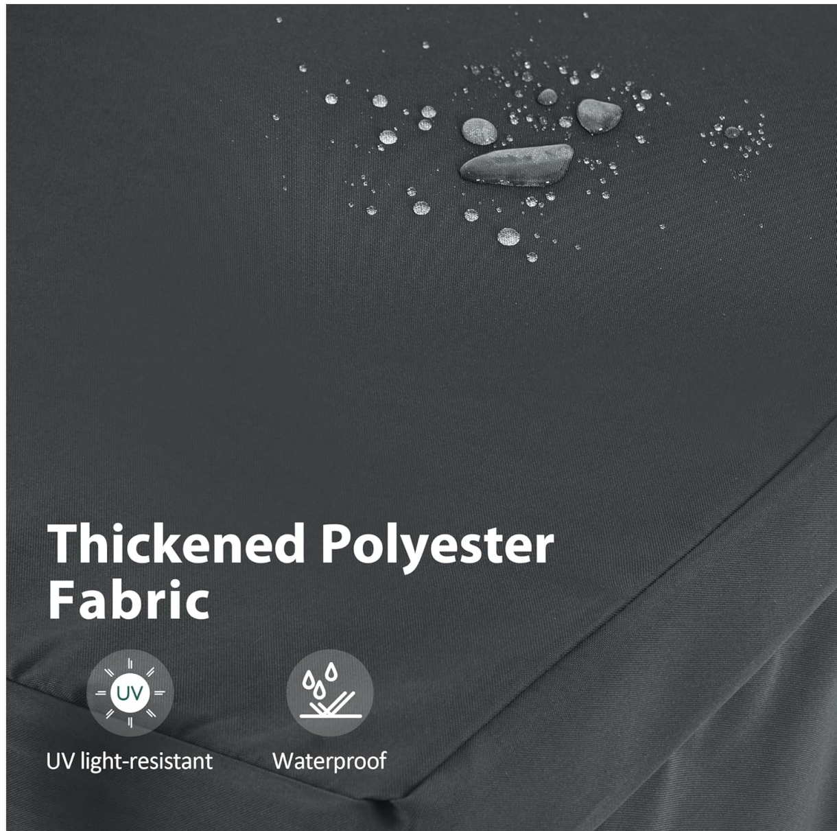
Image: Close-up of the thickened polyester fabric, highlighting its UV light-resistant and waterproof properties.