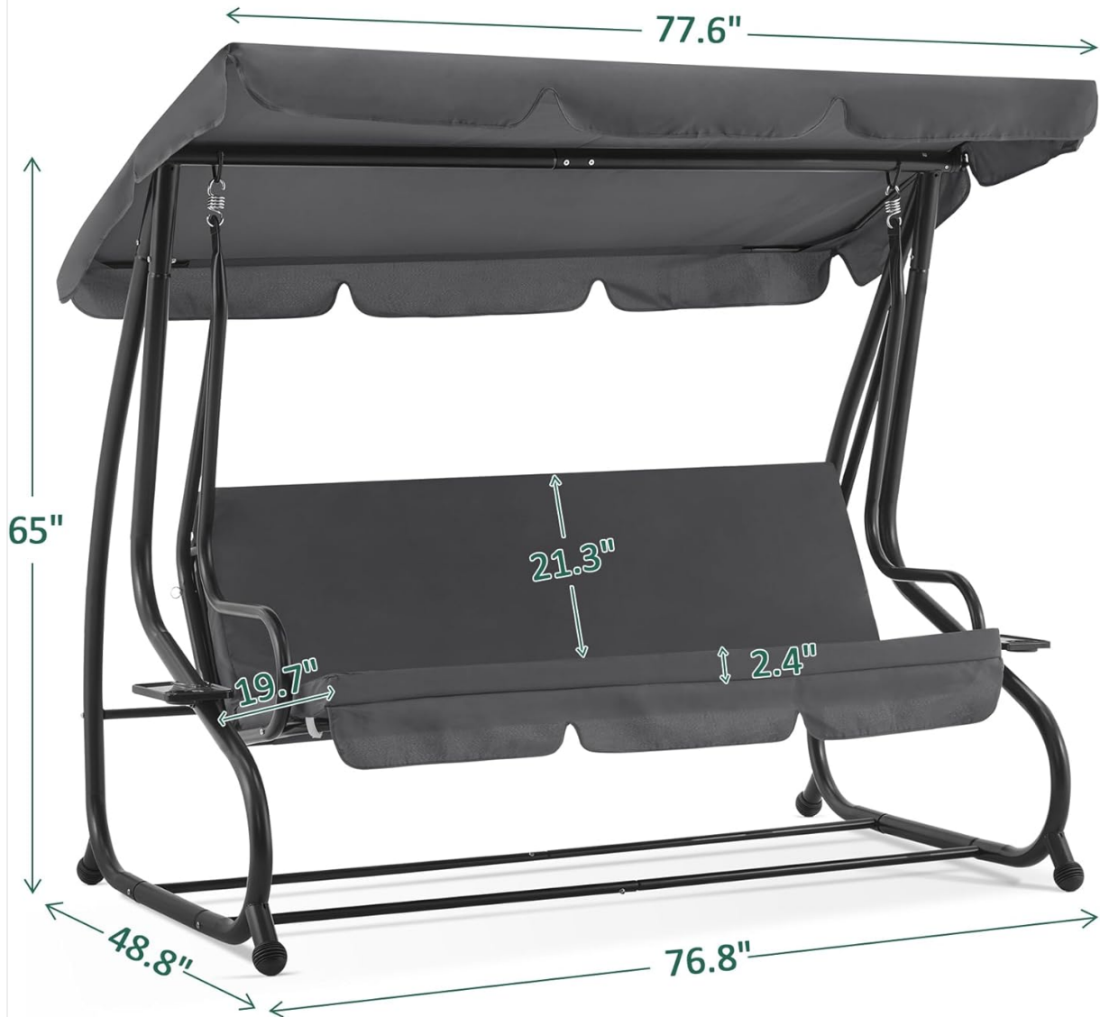
Image: Detailed dimensions of the MCombo 3 Seat Patio Swing Chair, including height, width, and depth.