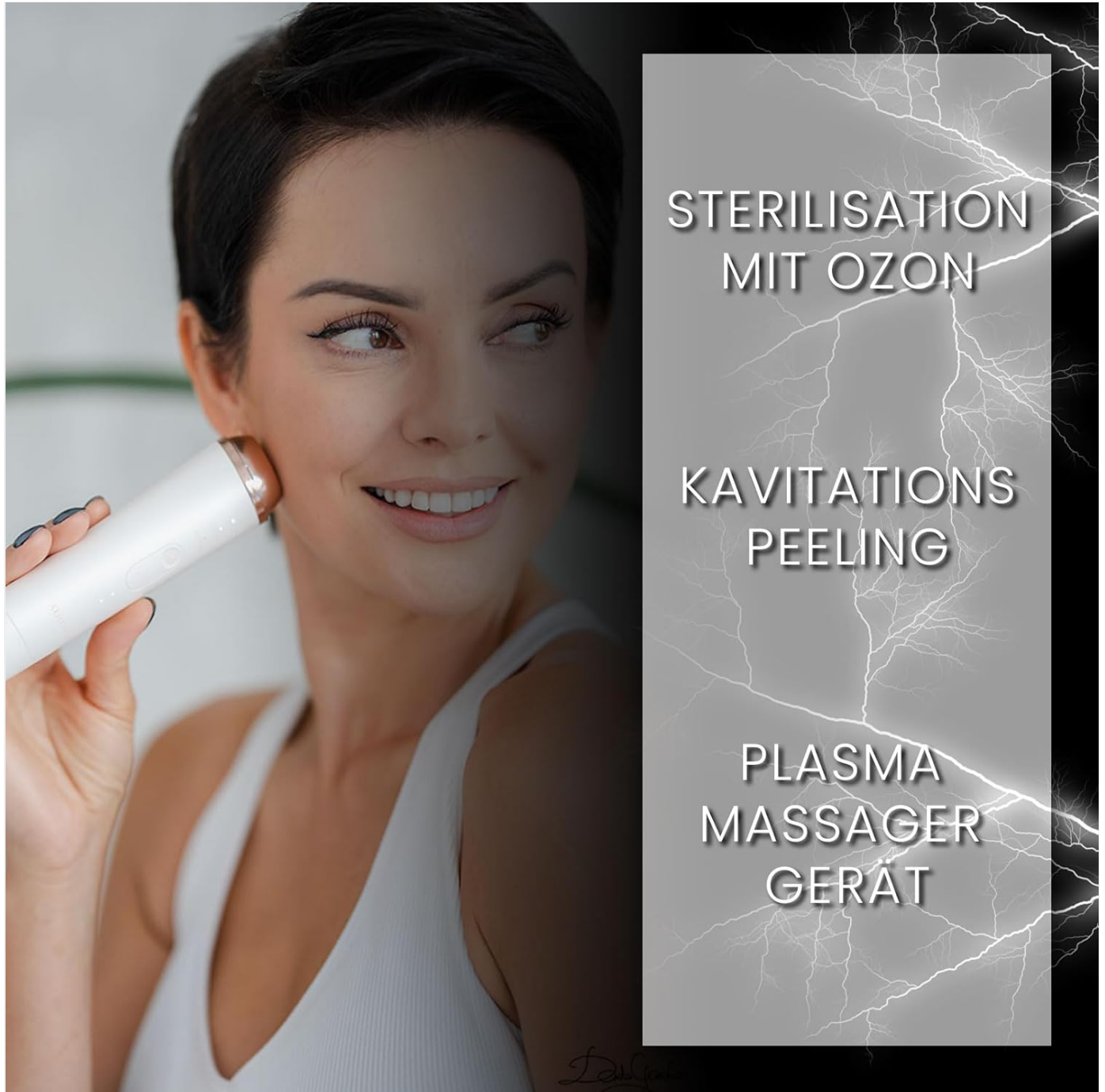
Image: A user applying the device in plasma mode, highlighting its multi-functional capabilities including ozone sterilization.