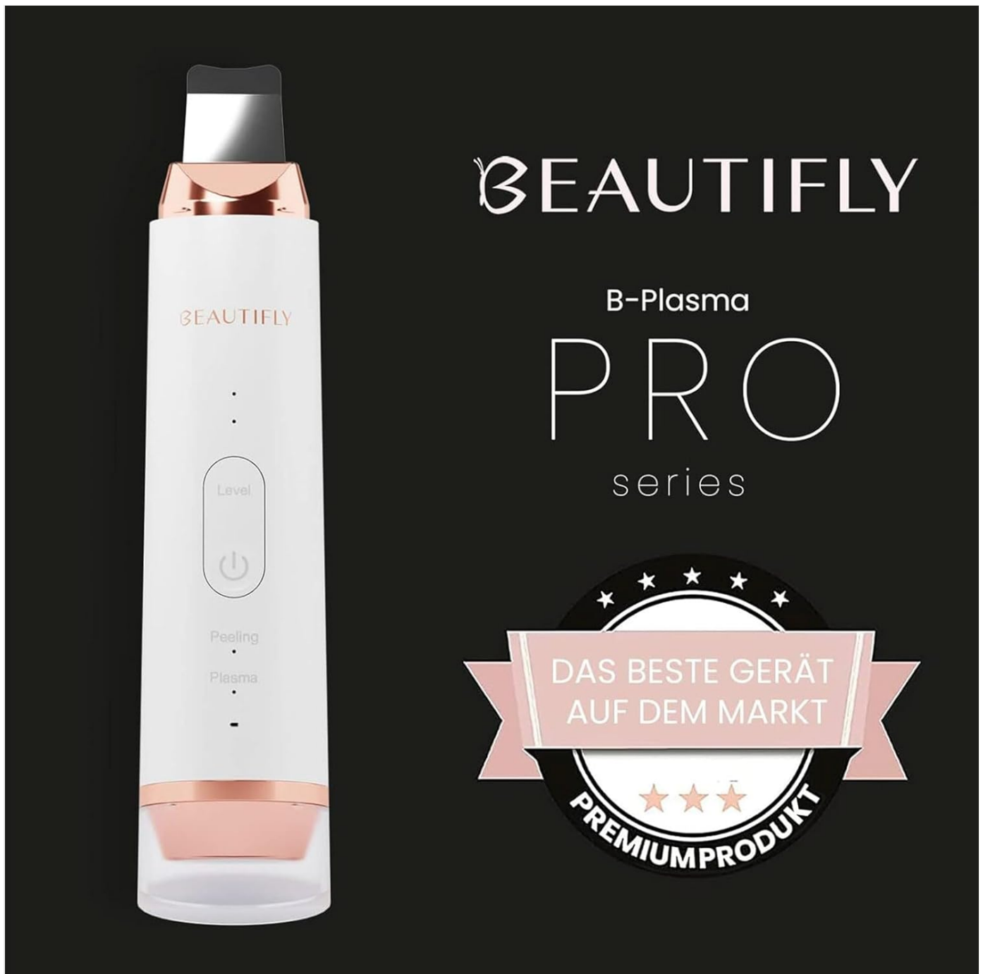
Image: The Beautifully B-Plasma PRO device, showcasing its design and branding.