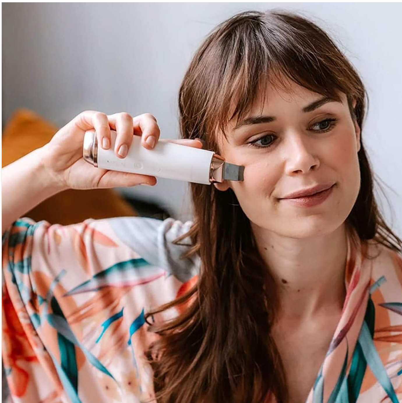
Image: A user demonstrating the application of the device in peeling mode on the cheek.