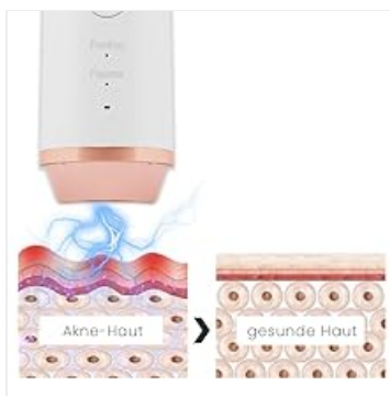
Image: Diagram illustrating the effect of plasma therapy on acne-prone skin, leading to healthier skin.