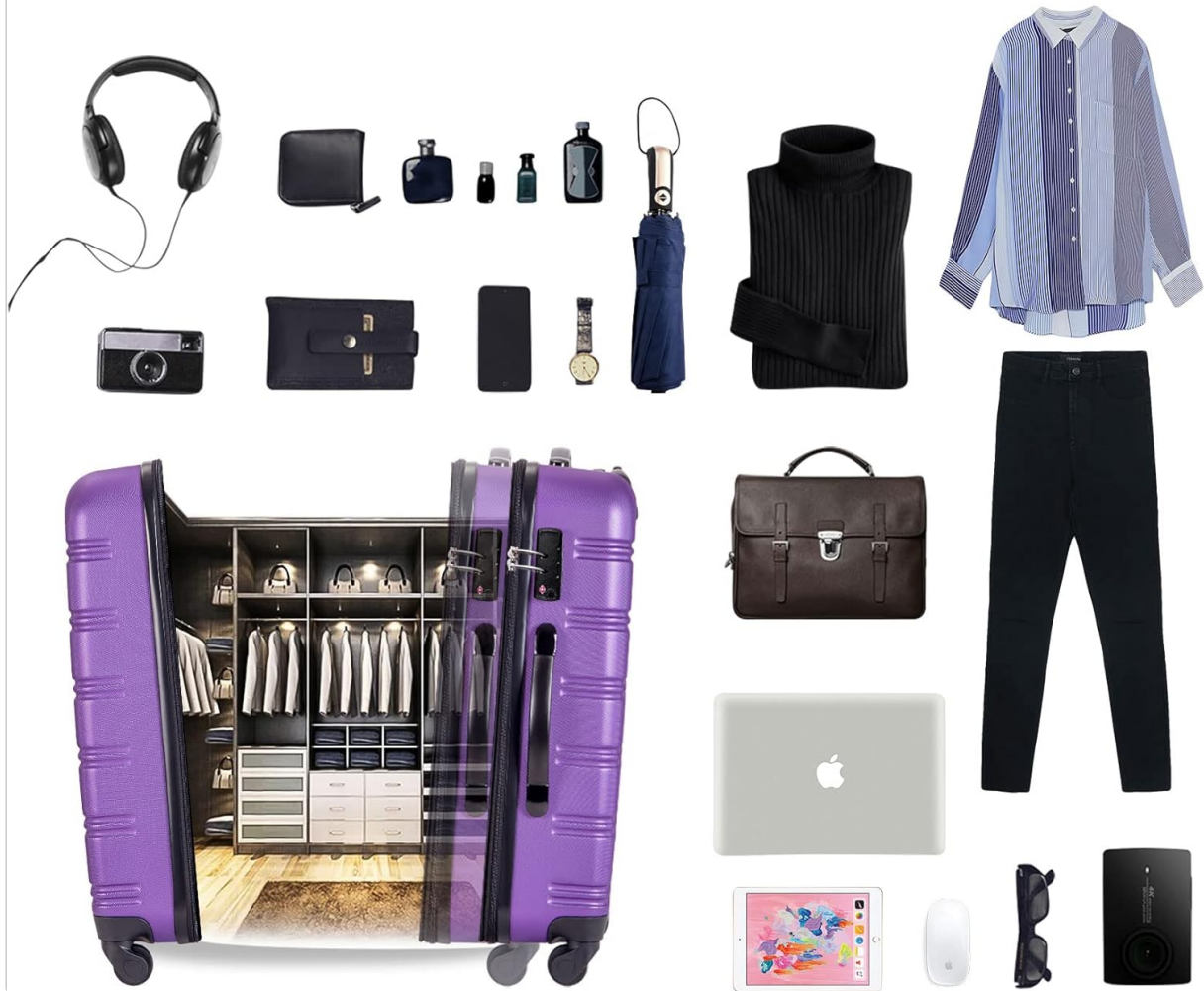
Image: The luggage expanded, showing increased capacity.