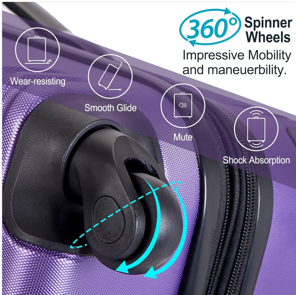
Image: Detailed view of the 360° spinner wheels and their features.