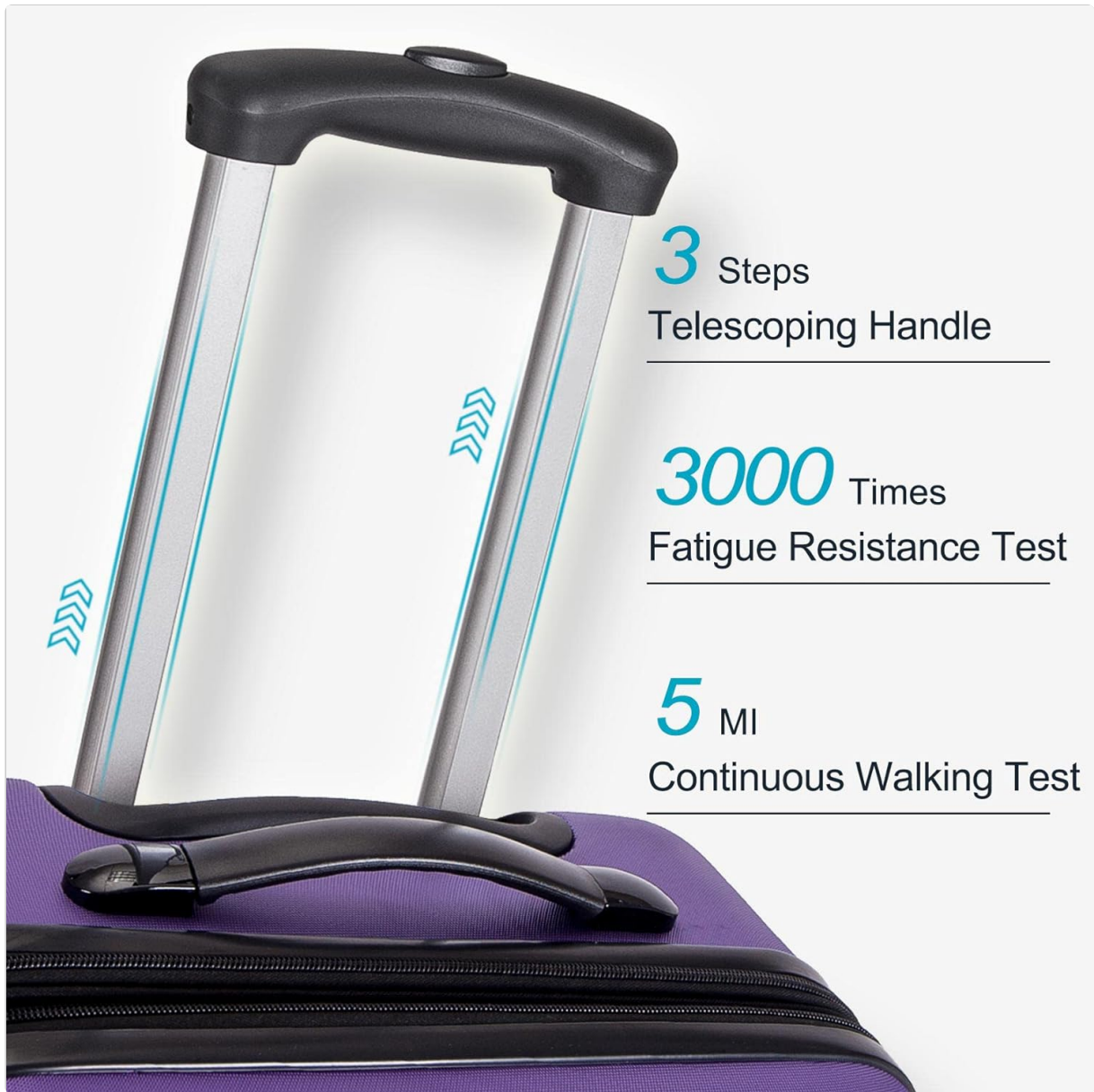
Image: Telescopic handle extended, highlighting its multi-step adjustment and durability testing.