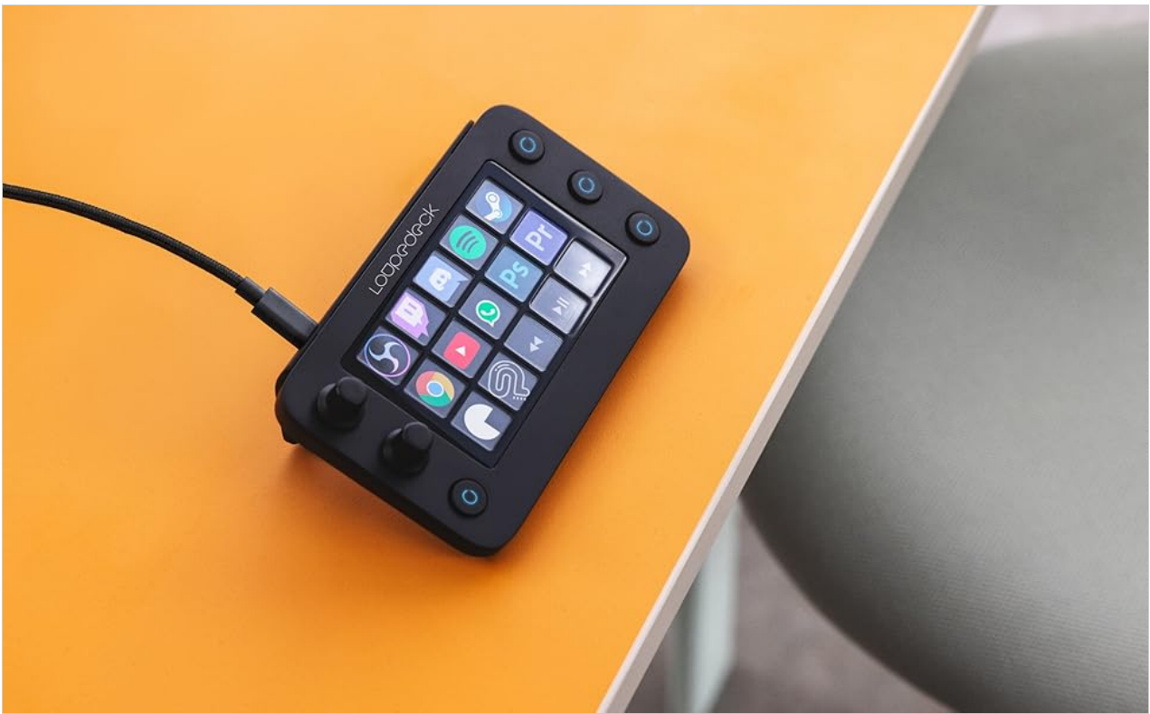
Image: A Loupedeck Live S device on a desk, illustrating its use for various tasks including photo and video editing, design, music production, Zoom conferences, and Notion projects.