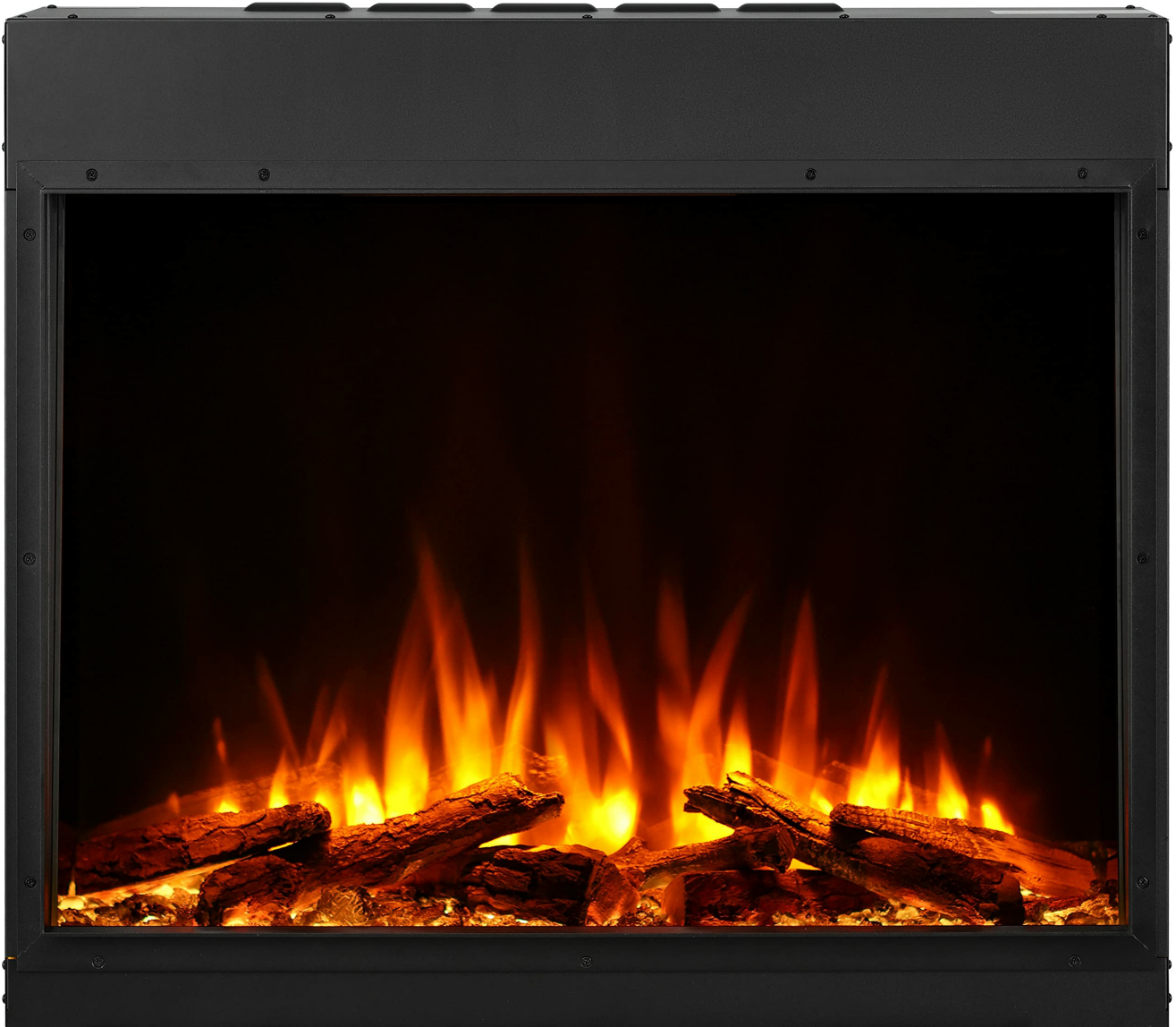
Image: Front view of the BALDERIA Costas Electric Fireplace displaying its realistic 3D flame effect and log set.

The BALDERIA Costas Electric Fireplace offers a realistic 3D flame effect, providing a cozy fireplace experience without the need for real fire. It includes a powerful 2000W electric heater, LED ambient lighting, WiFi connectivity for app control, and a crackling sound feature for enhanced realism. The fireplace is designed for recessed installation and comes with a remote control for convenient operation.