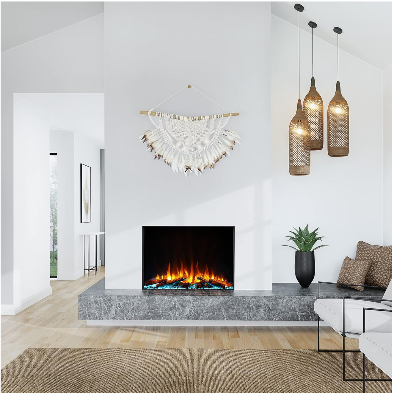
Image: Example of the BALDERIA Costas Electric Fireplace integrated into a modern living room wall.