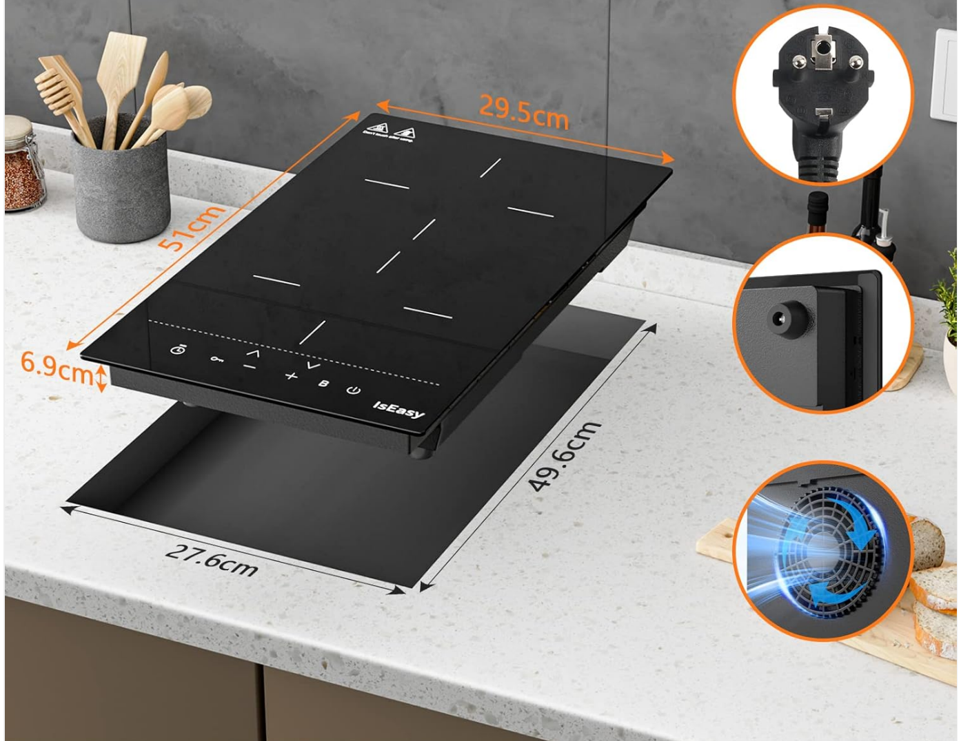
Image: Diagram showing the dimensions of the induction cooktop and the required cut-out size for built-in installation on a kitchen counter.