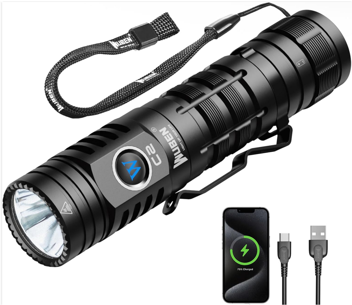
The WUBEN C2 Flashlight, showcasing its compact design and included accessories.