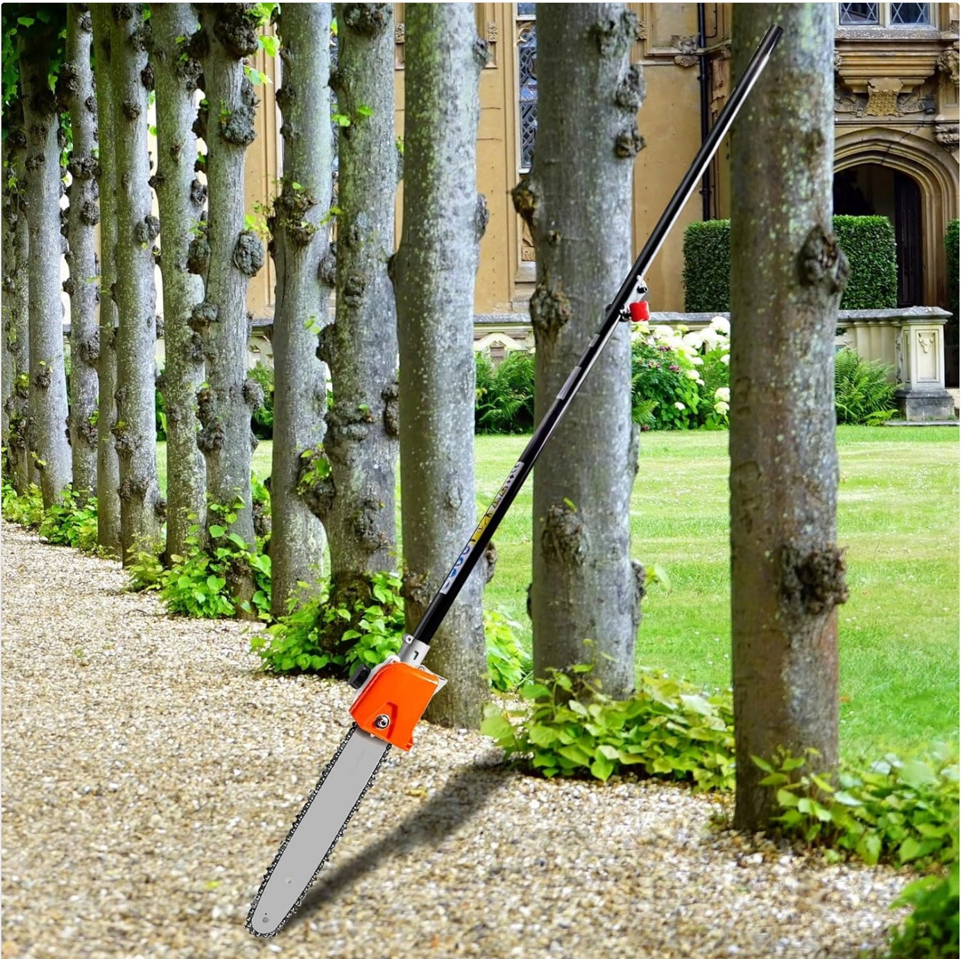
Figure 5: Pole Saw Attachment in use for tree trimming. This image shows the pole saw attachment being used to trim high branches from trees, demonstrating its extended reach.