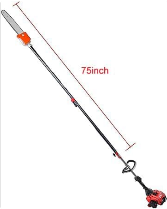
Figure 4: Pole Saw Attachment with Power Head, showing 75-inch total length. This image demonstrates the approximate total length of