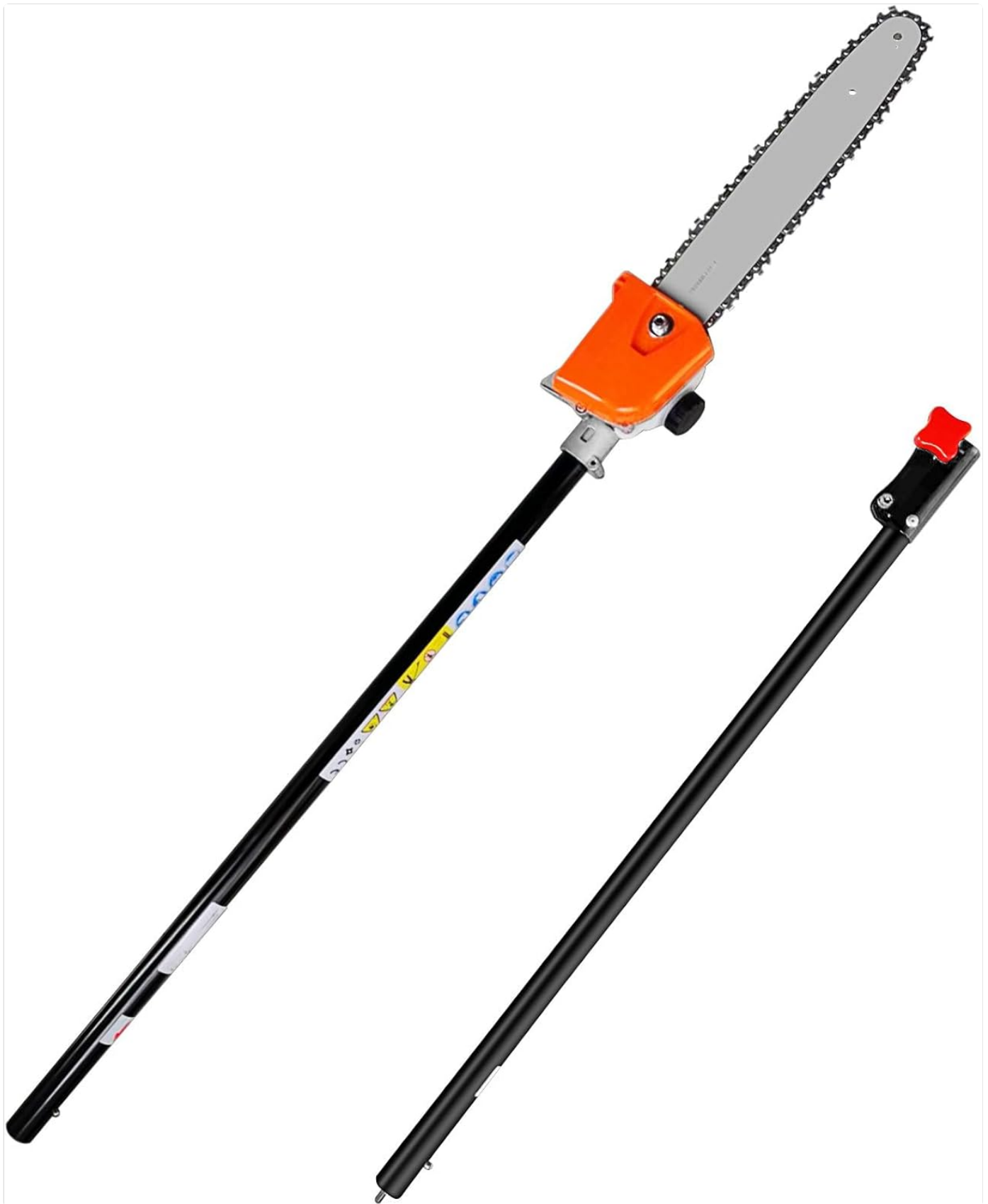
Figure 1: Gabasinover Pole Saw Attachment and Extension Pole. This image displays the primary components included in the package: the pole saw attachment with its 12-inch bar and chain, and the separate extension pole.