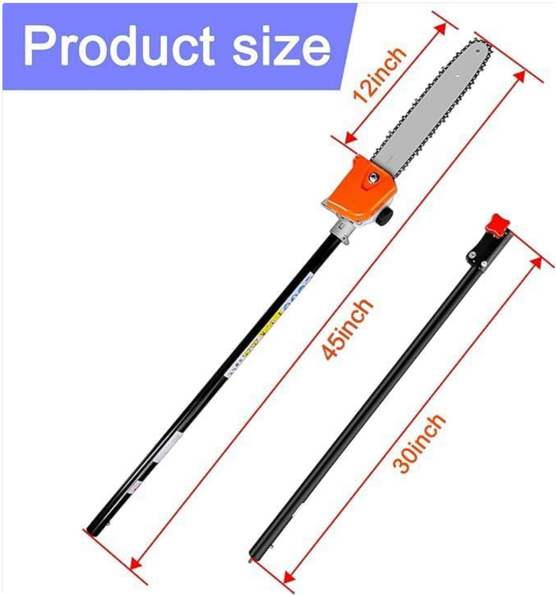
Figure 3: Product Dimensions Diagram. This diagram shows the individual lengths of the pole saw attachment (45 inches) and the extension pole (30 inches), along with the 12-inch blade length.