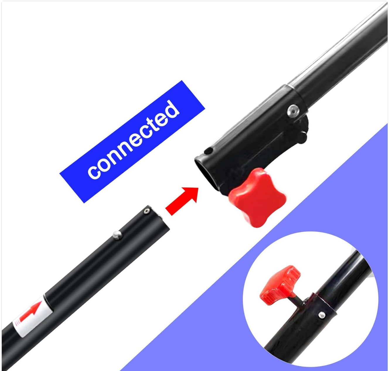
Figure 2: Connecting the Extension Pole. This image illustrates the process of connecting the extension pole to the main pole saw attachment, highlighting the red securing knob.

the female coupling of the pole saw attachment. Secure it using the red knob and ensure it clicks into place.