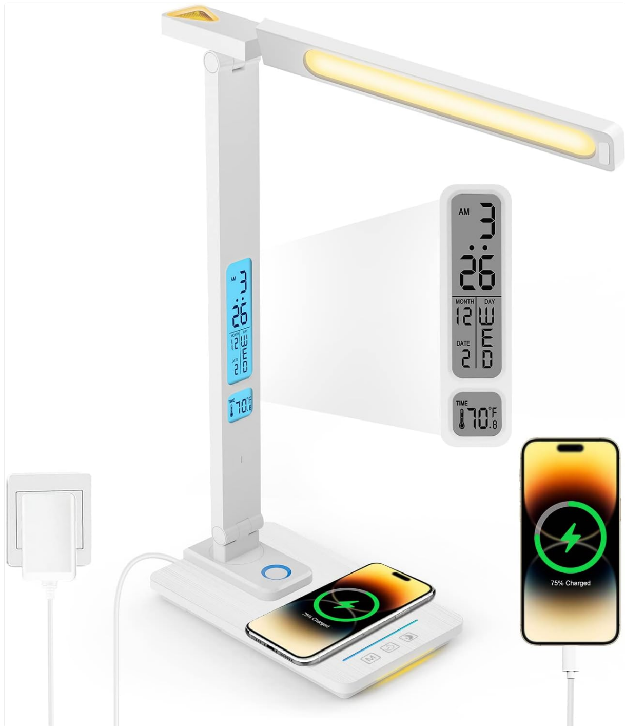
Figure 1: Overview of the LAOPAO LED Desk Lamp, showing the main light, LCD display, and wireless charging pad.

Familiarize yourself with the different parts and controls of your desk lamp.