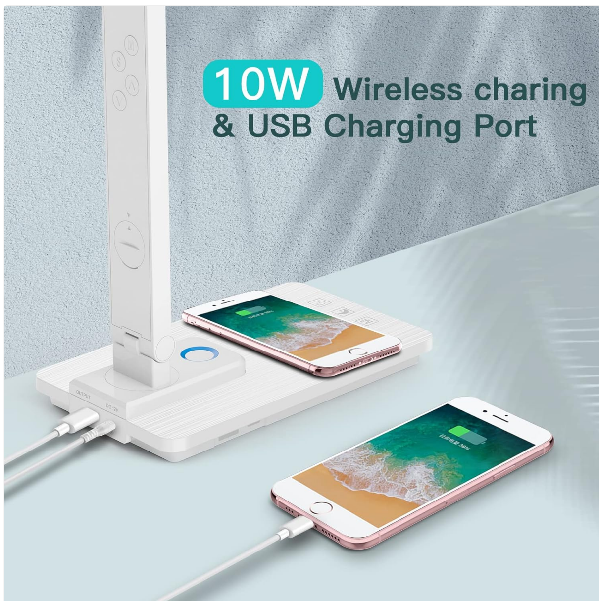
Figure 4: The lamp's base showing a smartphone wirelessly charging on the pad and another device charging via the USB port, highlighting the 10W wireless and 5V/2.1A USB charging capabilities.