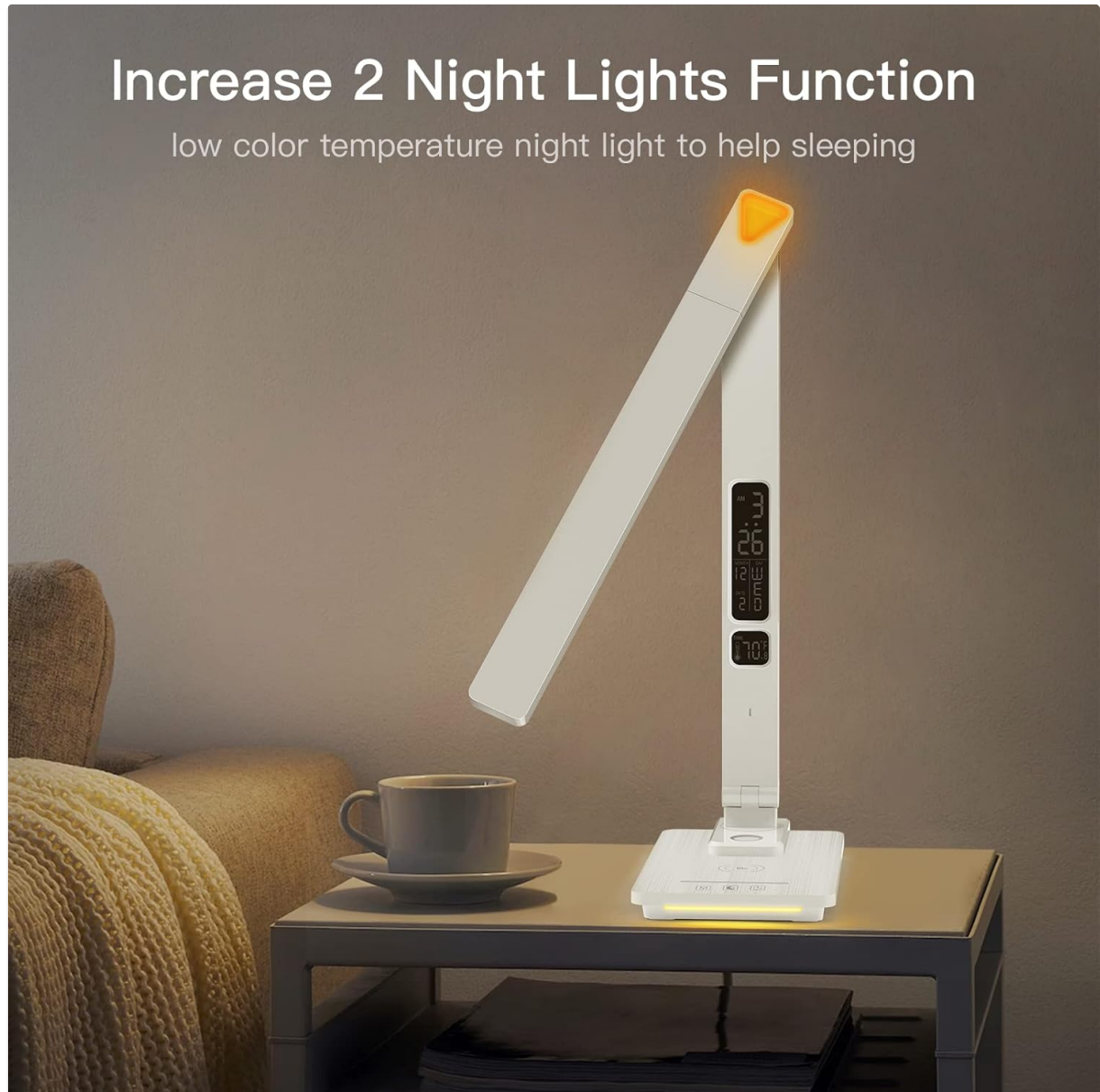
Figure 5: The desk lamp operating with its soft night light function, ideal for bedside use.