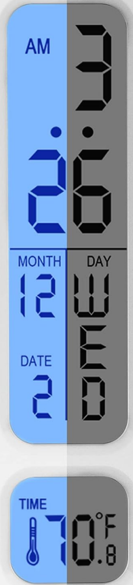
Figure 6: Demonstrates how to turn off the blue backlight of the LCD display by long-pressing the 'M' button for 3 seconds.