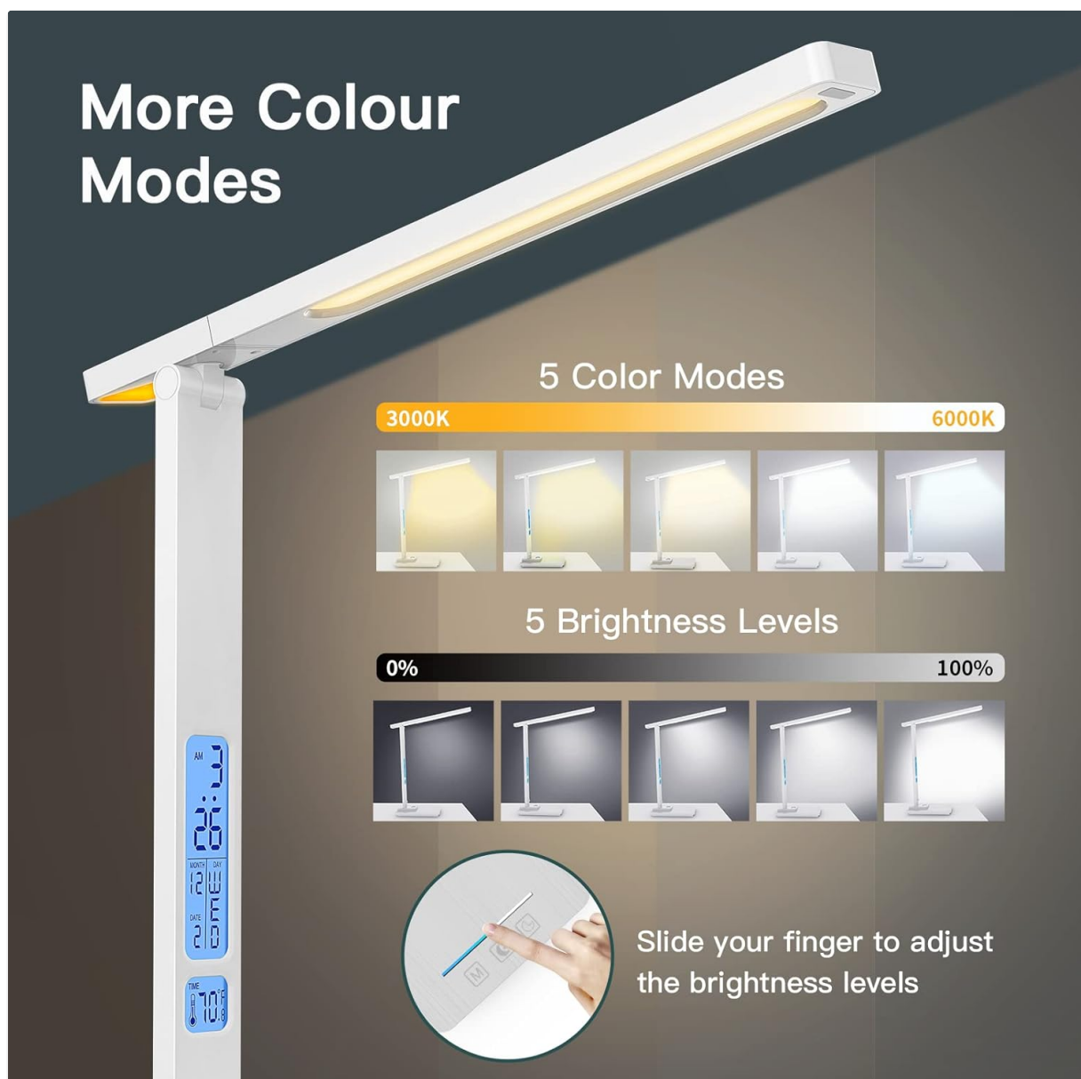
Figure 3: Illustration of the 5 color modes (3000K to 6000K) and 5 brightness levels, demonstrating the touch-sensitive slide control for adjustment.