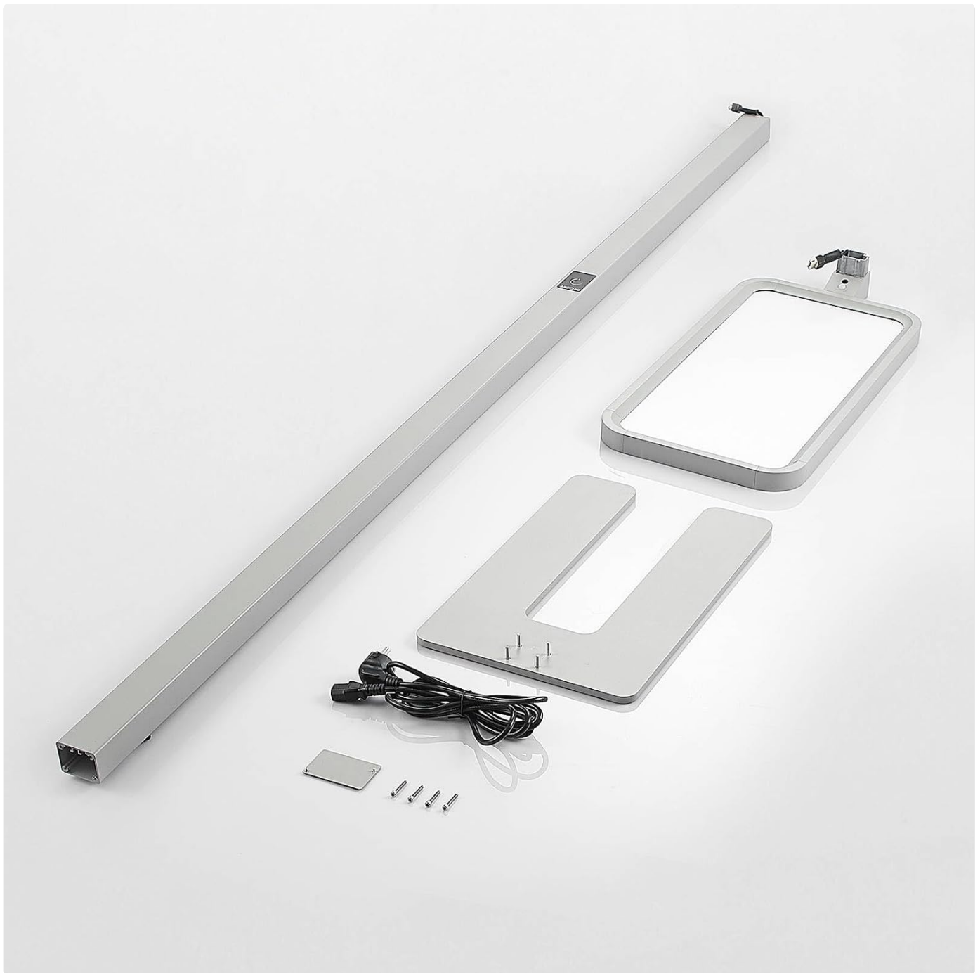
Figure 4: Touch control panel for power and dimming.