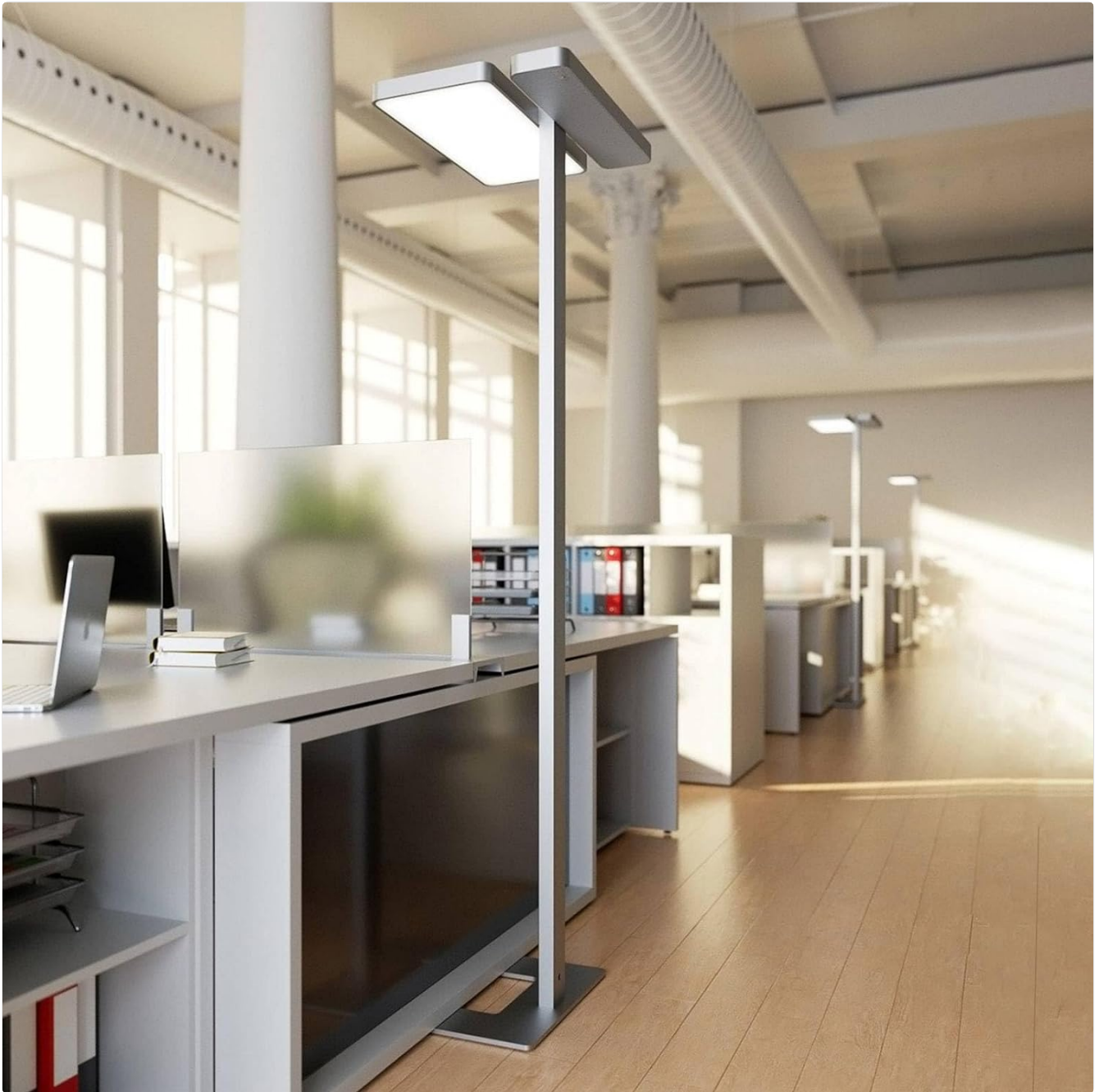
Figure 4.1: The Aila lamp integrated into an office setting, demonstrating its intended use and placement.

3. Connect Power: Insert the power plug into a suitable 230V wall outlet.