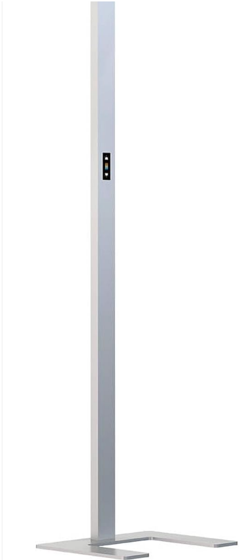
Figure 2.1: The Archio Aila floor lamp, showcasing its sleek, modern design in silver.