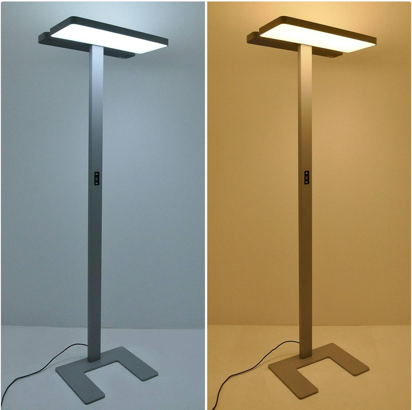
Figure 5.1: The Aila lamp demonstrating its ability to produce both warm (left) and cool (right) light temperatures.

conditions in the room, ensuring consistent illumination and energy efficiency.