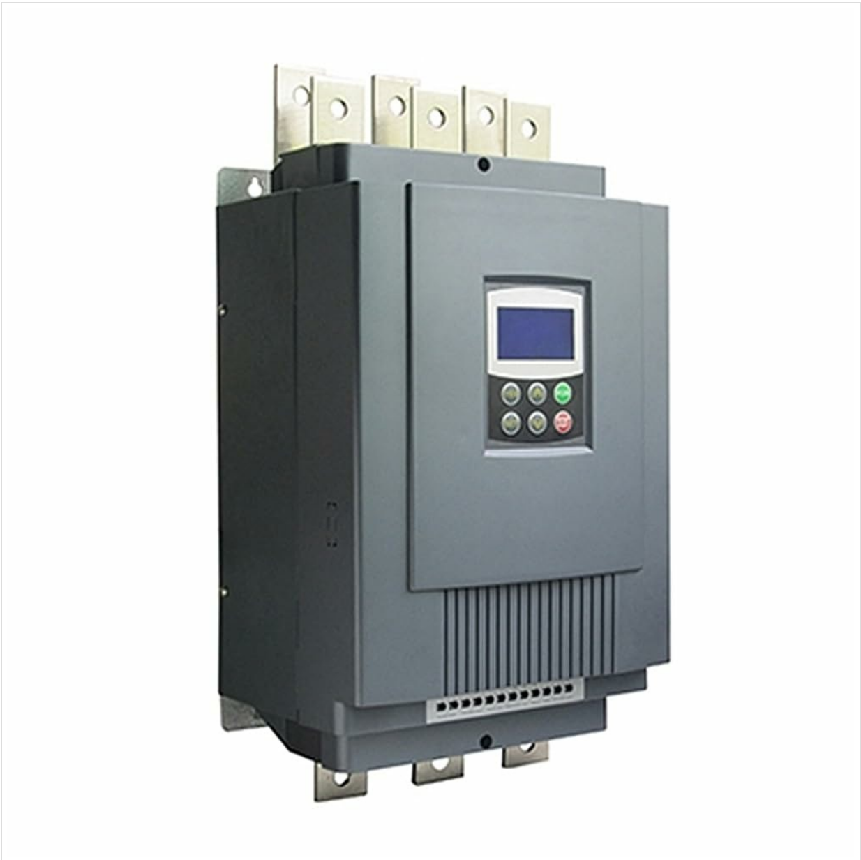
Figure 3.1: Front view of the ATO 180 hp Motor Soft Starter.