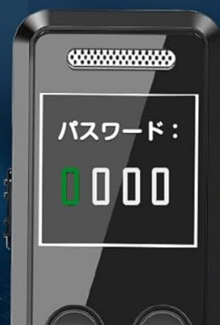
Image: Displaying the QZT V90's advanced features including timer recording, variable speed playback (1X, 2X, 3X), A-B repeat function for language learning, and a password protection screen.