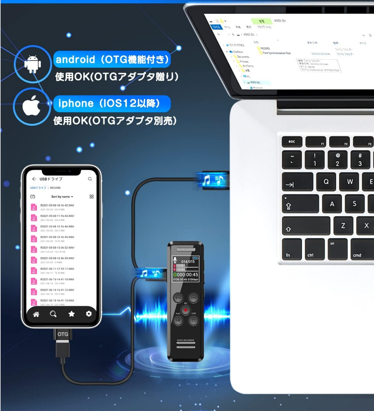
Image: The QZT V90 Voice Recorder connected to both a laptop and a smartphone, illustrating its capability for charging and efficient file management across different devices using OTG functionality.