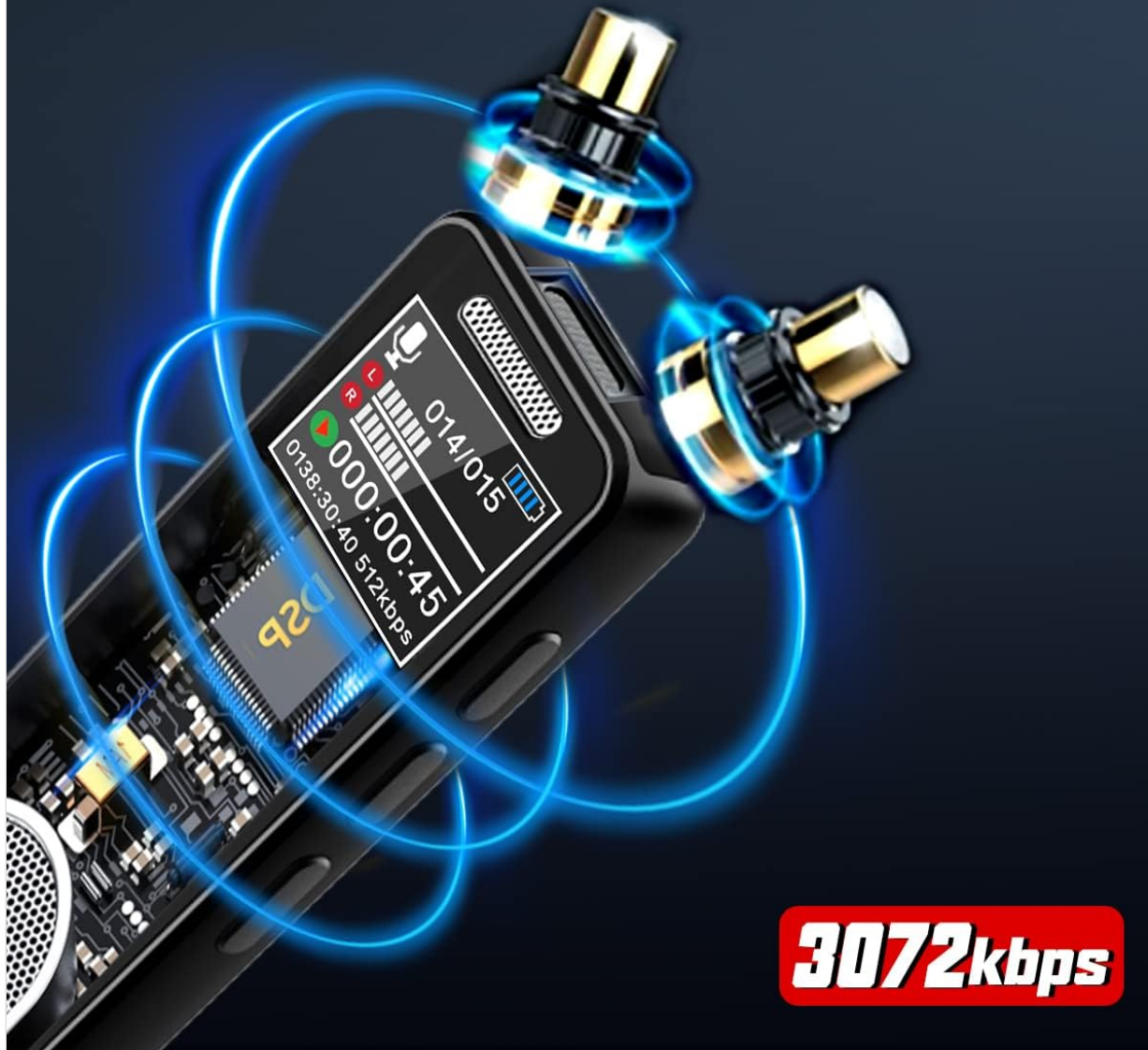
Image: Close-up of the QZT V90 Voice Recorder, illustrating the omnidirectional microphones and emphasizing its 3072kbps high-quality recording and noise cancellation features.

360度に配された2つの高性能指向性マイクとコアノイズ除去CPUを加え、コンパクトなボディながら高品質で録音をすることができます。