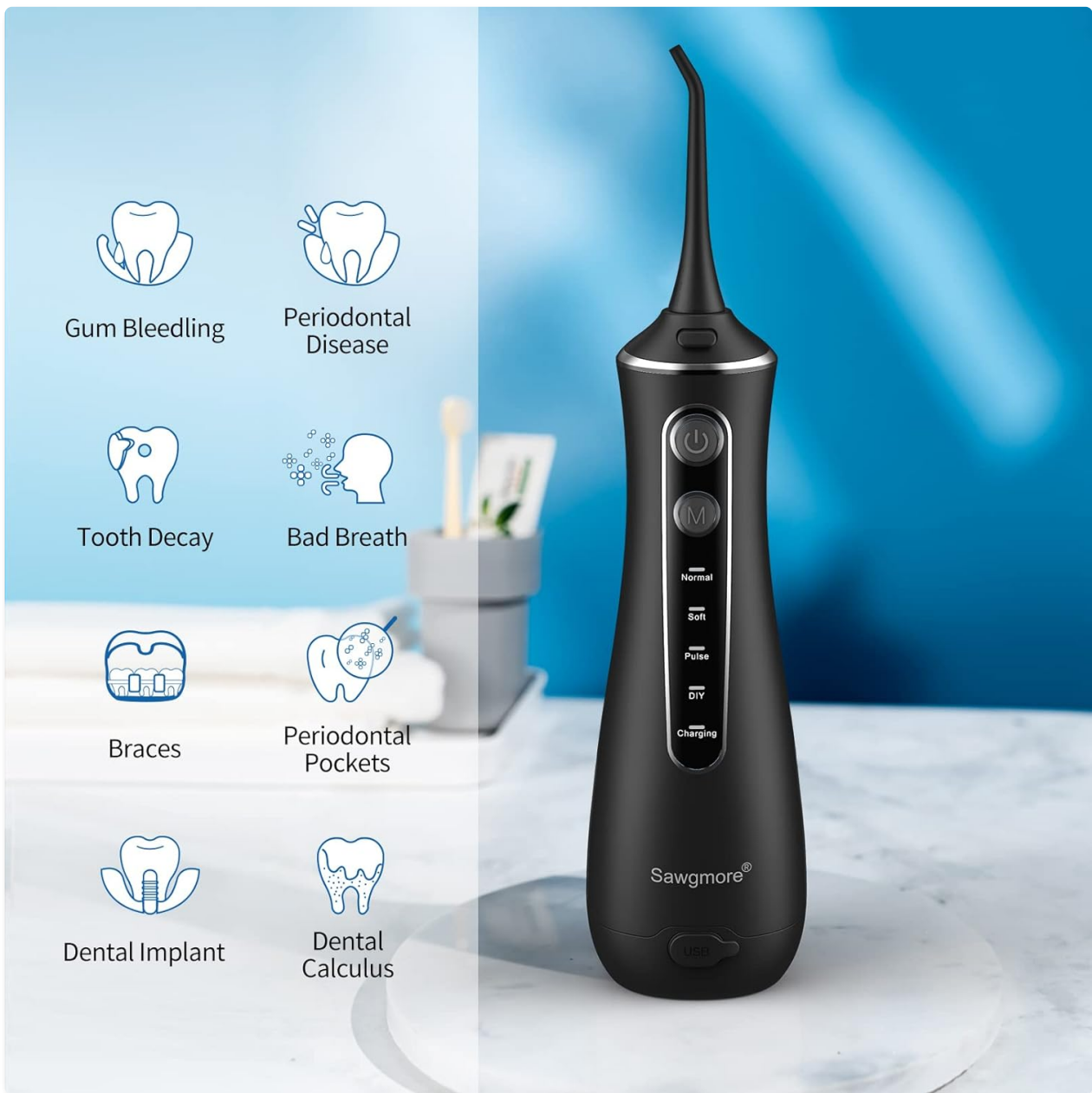
Figure 2: The oral irrigator addressing common dental concerns such as gum bleeding, periodontal disease, tooth decay, bad breath, braces, periodontal pockets, dental implants, and dental calculus.