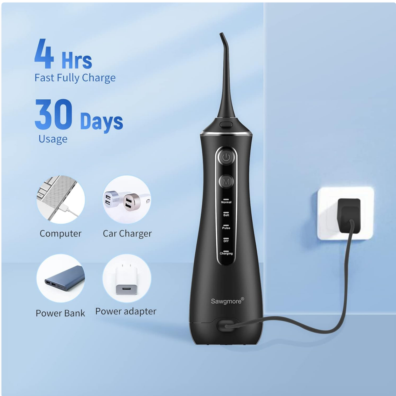
Figure 3: The oral irrigator being charged. It can be powered by a computer, car charger, power bank, or a standard power adapter. A full charge takes approximately 4 hours and provides up to 30-40 days of usage.

The charging indicator light will show the charging status. A full charge typically takes 4 hours and provides 30-40 days of usage.