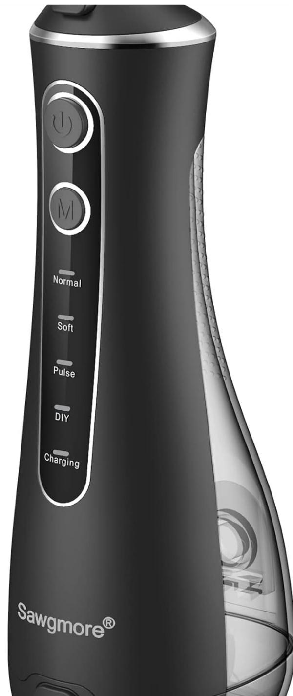
Figure 4: The device's control panel highlighting the four pressure settings: Normal for deep cleaning, Soft for beginners and sensitive teeth, Pulse for gum massage, and DIY for custom pressure.