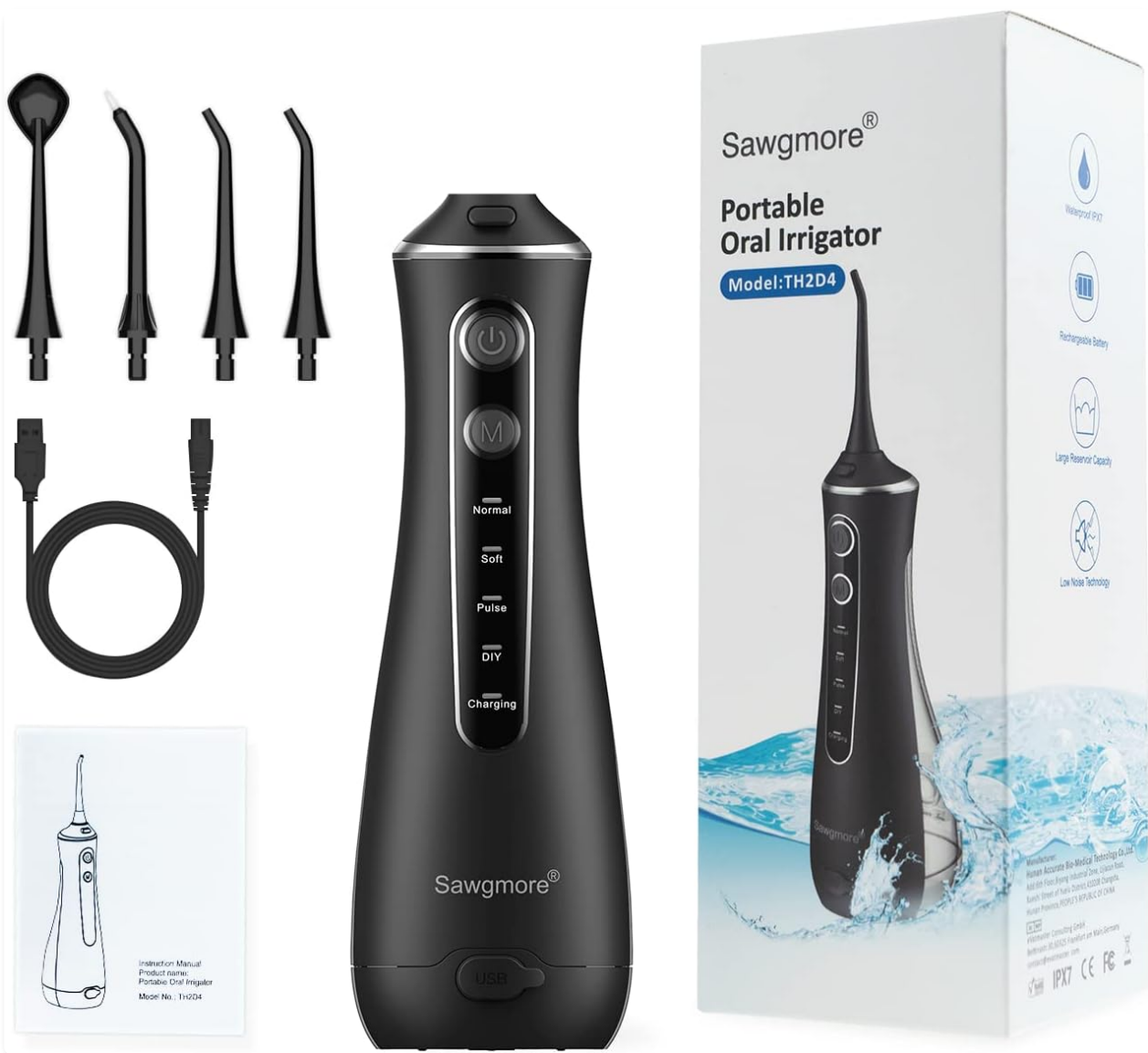
Figure 1: Contents of the Sawgmore Portable Oral Irrigator package, including the device, various jet tips, charging cable, and instruction manual.