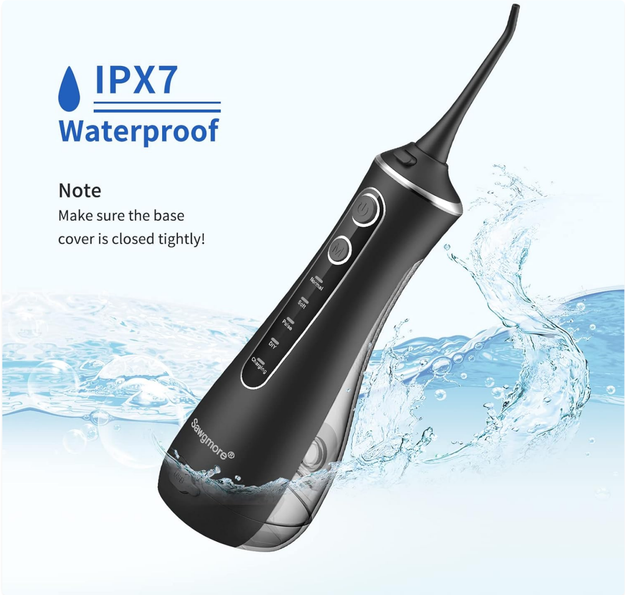
Figure 7: The IPX7 waterproof rating ensures the device is protected against immersion in water, making it safe for use in the bathroom. Always ensure the base cover is closed tightly.

Make sure the base cover is closed tightly!