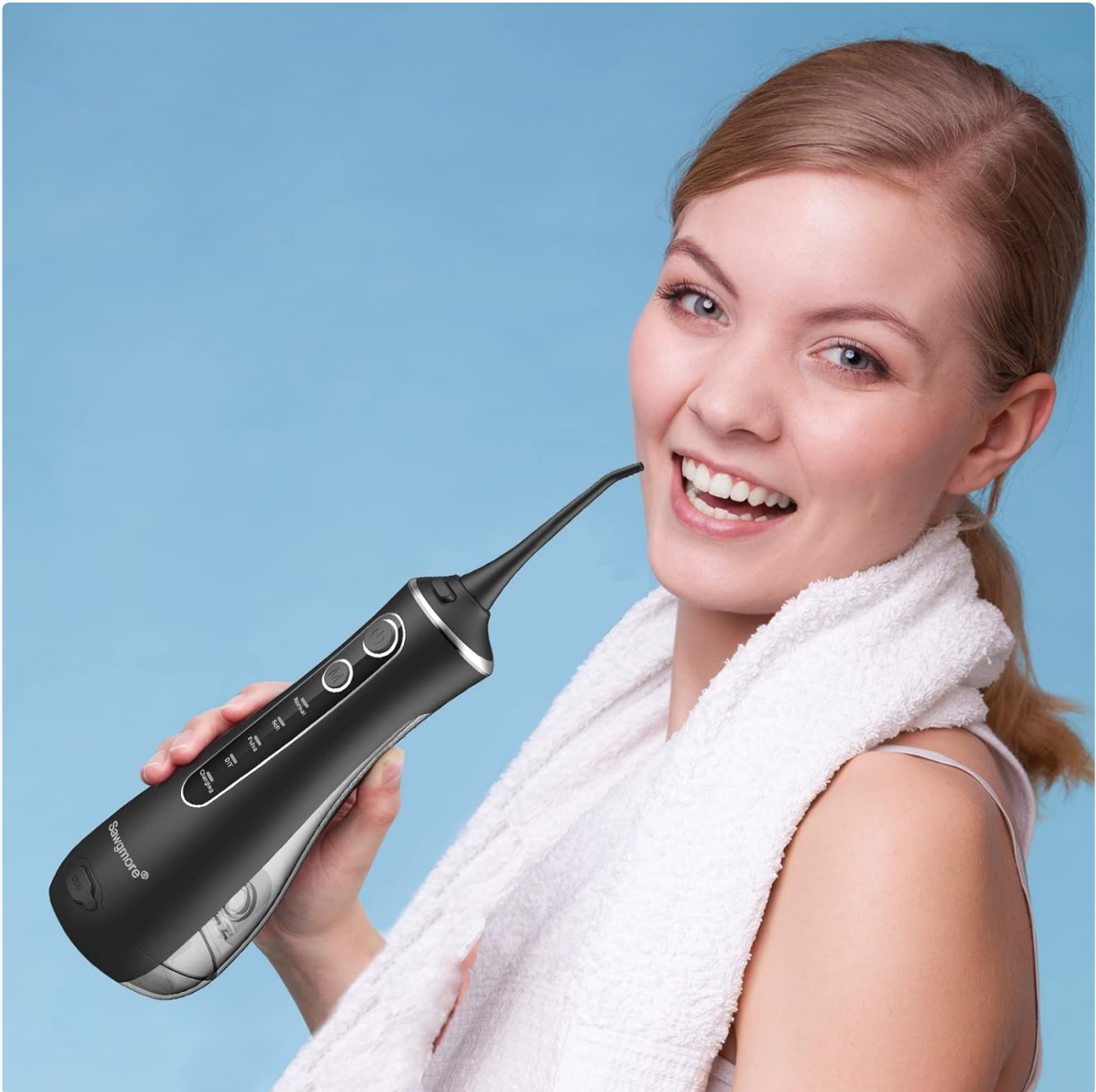
Figure 5: A user demonstrating the proper way to hold and use the Sawgmore Portable Oral Irrigator for effective cleaning.

After use, press the Power button to turn off the device. Empty any remaining water from the tank.