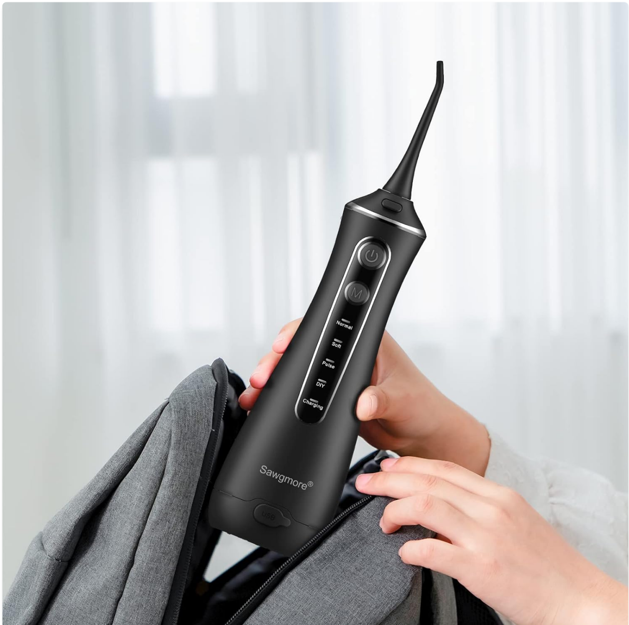
Figure 6: The portable design of the Sawgmore Oral Irrigator allows it to be easily stored in a bag, making it convenient for travel.

Store the device in a cool, dry place. Ensure the water tank is empty and dry before storing. The compact design makes it easy to store or carry for travel.