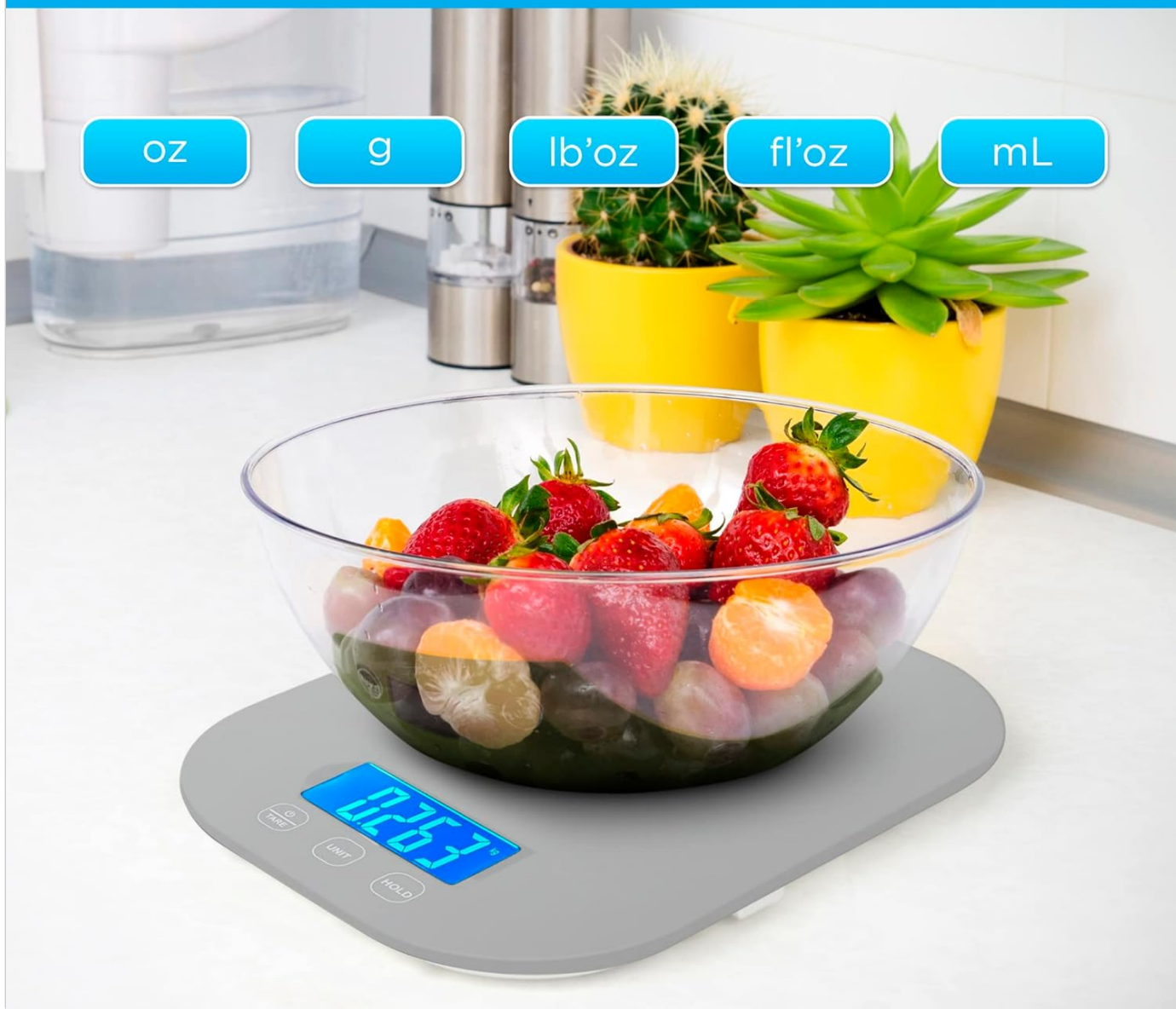
Image: Precise Units. The image shows the digital kitchen scale on a countertop with a bowl of fruit. Above the scale, labels indicate various measurement units: oz, g, lb'oz, fl'oz, and mL, highlighting the scale's unit conversion capability.