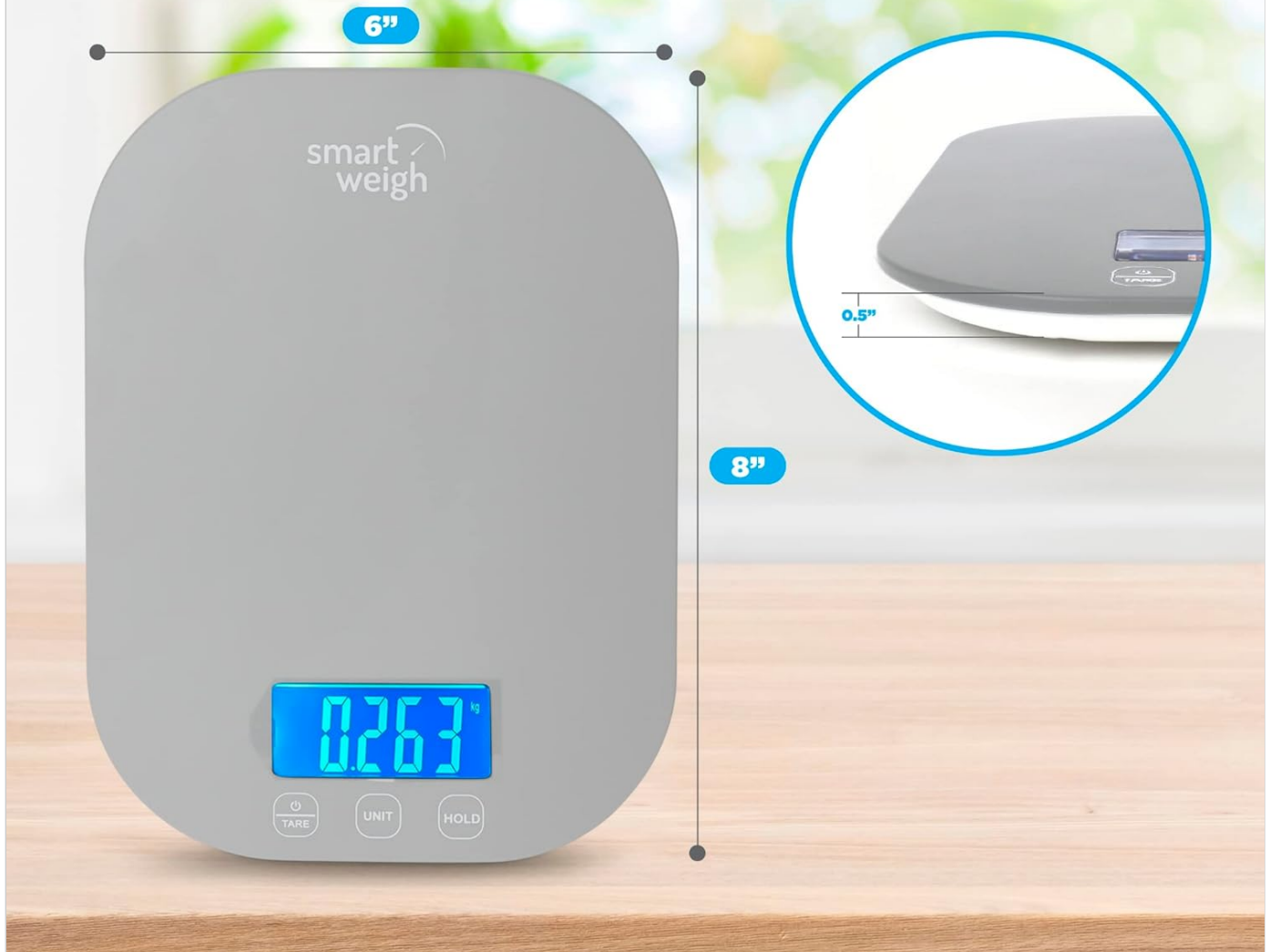
Image: Ideal Dimensions. The image shows the gray digital kitchen scale with its dimensions clearly marked: 6 inches in width, 8 inches in length, and 0.5 inches in thickness, illustrating its compact size.