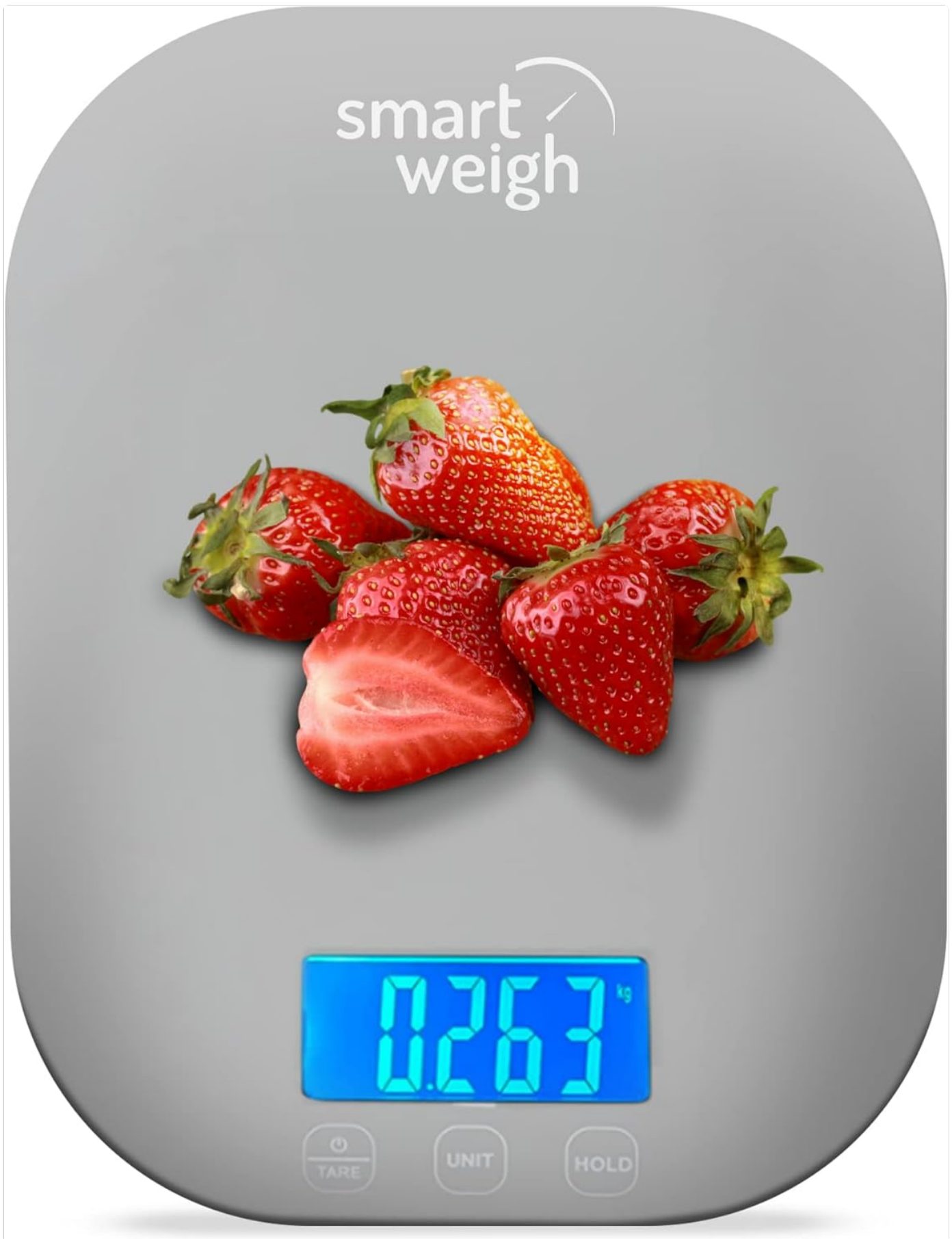
Image: Smart Weigh Gray Digital Kitchen Scale. The scale is gray with a digital display showing "0.263 kg". Several fresh strawberries are placed on the weighing platform.