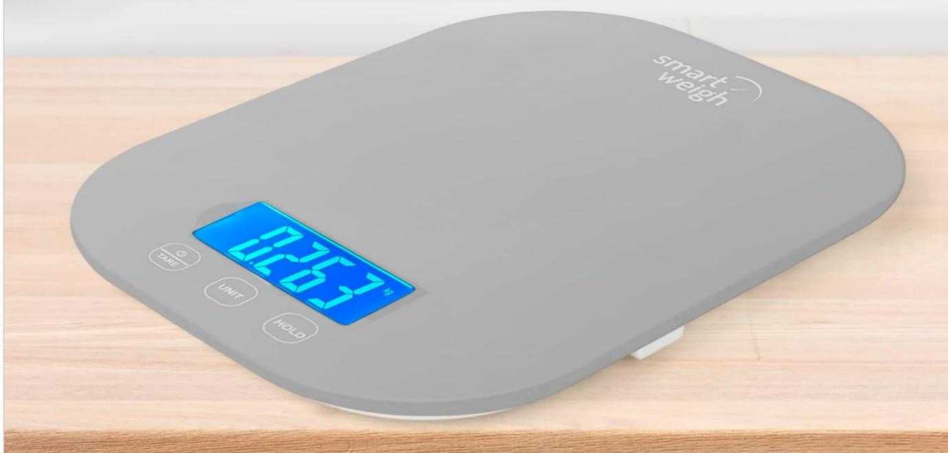
Image: Easy to Use with a User-friendly Format. The image displays the digital kitchen scale with icons and text pointing to its key features: LED Display, Volume Measurement, and Auto-Off function.