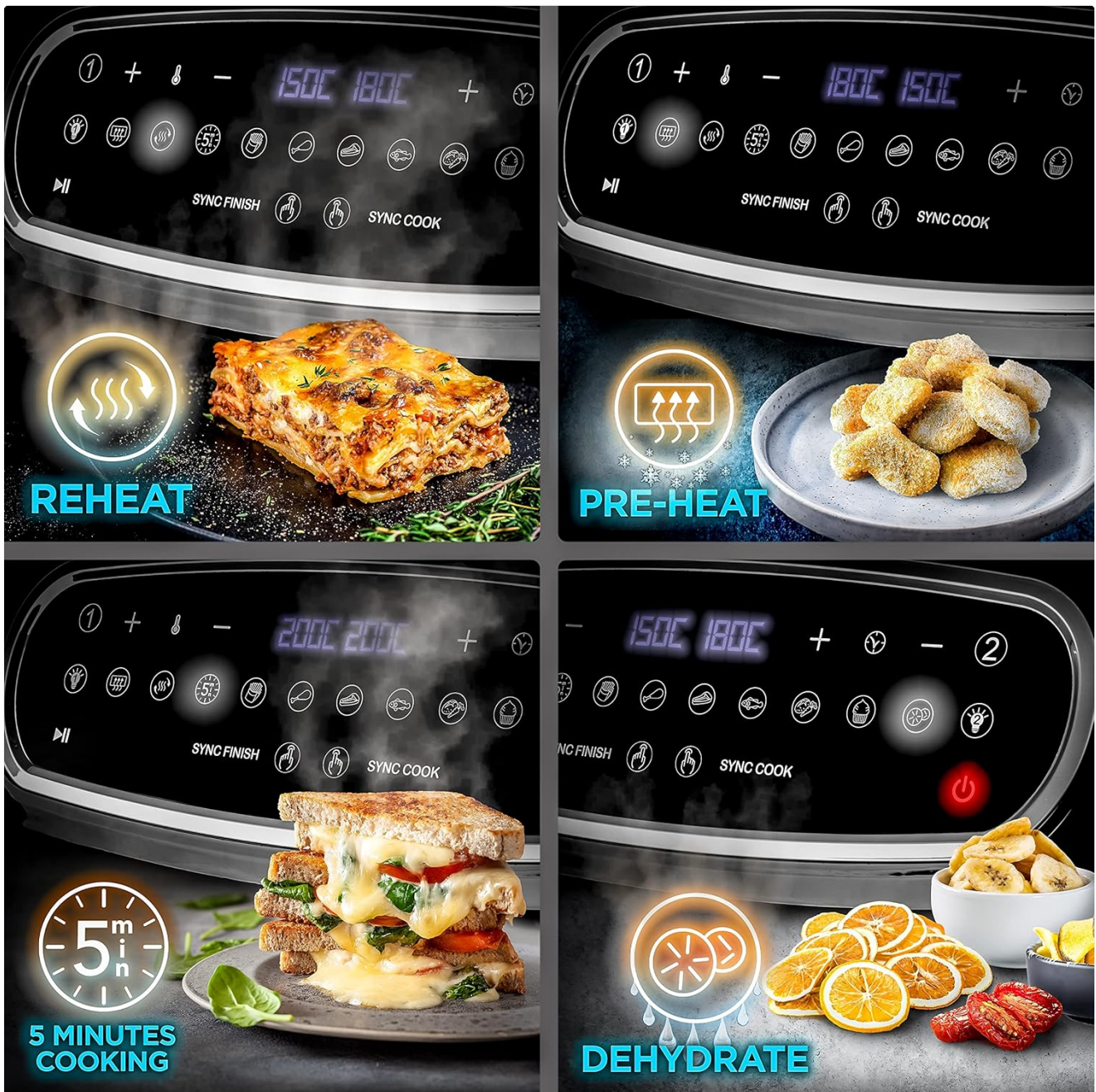
Figure 3.2: Close-up of the control panel, highlighting the 2400W power and the internal light feature for monitoring cooking progress.

The touch control panel allows for easy selection of cooking modes, temperature, and time. It features dedicated buttons for each basket (1 and 2), temperature/time adjustments, preset programs, and special functions like Sync Cook and Sync Finish.