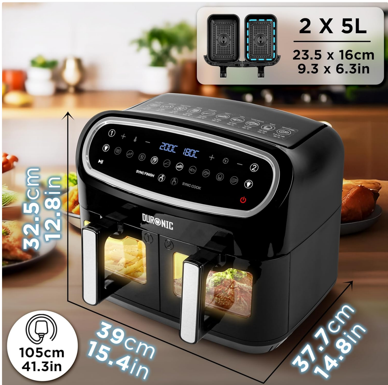
Figure 3.1: Dimensions of the Durotic AF24 Air Fryer, showing its compact yet spacious design with two 5L baskets.