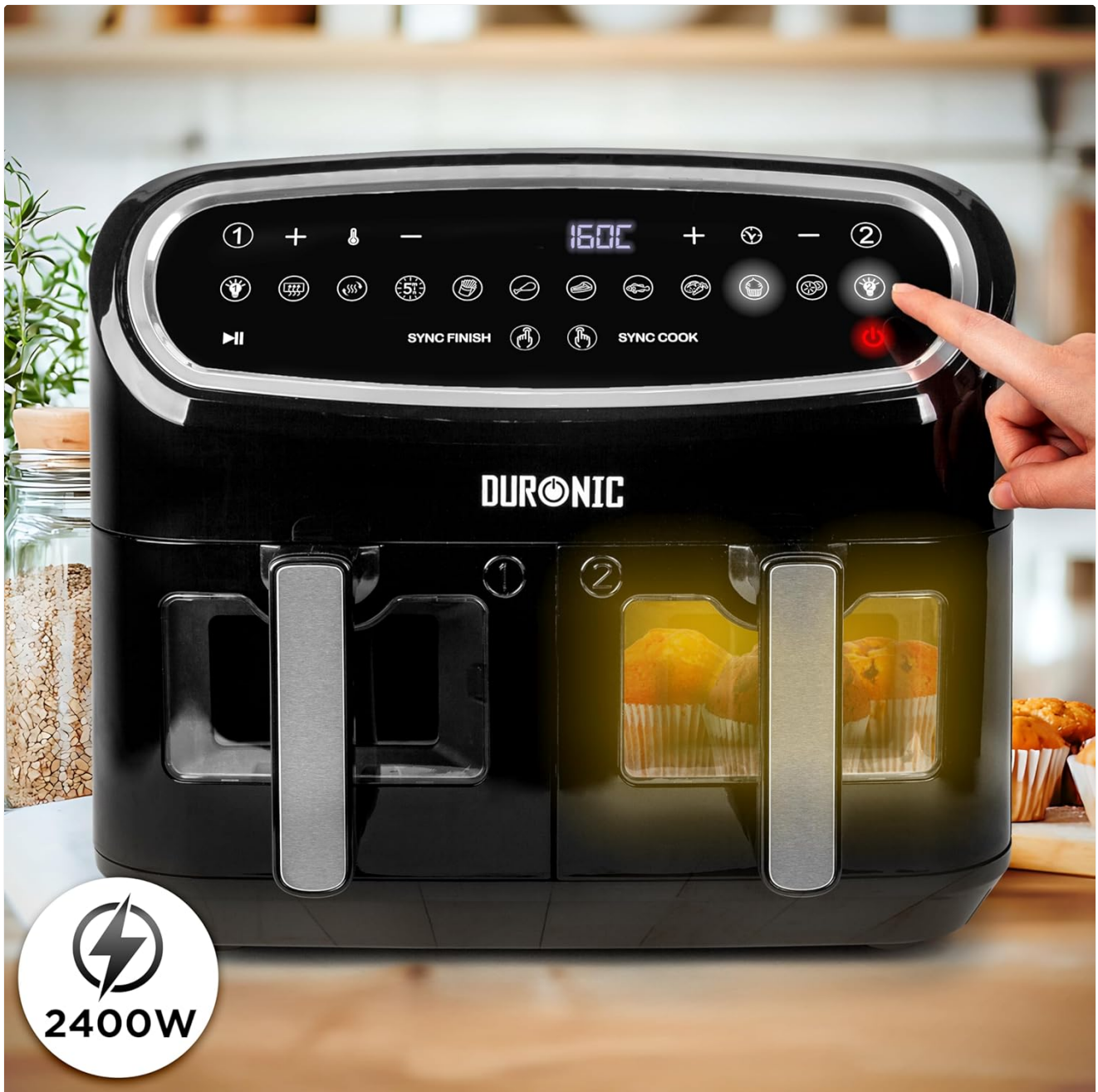
Figure 5.1: Visual representation of various cooking functions available on the Durotic AF24, including Reheat, Pre-heat, 5-minute quick cook, and Dehydrate.