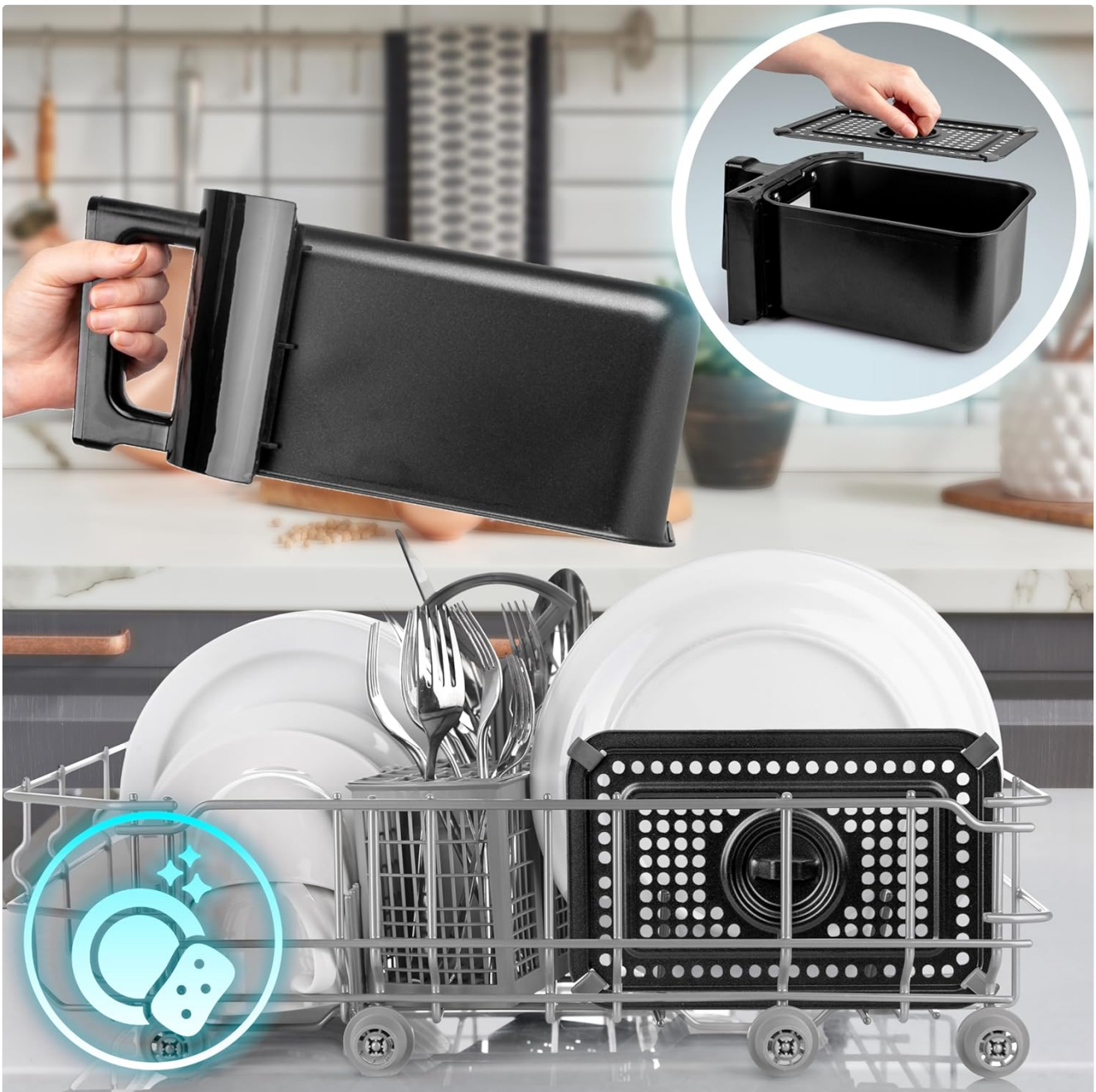
Figure 6.1: The removable cooking basket and tray are dishwasher safe, simplifying the cleaning process.