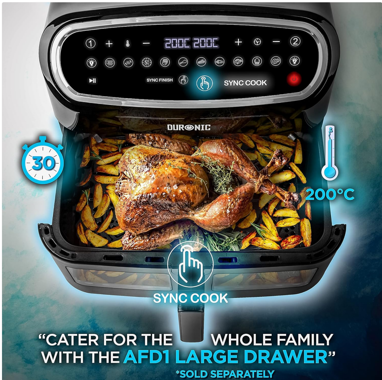
Figure 5.4: The Duronic AF24 utilizing the optional AFD1 large drawer to cook a whole chicken, demonstrating its expanded capacity.