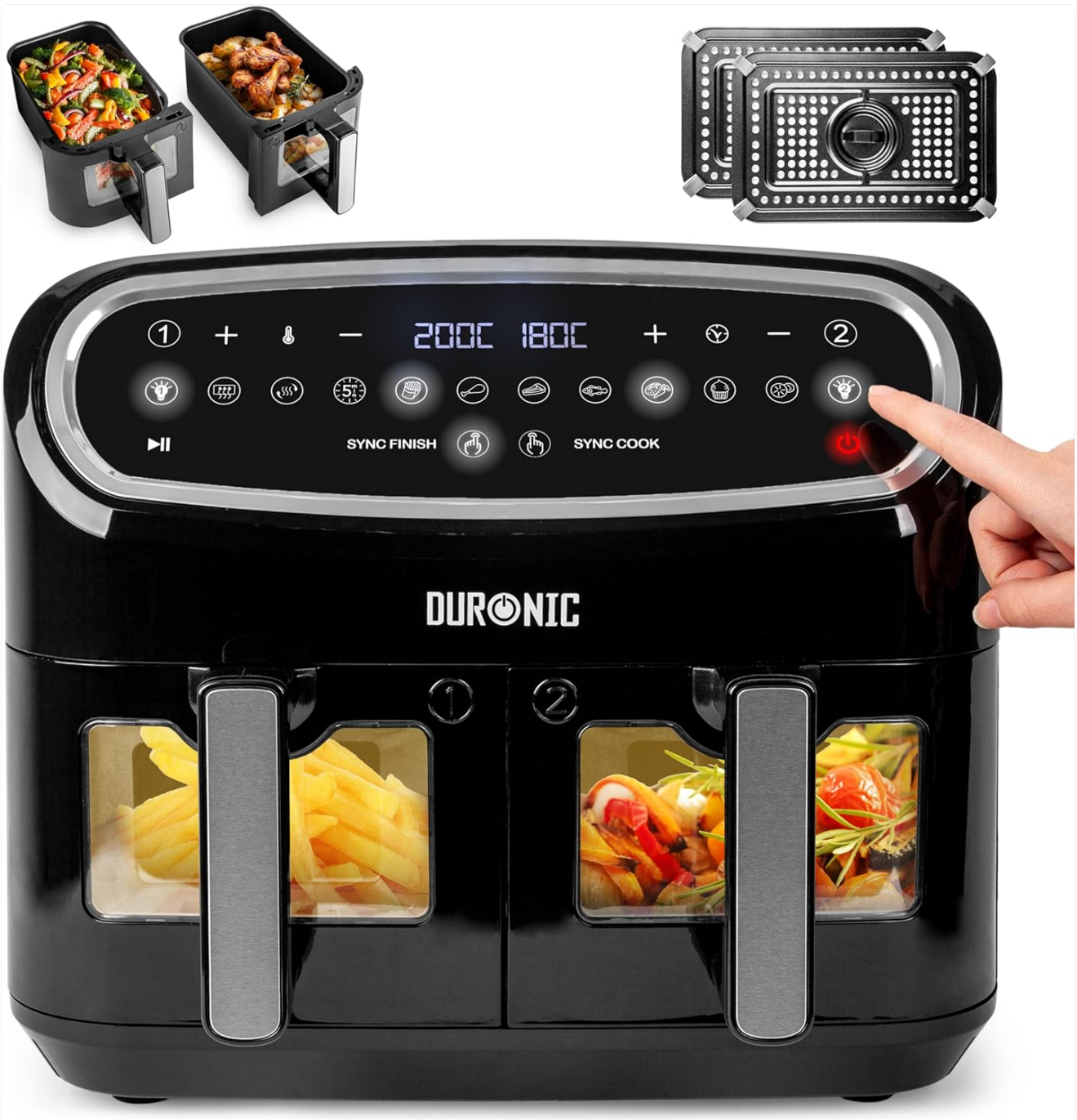
Figure 1.1: The Durotic AF24 Air Fryer, showcasing its dual baskets filled with food and the intuitive control panel.