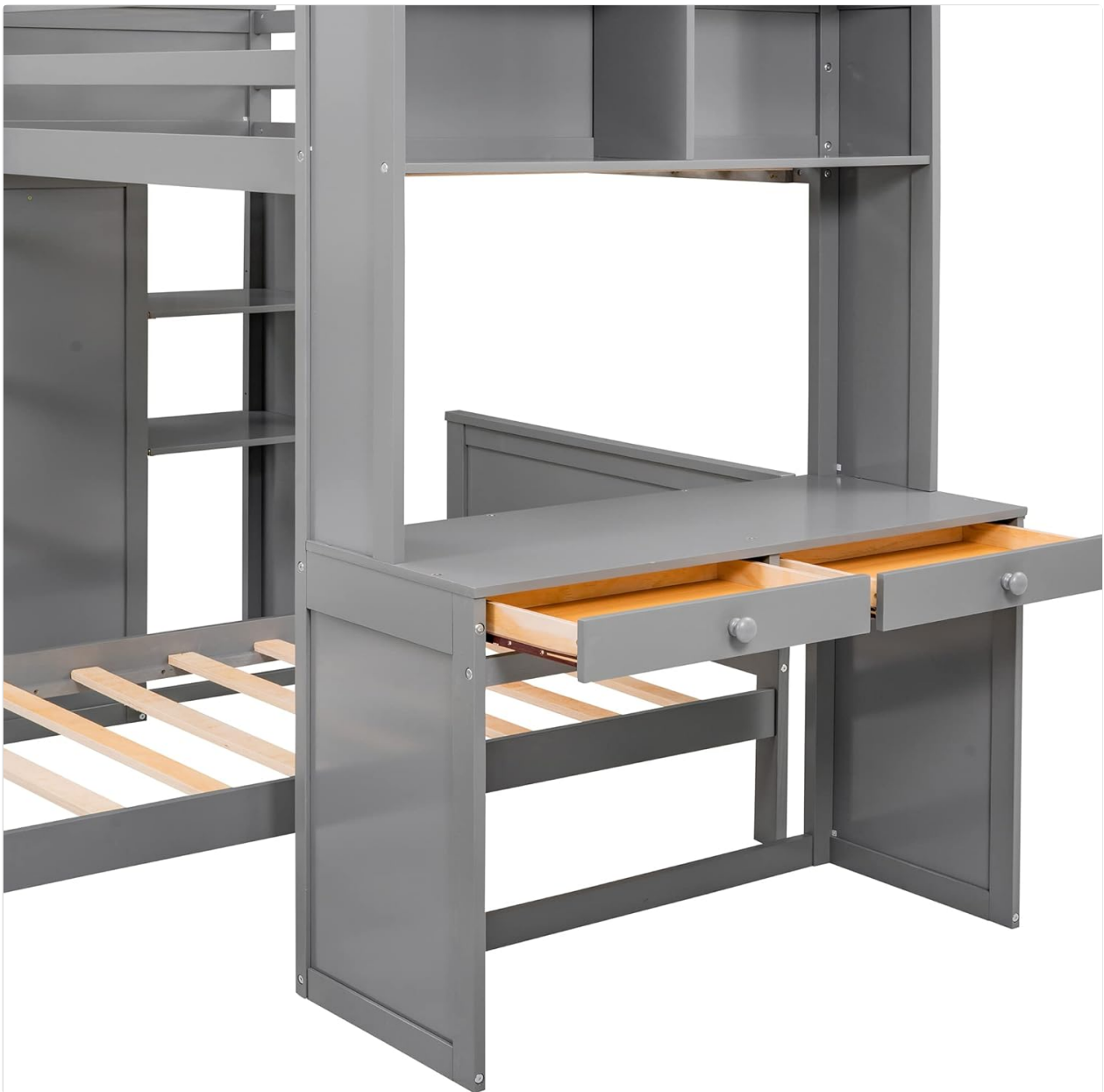
Image 6: Detail of the desk with its two drawers pulled open, illustrating the storage capacity.