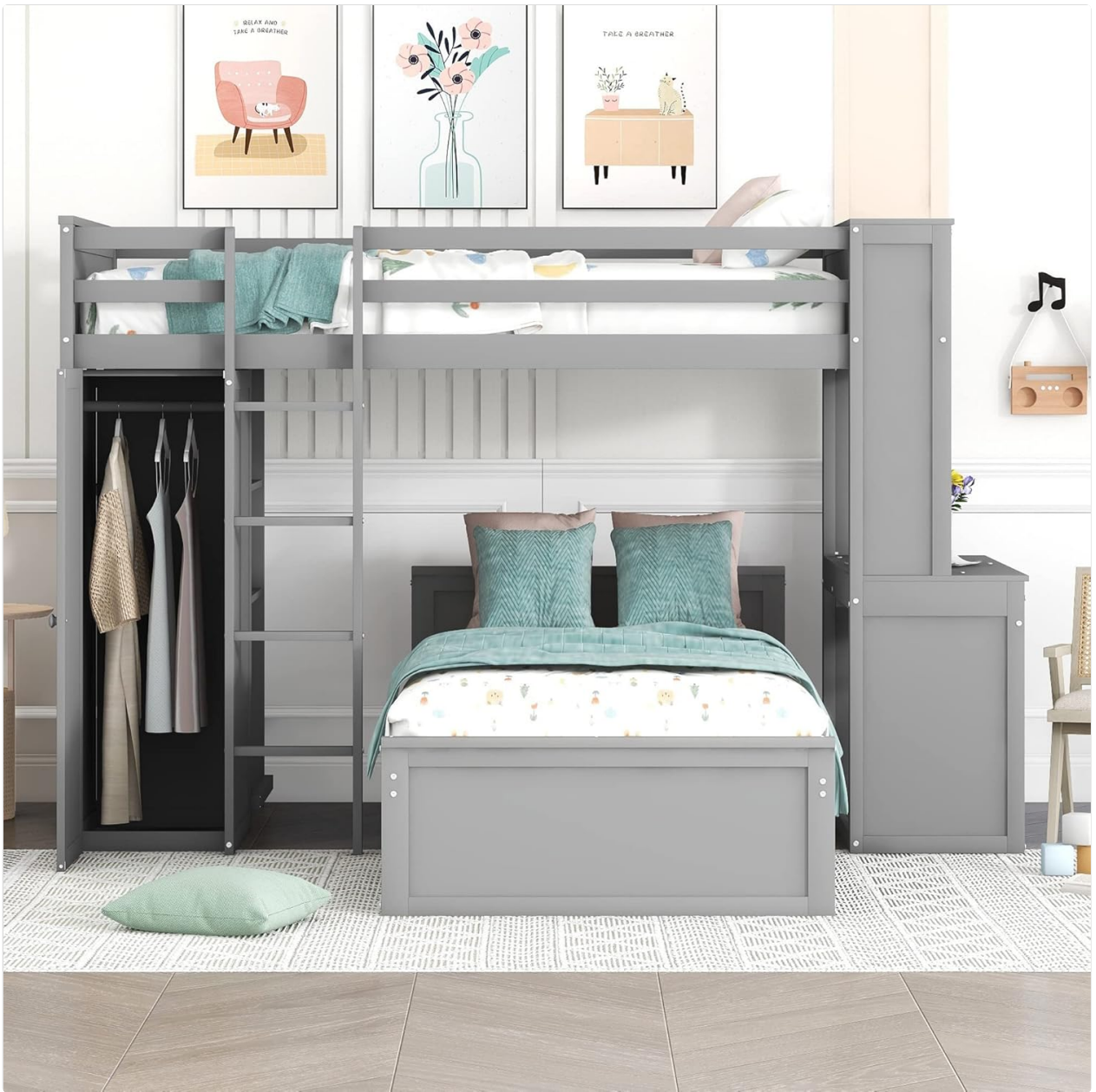
Image 3: A lifestyle view of the Bellemave bunk bed, showcasing its various components in a bedroom environment.