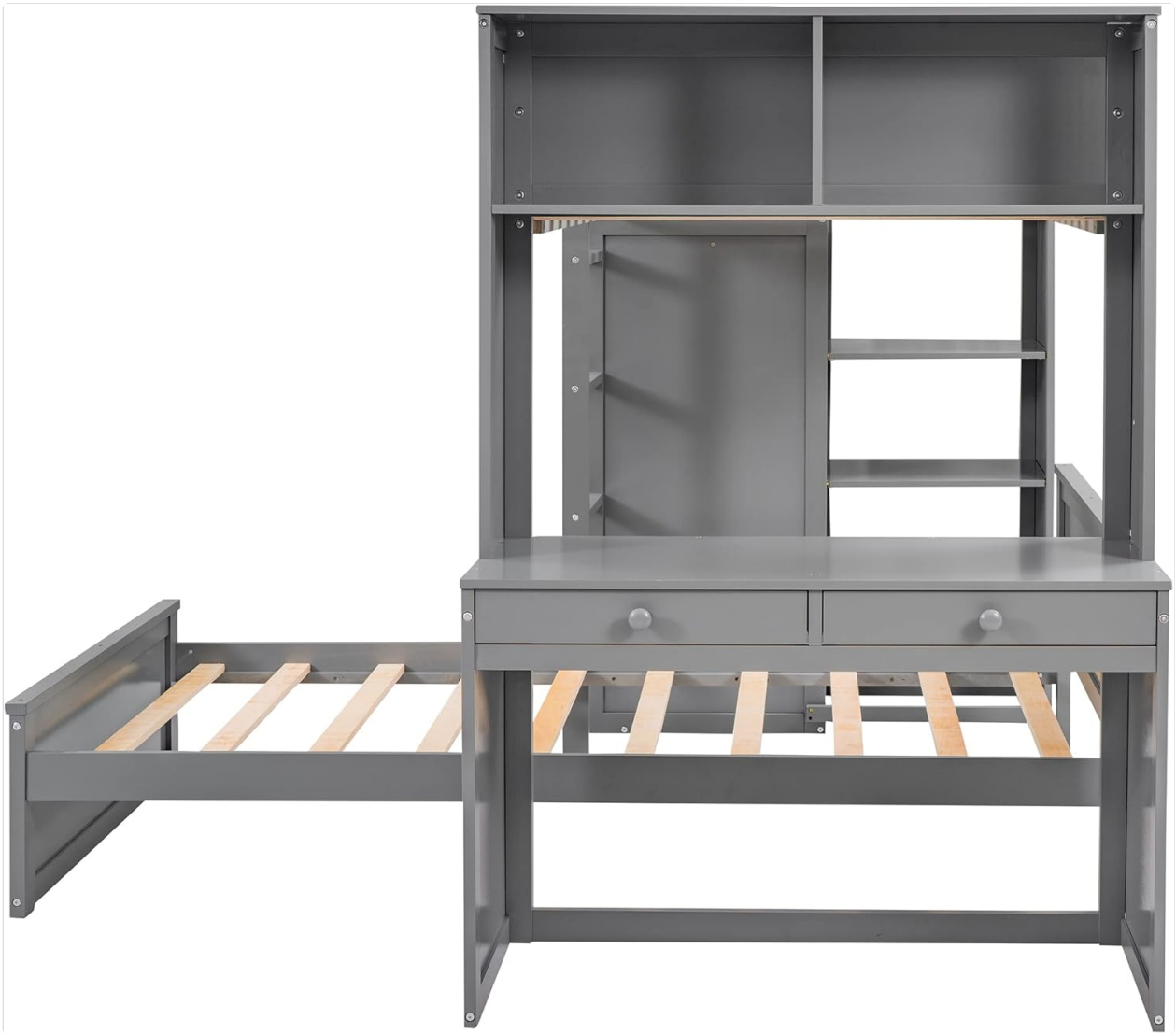
Image 5: Close-up view of the desk area, showing the desktop surface and the shelves above it.