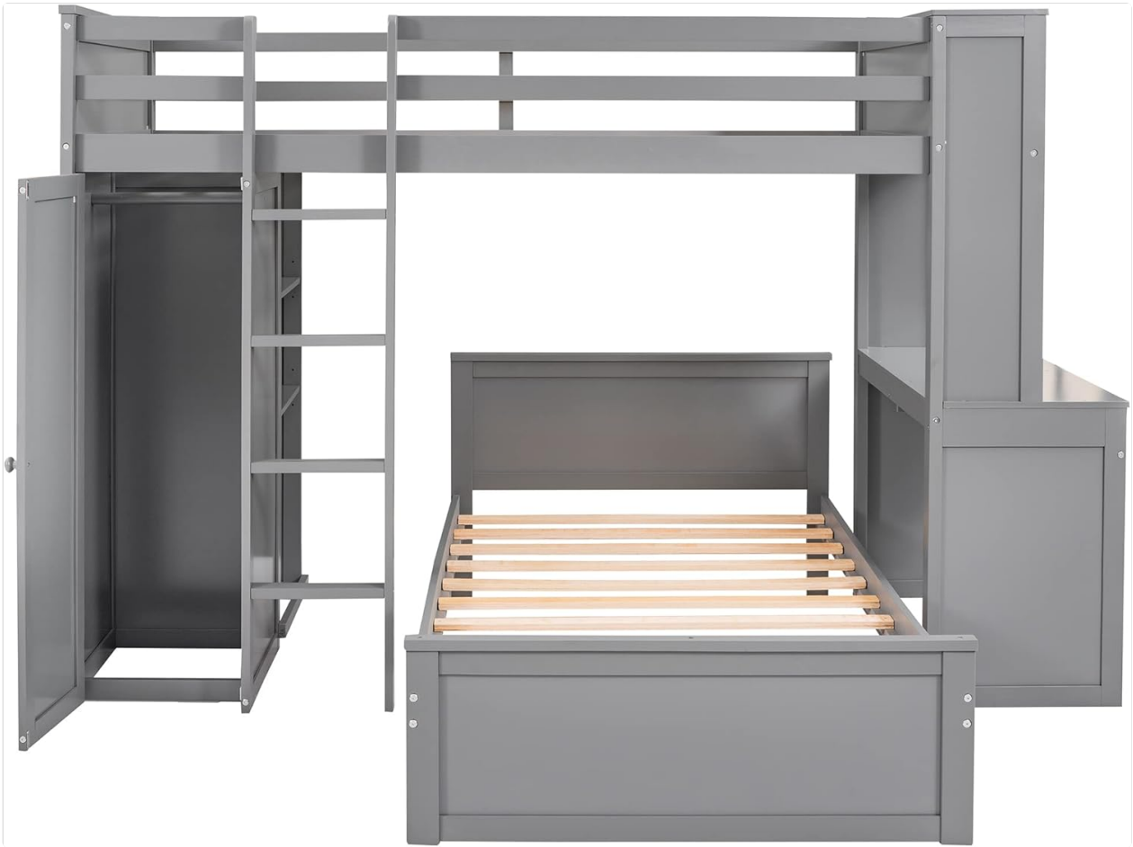
Image 4: Front view of the bunk bed, highlighting the open wardrobe section with a hanging pole.