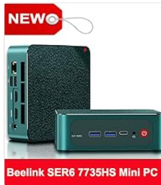
Figure 11.1: Steps to contact Beelink USA after-sales service through Amazon.

Your browser does not support the video tag.