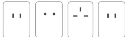
4.Power adapter (Optional: US /EU / UK/JP)