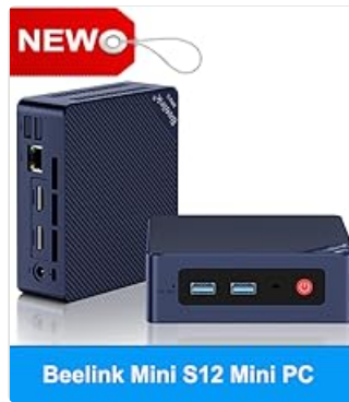
Figure 7.2: Enjoy your home life with the Beelink SEi12 Mini PC, perfect for streaming and multimedia.

Figure 7.1: The Beelink SEi12 Mini PC is ideal for various applications, including creative software and office suites.