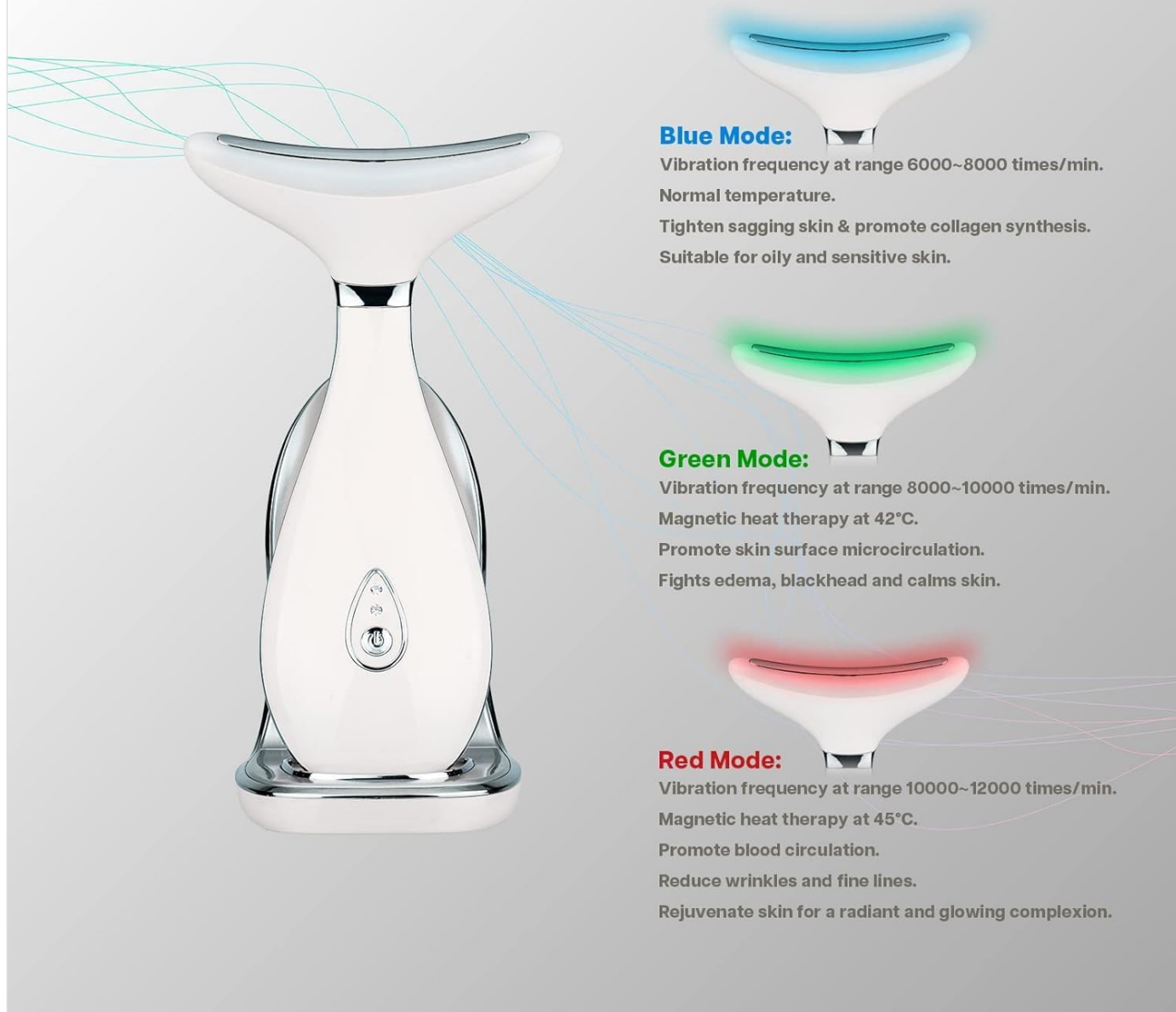
Image: Explanation of the different LED light modes and their functions.

starts with the mode at which you quit last time