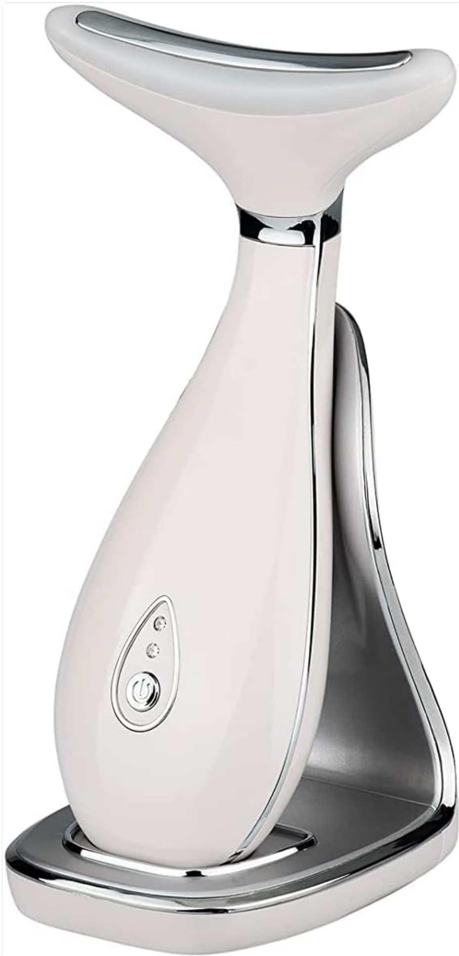
Image: VRAIKO Lily Neck & Face Massager in Pearl White with its charging stand.