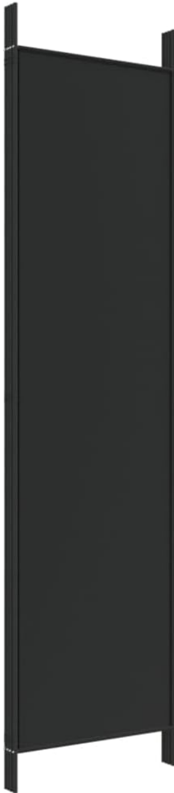
Image: Detail of a single panel, showing the fabric attached to the iron frame.