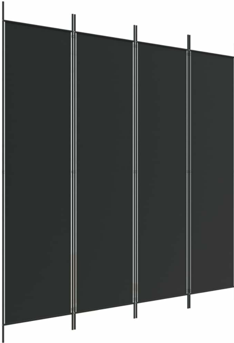
Image: The vidaXL 4-Panel Room Divider, black, set up in a room to create a private space.