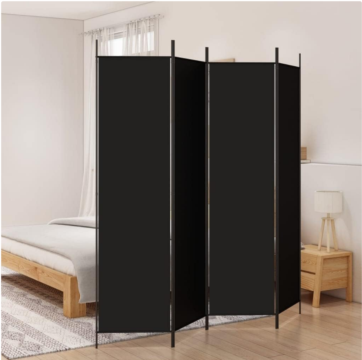
Image: The room divider fully extended, demonstrating its use for space separation.