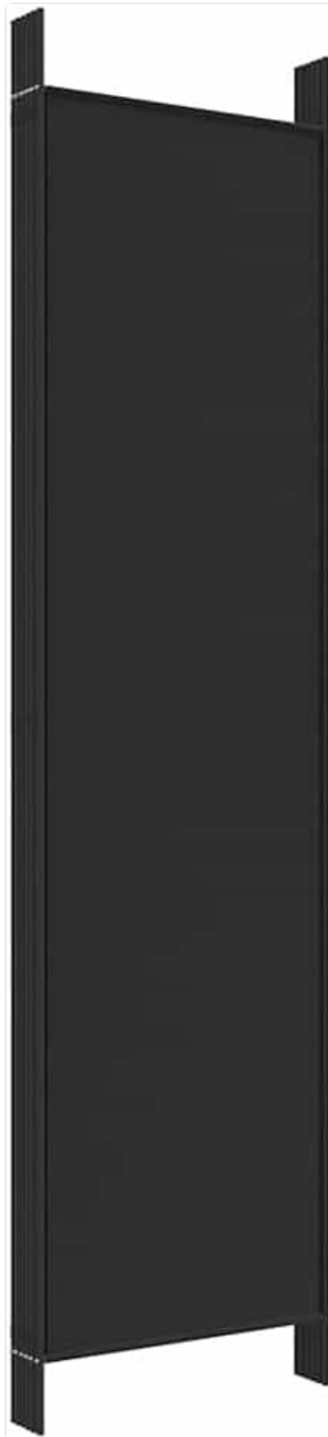
Image 3: A detailed view of an individual panel, highlighting the fabric and frame connection points, which is helpful during the assembly process.