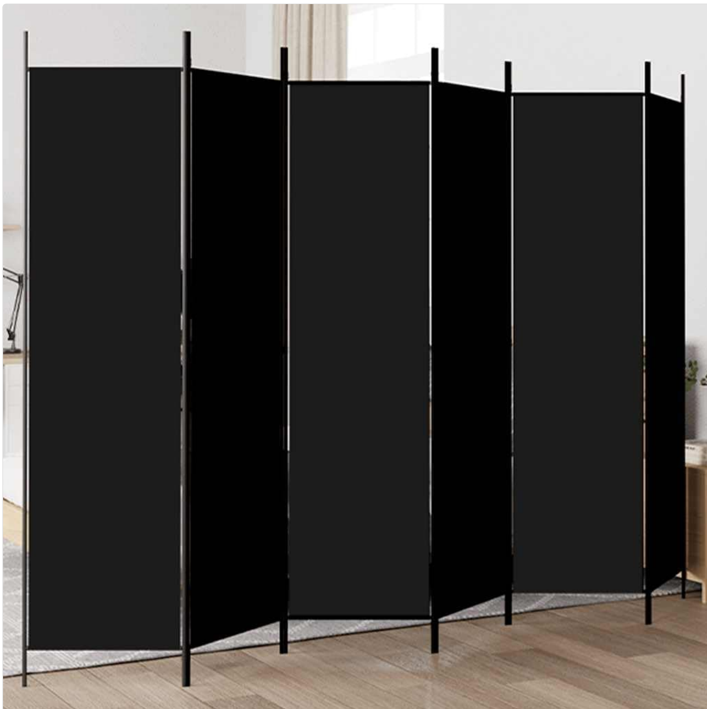
Image 1: The vidaXL Modern 6-Panel Room Divider in its fully assembled and unfolded state, providing privacy in a room.