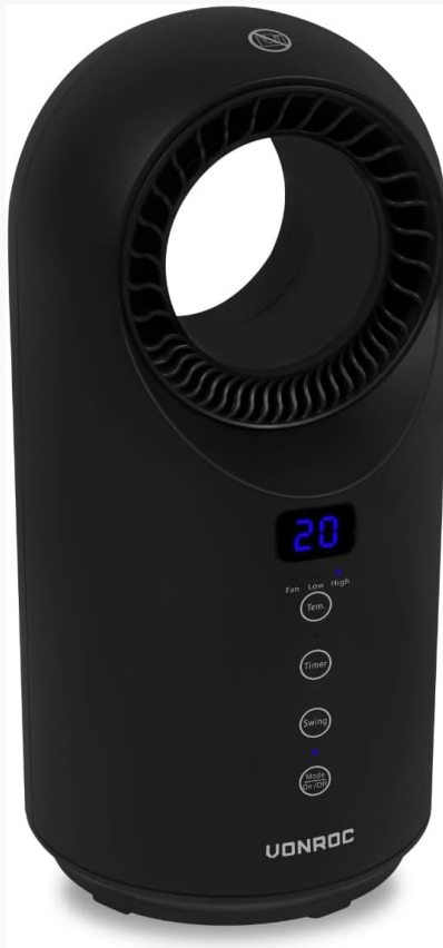
Image 1: Front view of the VONROC EH519AC Ceramic Fan Heater, showcasing its sleek black design, digital display, and control buttons.