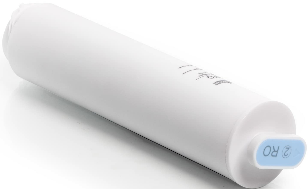
Image: Installation of the RO membrane filter into the system.