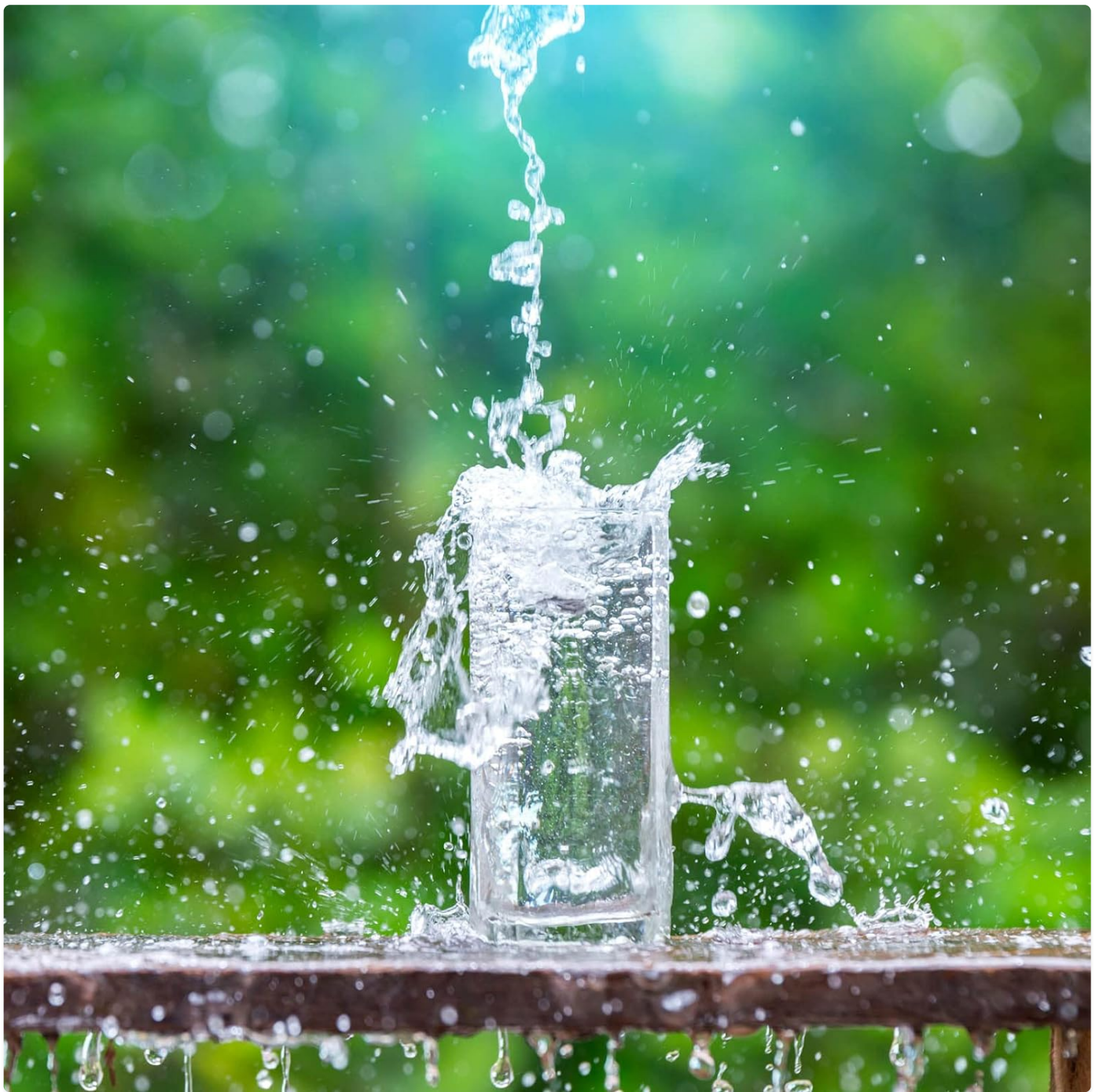
Image: Freshly purified water being poured into a glass.