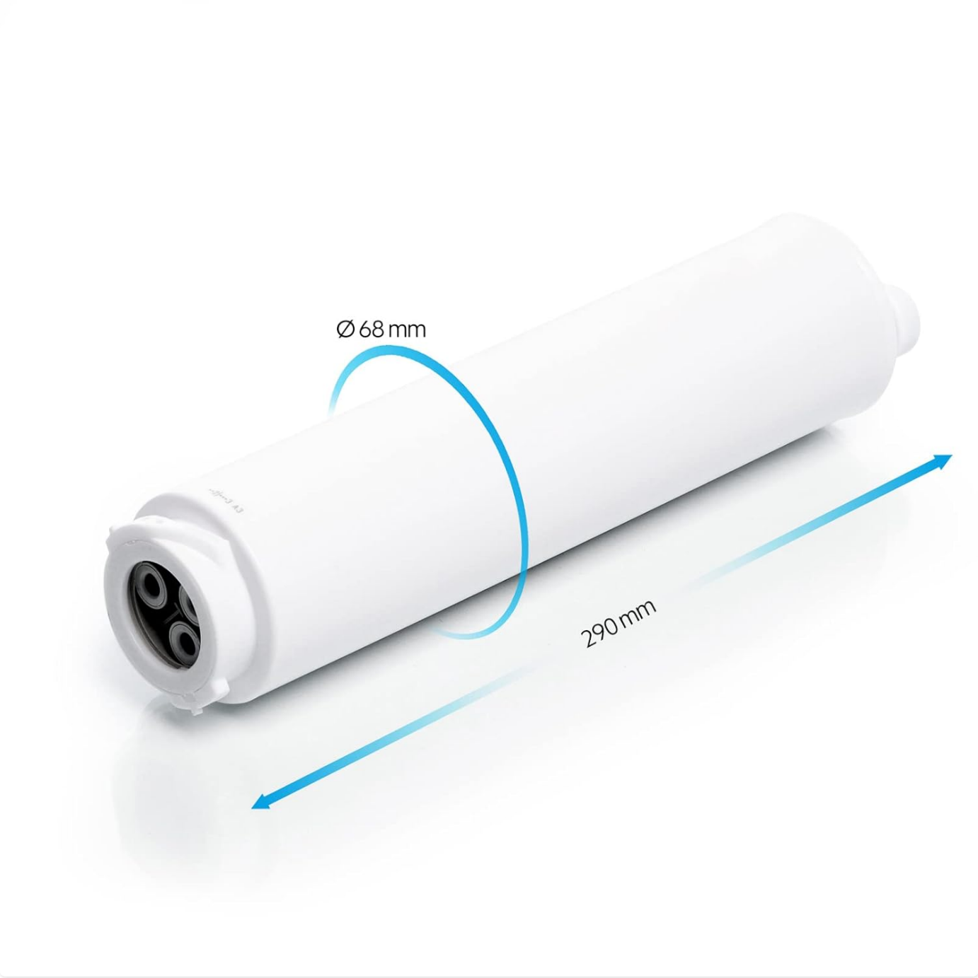
Image: Dimensions of the RO membrane filter.

This replacement filter is a consumable item. For specific warranty details regarding manufacturing defects, please refer to