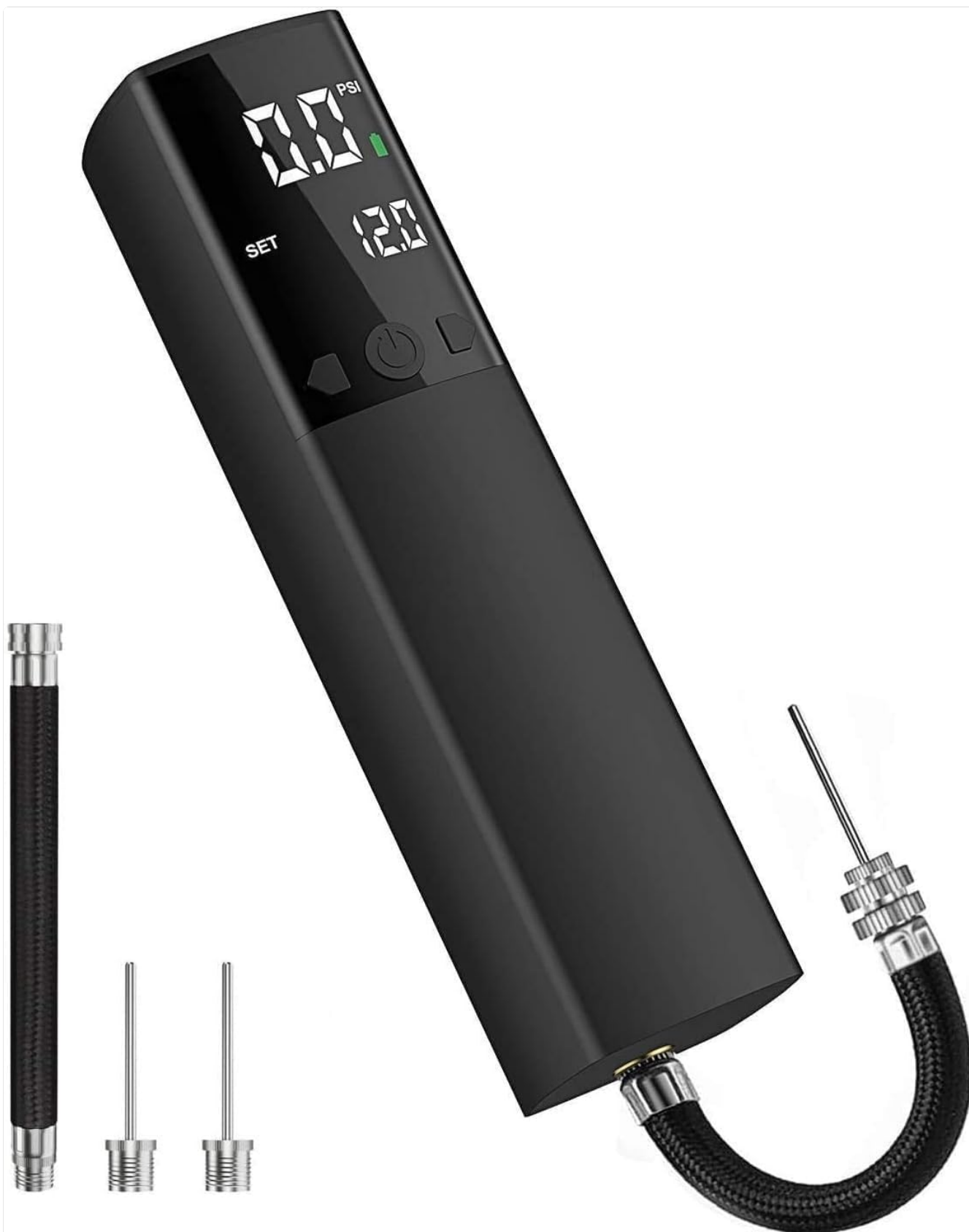
Figure 1: Pumteck Electric Ball Pump and its included accessories.