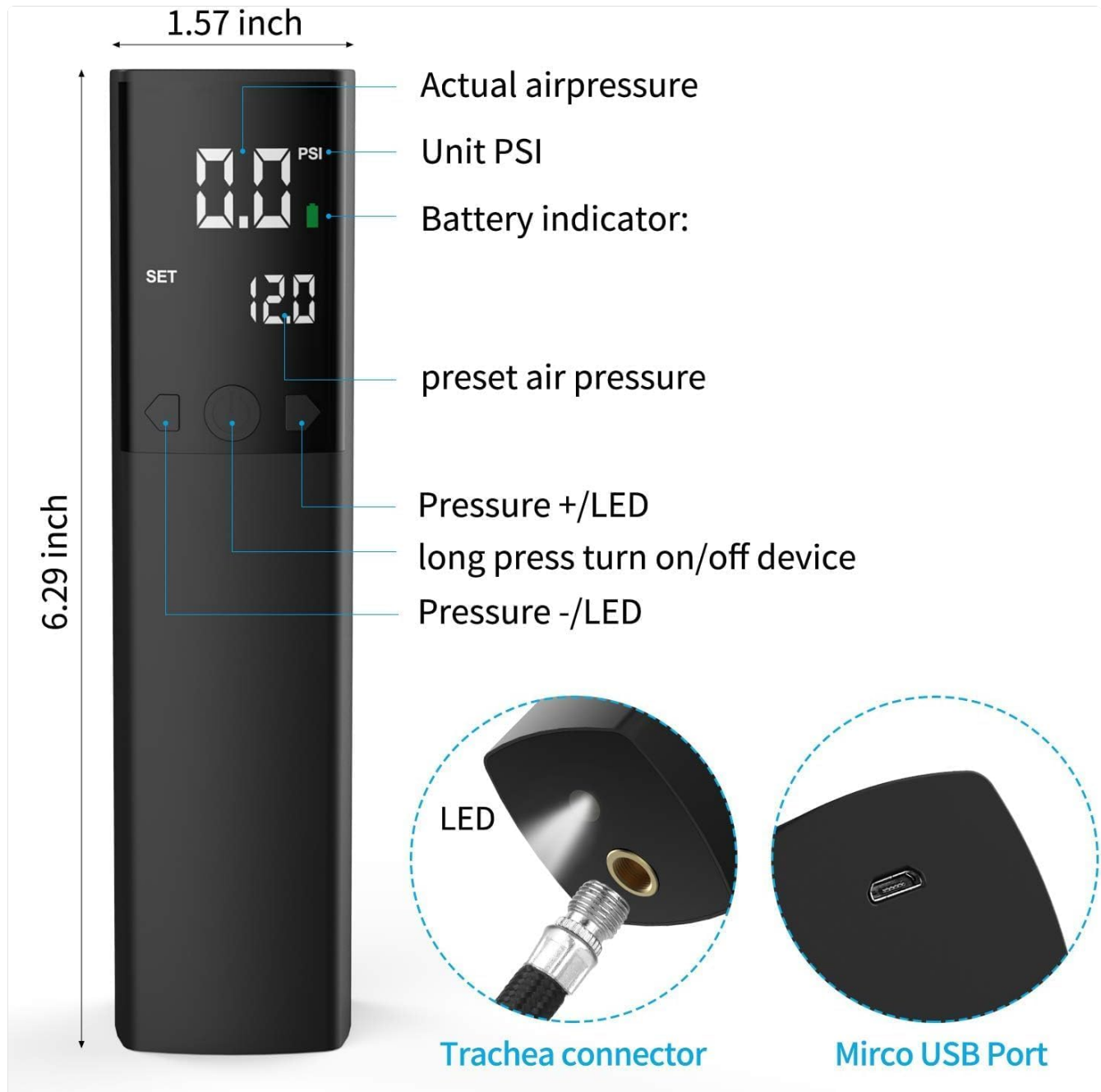
Figure 3: The Micro USB charging port is located at the top of the pump.

Before first use, fully charge the Pumteck Electric Ball Pump. Connect the provided USB charging cable to the Micro USB port on the pump and to a compatible USB power source (e.g., wall adapter, computer USB port). A full charge takes approximately 2 hours. The battery indicator on the LCD display will show charging status.