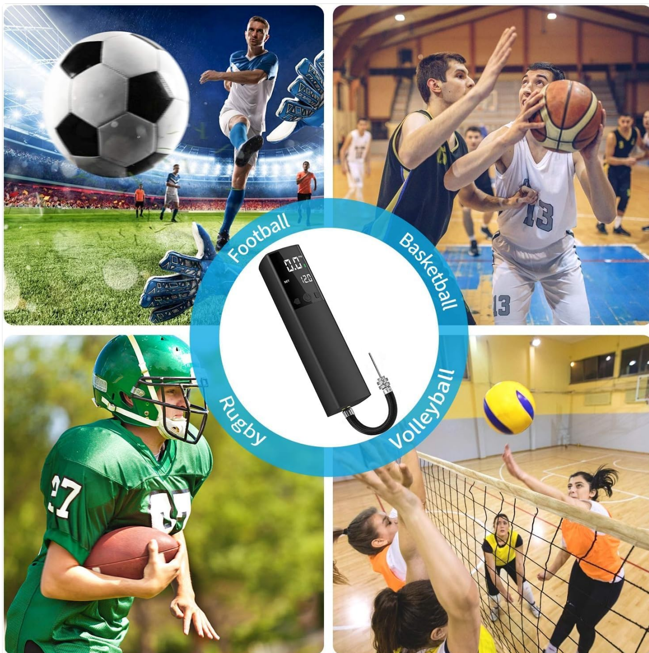
Figure 4: The pump comes with a ball needle and a 10cm air hose for flexible connection options.