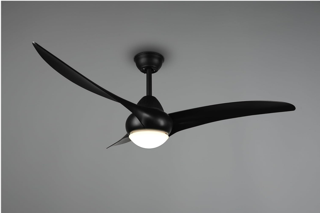
Image 5.2: The Alesund ceiling fan with its integrated LED light illuminated.