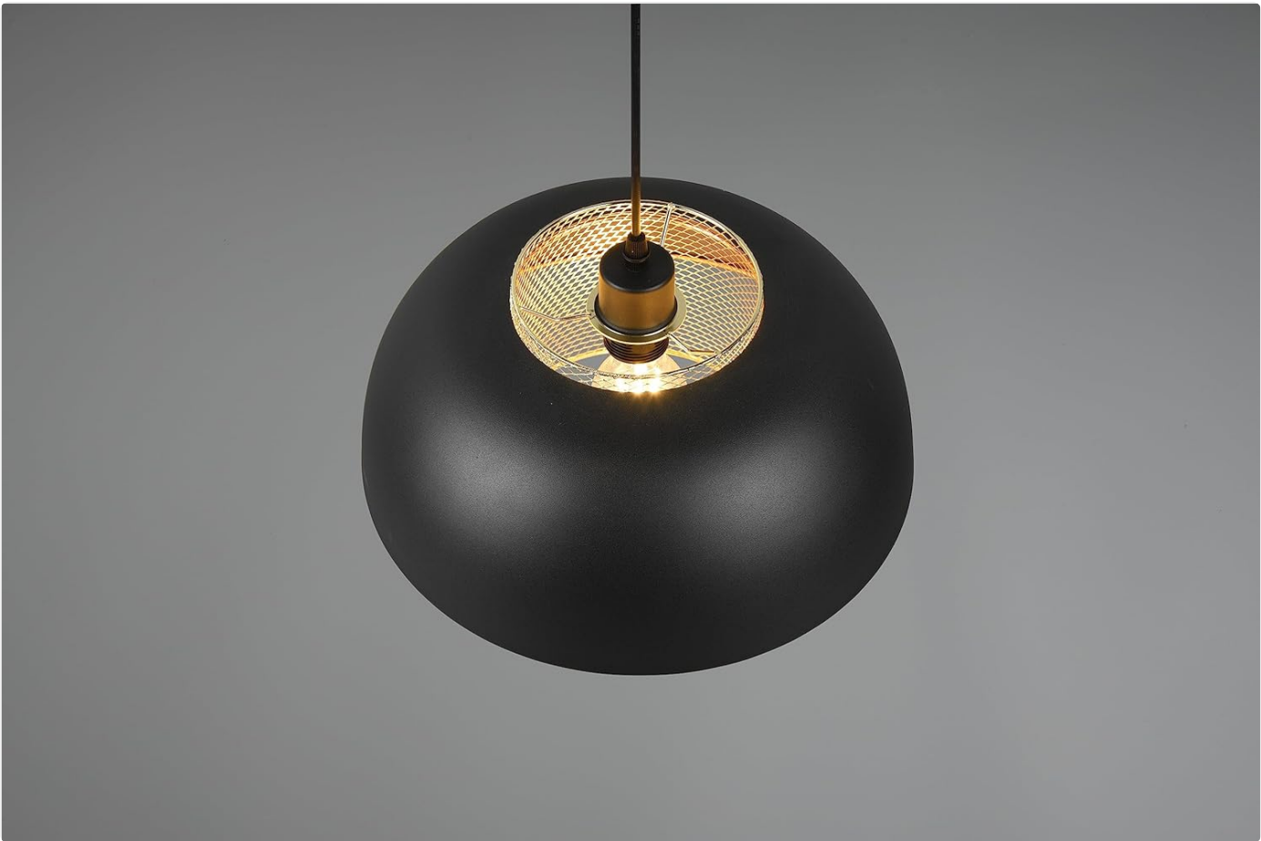
Image: A close-up view of the E27 bulb socket within the pendant light's shade, illustrating where the bulb is installed.