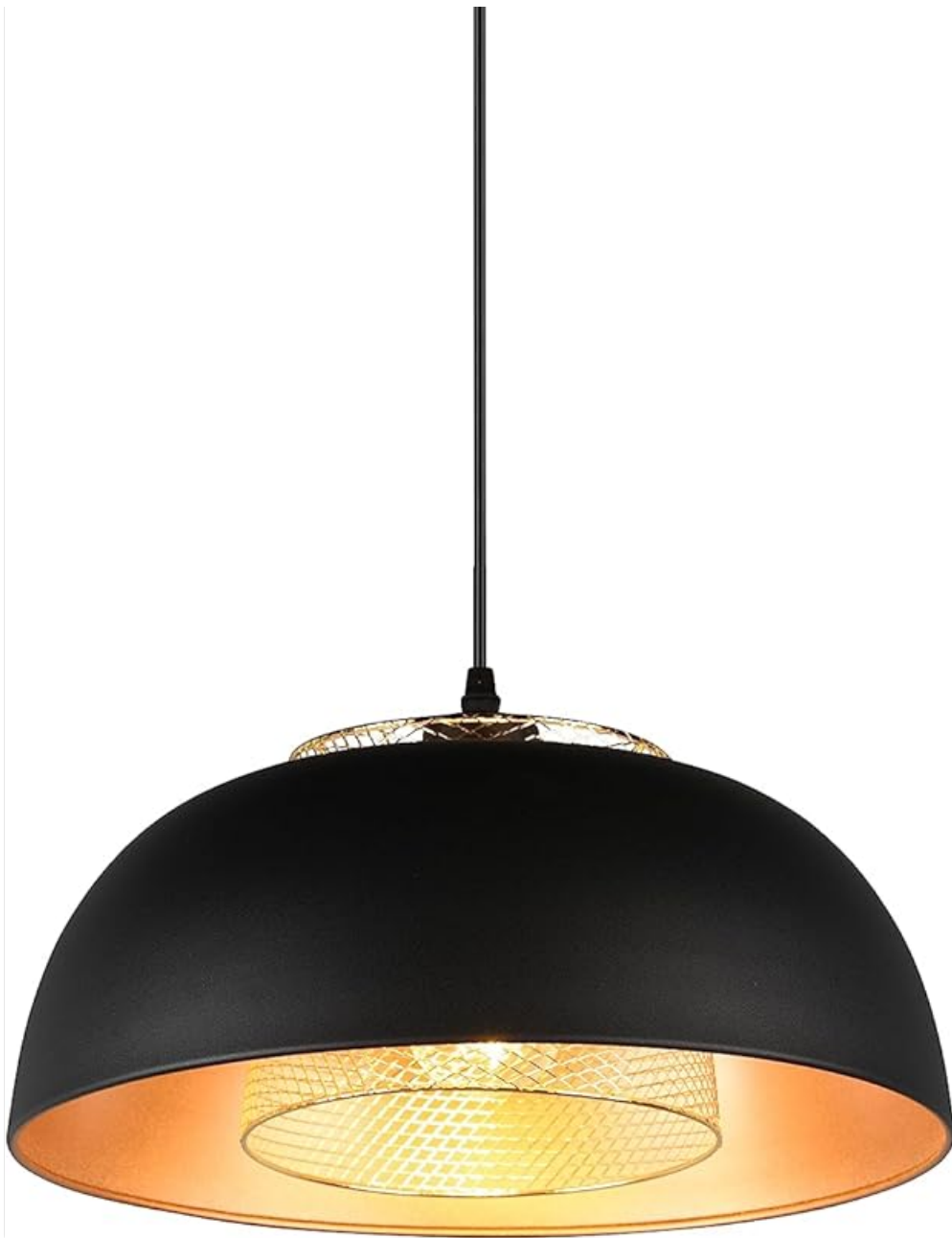
Image: The RL LIVE YOUR LIGHT Punch Pendant Light, showcasing its matte black exterior and gold-colored interior, suspended from the ceiling.