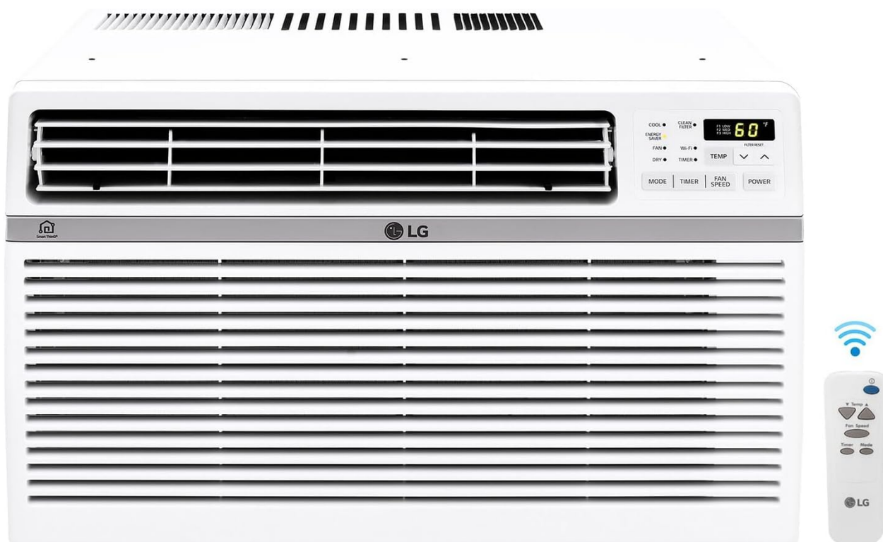
Figure 1: Front view of the LG LW1217ERSM1 Window Air Conditioner with remote control.

The LG LW1217ERSM1 is a 12,000 BTU window air conditioner designed for efficient cooling of spaces up to 550 square feet. This unit integrates LG ThinQ® technology, enabling remote operation via smartphone or voice commands through Amazon Alexa and Google Assistant. It features three cooling and fan speeds, a 24-hour on/off timer for customized cooling schedules, and a 4-way air deflection system for even air distribution. The LW1217ERSM1 operates quietly, with sound levels as low as 53 dB in low mode. User-friendly features include an LED display, a simple selection control panel, and a full-featured remote control. An auto-restart function ensures the unit resumes previous settings after a power outage. The washable filter with a Clean Filter Alert helps maintain optimal performance and indoor air quality.