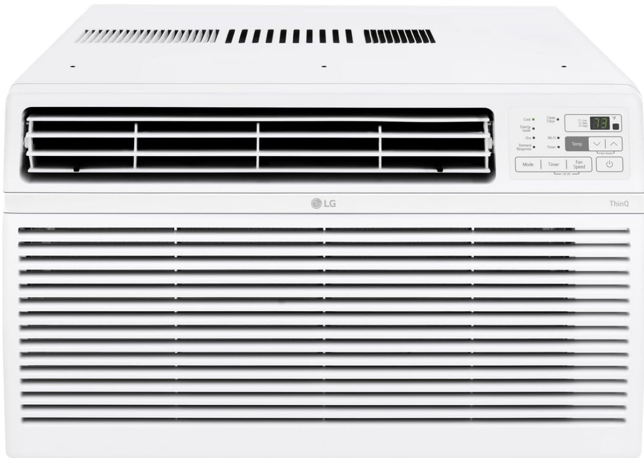
Figure 4: Close-up of the LG LW1217ERSM1 control panel.

The included remote control allows you to adjust all settings from anywhere in the room. It features buttons for Power, Mode, Fan Speed, Temperature adjustment, Timer, Sleep, and Energy Saver.