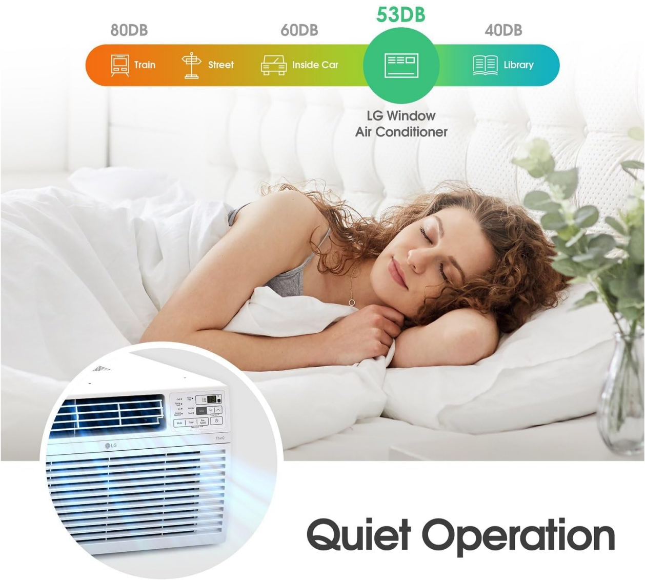
Figure 8: The LG LW1217ERSM1 operates quietly, comparable to a library setting.