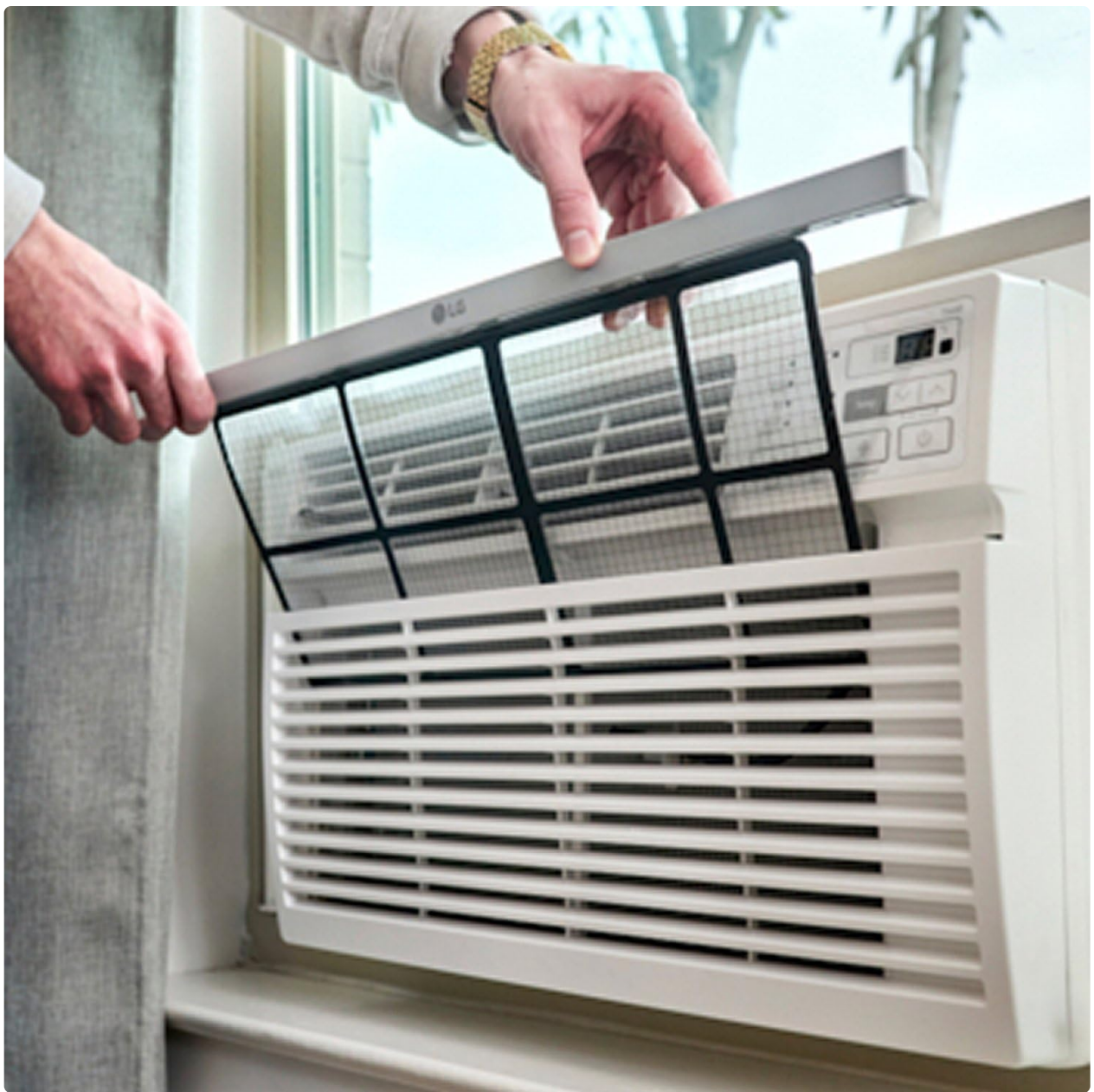
Figure 6: User removing the washable filter from the LG LW1217ERSM1 for cleaning.