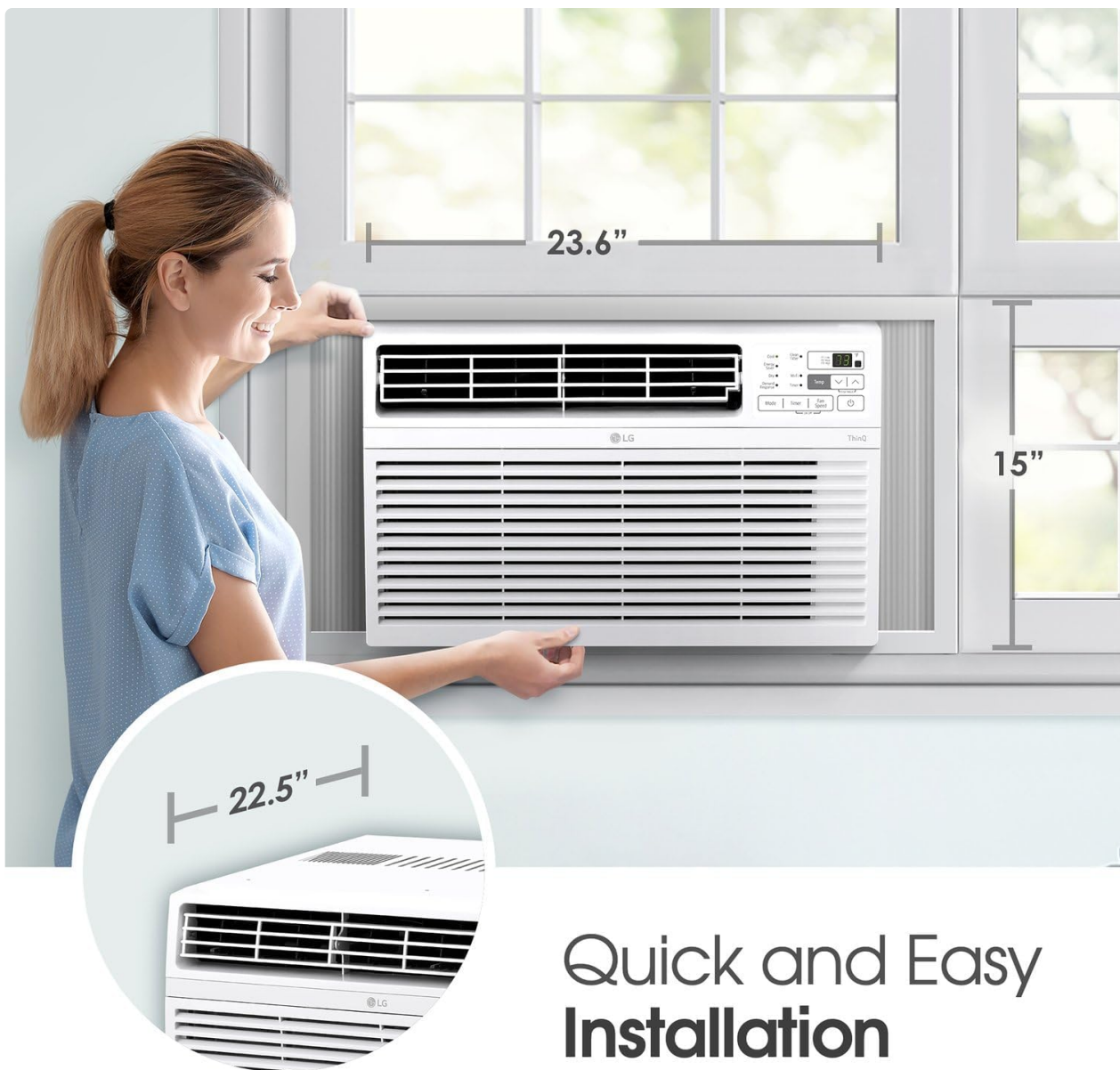
Figure 3: Dimensions for quick and easy installation of the LG LW1217ERSM1.