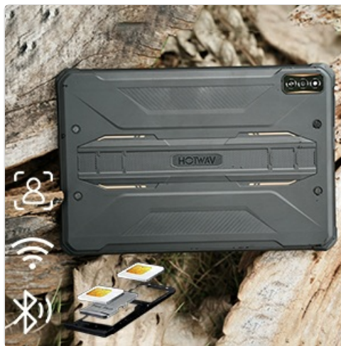
Figure 3: Illustration of the dual SIM card and MicroSD card tray.