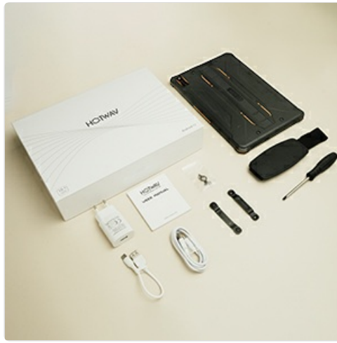
Figure 2: Packaging contents including the tablet, charger, cables, and accessories.