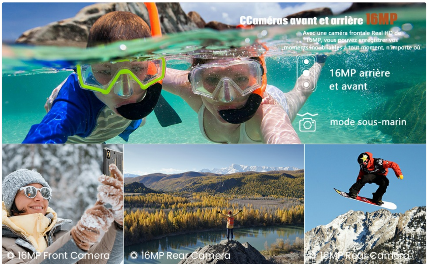
Figure 6: Demonstrating the 16MP front and rear cameras, including the underwater photography mode.