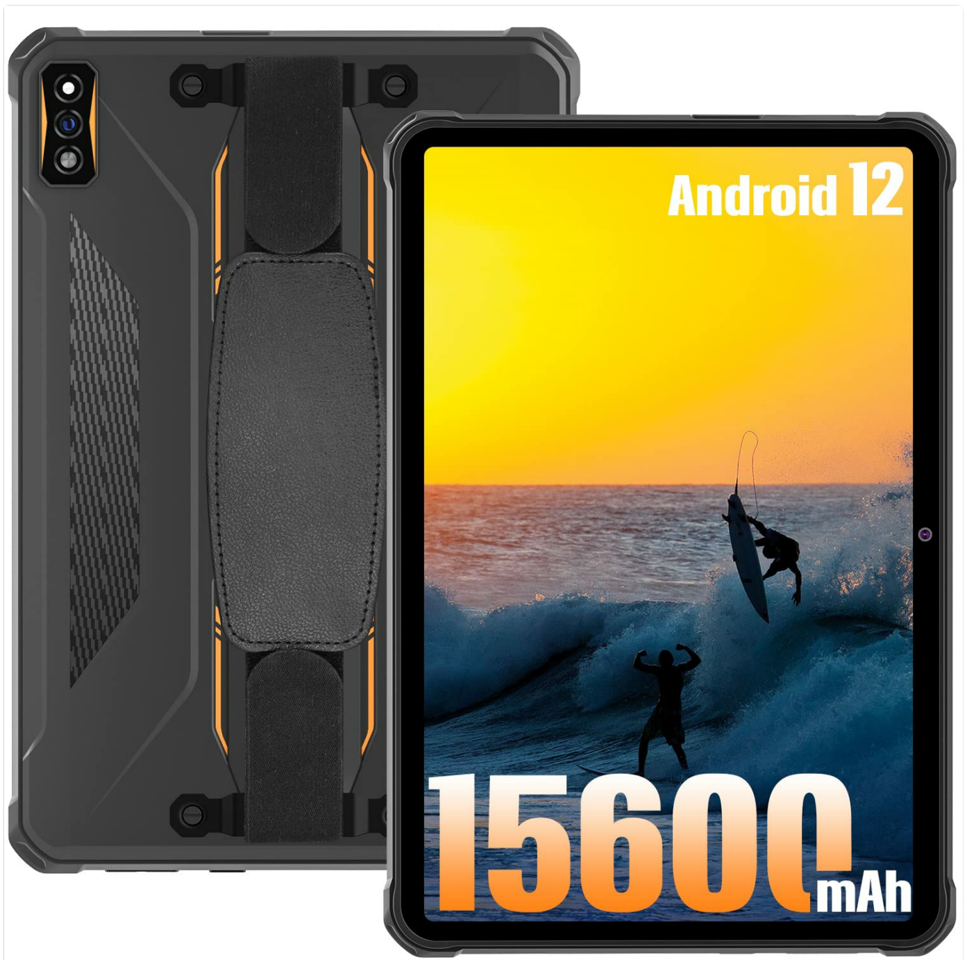
Figure 1: The HOTWAV R5 rugged tablet, showcasing its robust design.