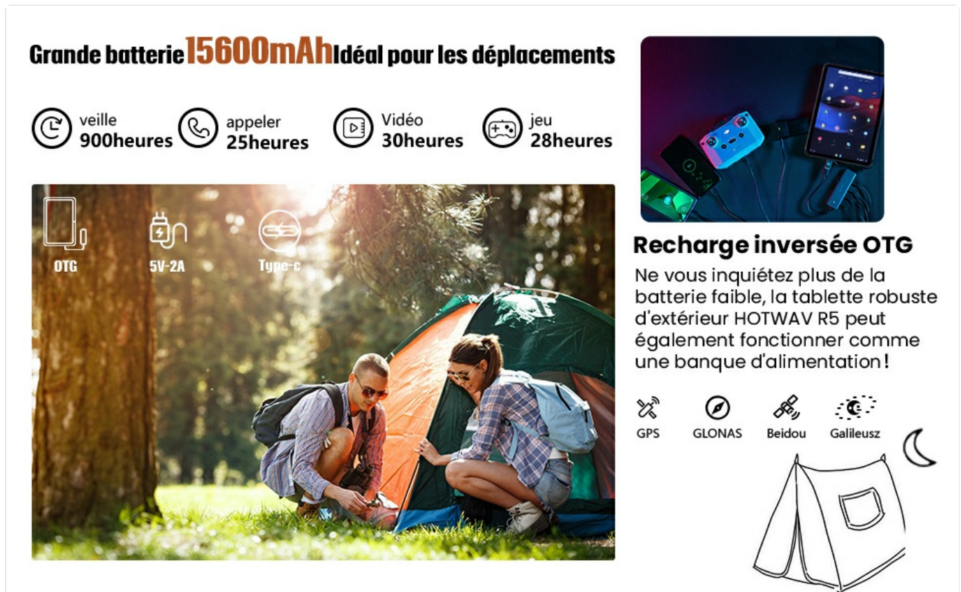
Figure 4: The HOTWAV R5 tablet highlighting its 15600mAh battery and OTG reverse charging capability.

The tablet also supports OTG (On-The-Go) reverse charging, allowing it to act as a power bank for other devices using the OTG cable.