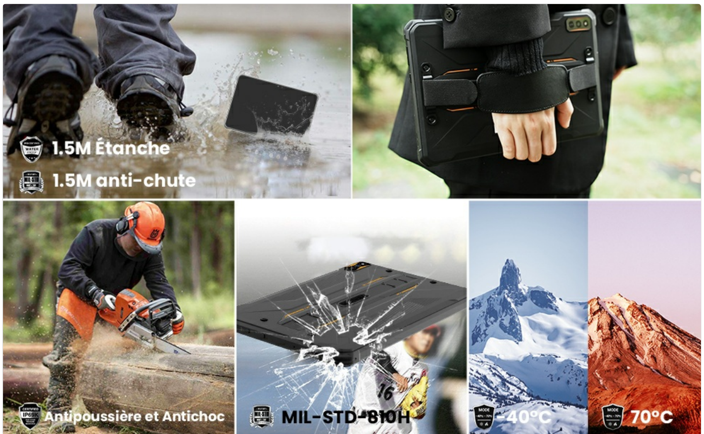
Figure 7: The HOTWAV R5 demonstrating its resistance to water, drops, and dust, certified by IP68, IP69K, and MIL-STD-810H standards.