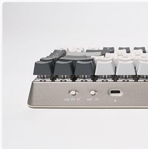
Figure 2: Side view illustrating connectivity and OS switches.