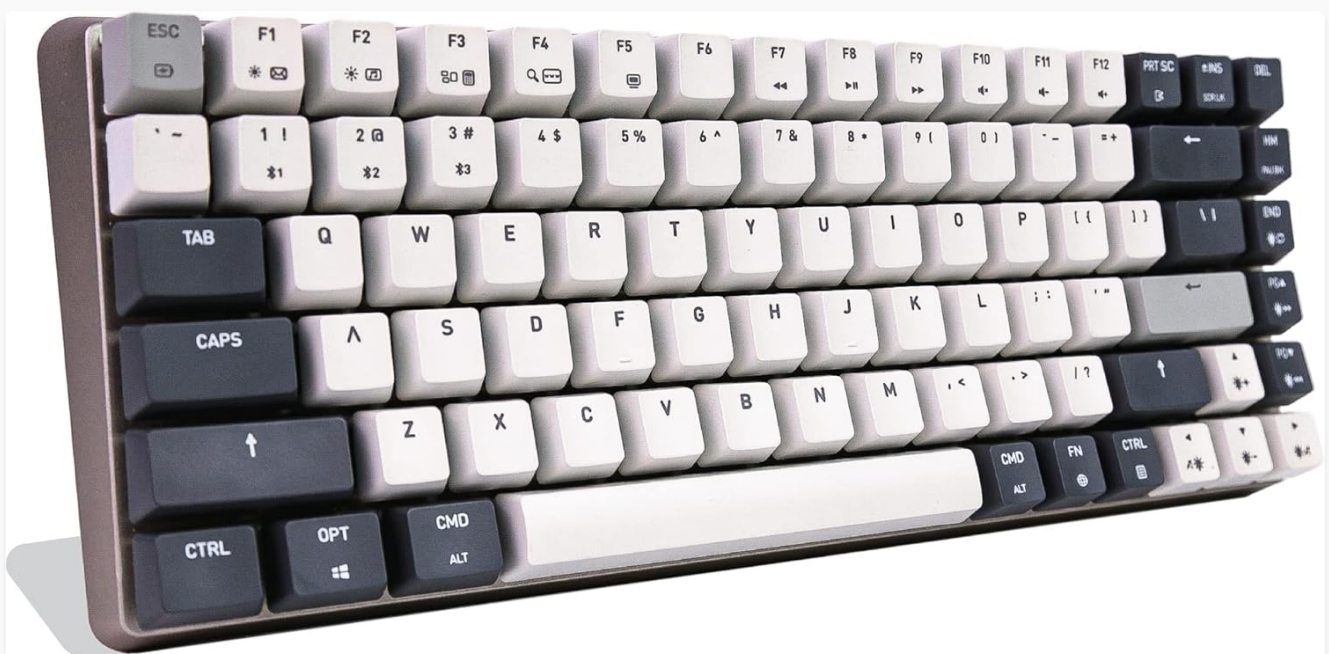
Figure 1: Azio Cascade 75% Mechanical Keyboard (Galaxy Light)

The Azio Cascade 75% Mechanical Keyboard is a compact, customizable input device designed for various computing environments. It features a 75% layout, retaining essential function keys while minimizing desk space. This keyboard supports both wired USB-C and wireless Bluetooth 5.0 connectivity, compatible with up to three devices simultaneously. It is designed for use with both Mac and PC operating systems, offering dedicated keycaps for each layout. Key features include hot-swappable switches and keycaps, RGB backlighting, and dual sound dampening layers for an enhanced typing experience.