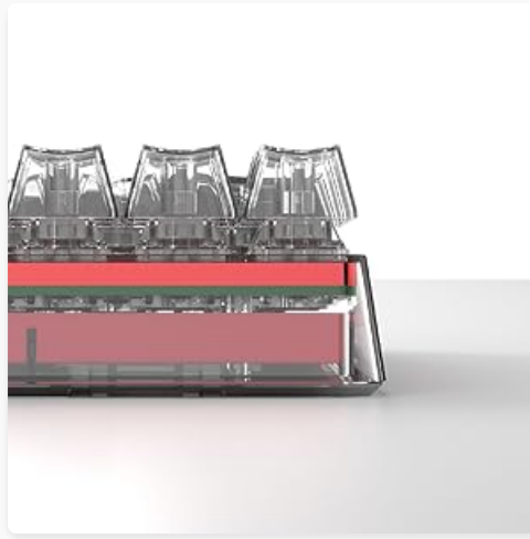
Figure 5: Internal structure with dual sound dampening layers.