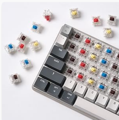
Figure 4: Hot-swappable switches and keycaps.