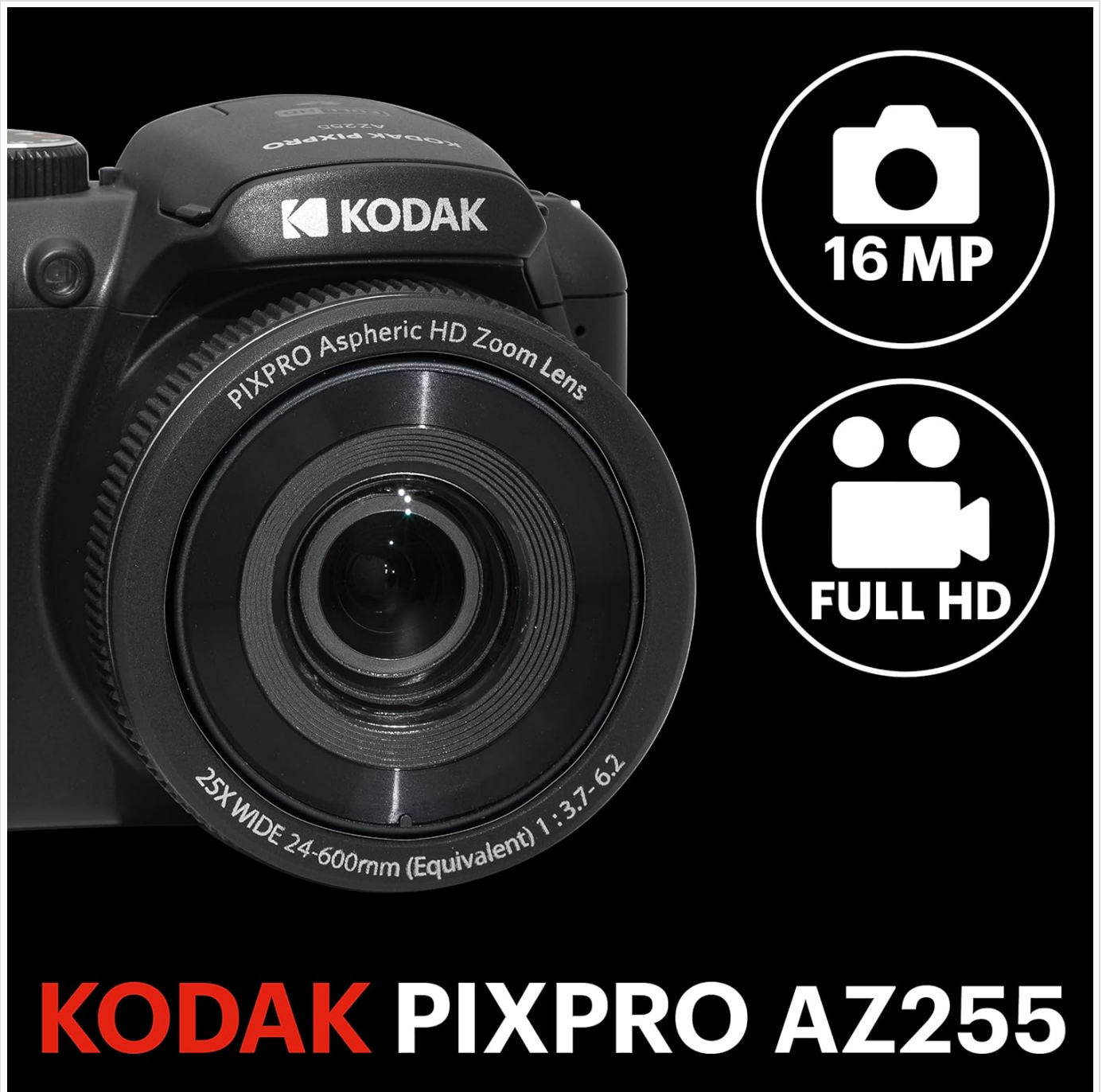
Image: The KODAK PIXPRO AZ255 offers 16 Megapixel photos and Full HD video recording.