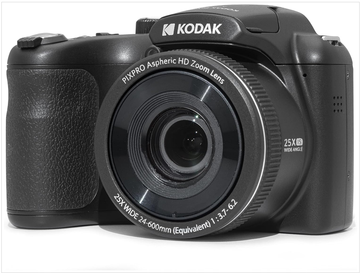
Image: Front view of the KODAK PIXPRO AZ255-BK camera, showing the lens and brand logo.