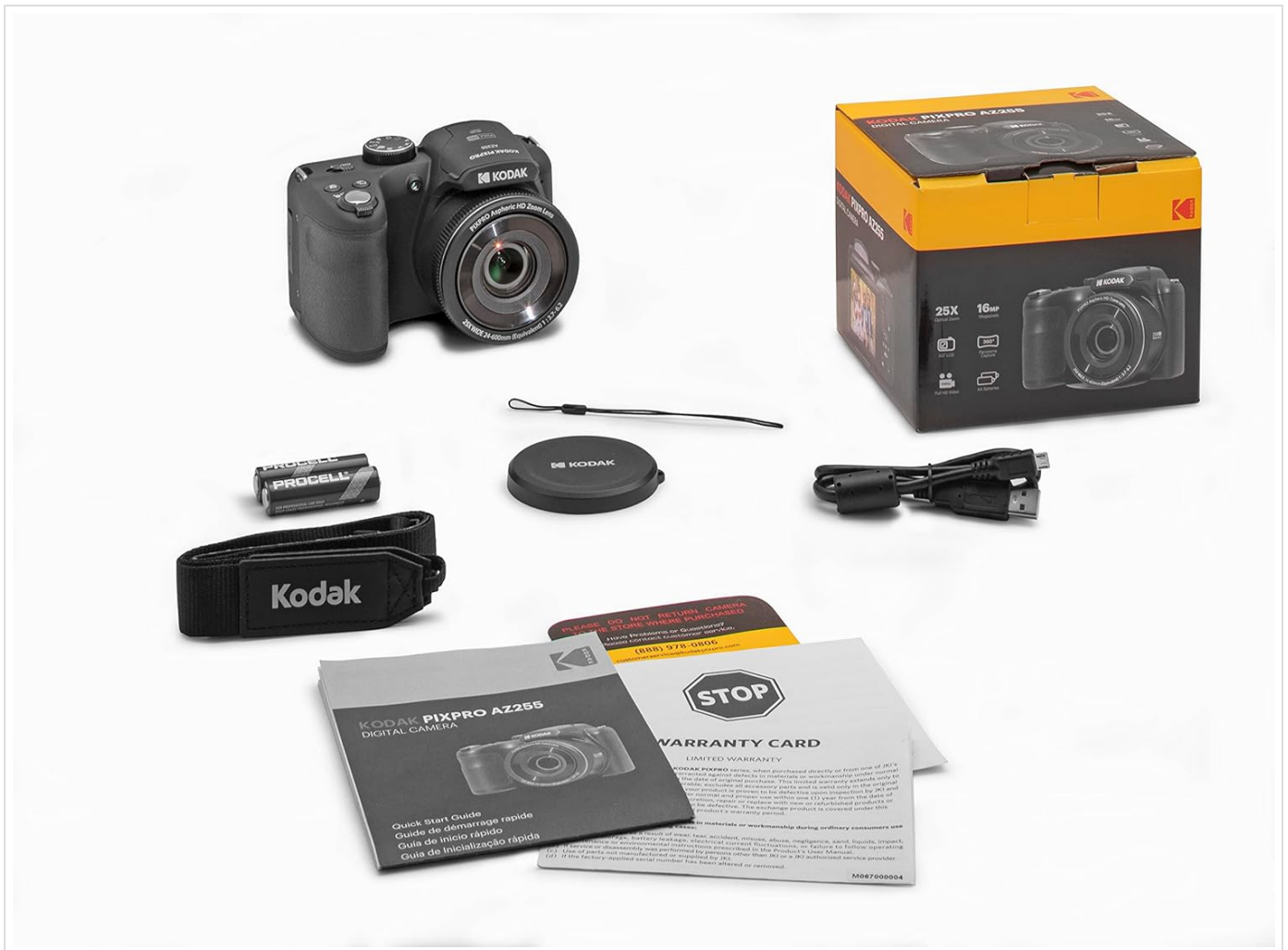
Image: All components included in the KODAK PIXPRO AZ255-BK retail package.

Video: Official unboxing of the KODAK PIXPRO AZ255, showing all included accessories and the camera itself.