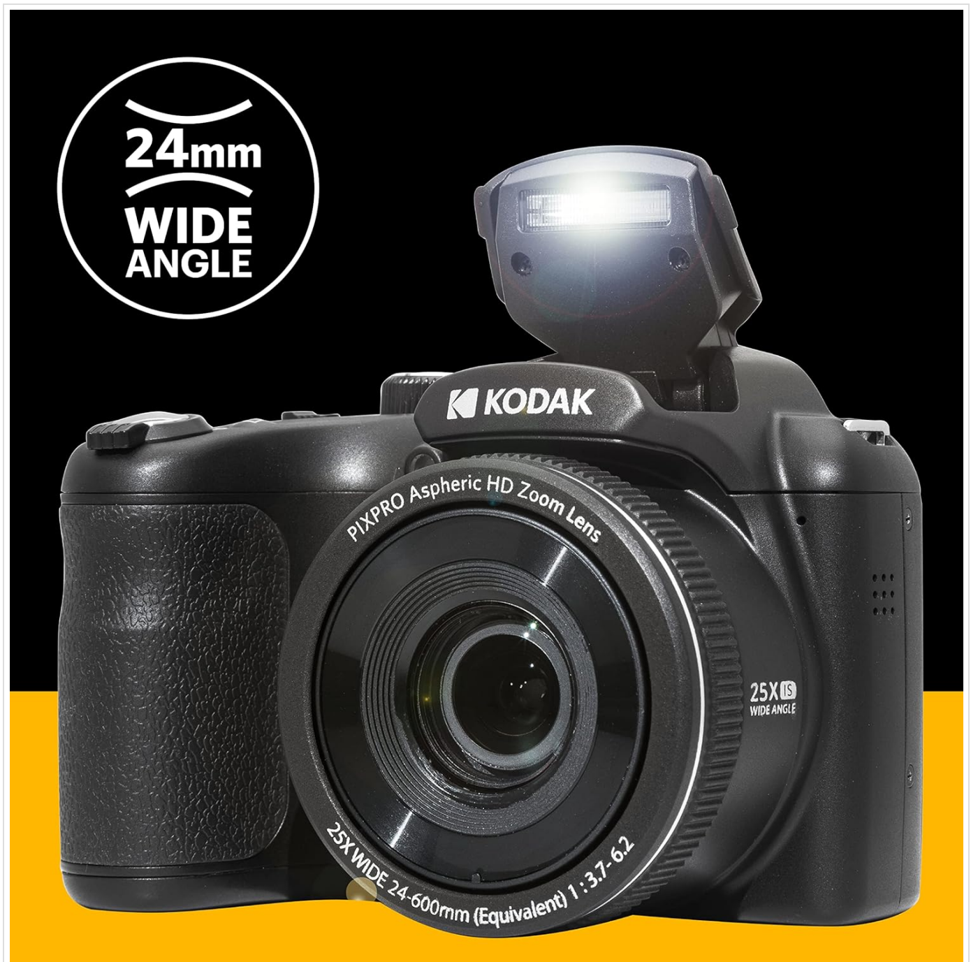
Image: The 24mm wide-angle lens captures more of the scene.