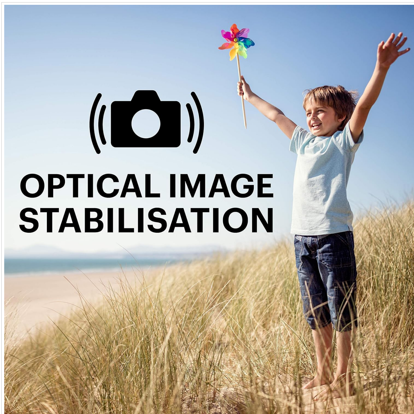
Image: Optical Image Stabilization helps keep your shots steady and clear.